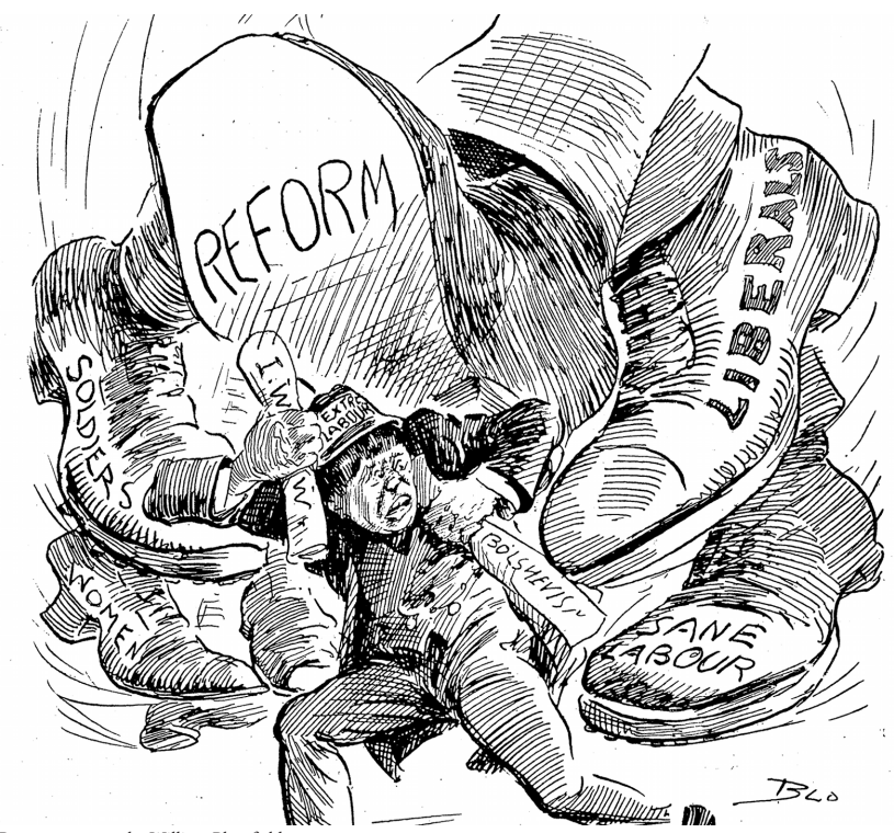
Post-war cartoon by William Blomfield. NZ Observer, 13 December 1919

For those in power monitoring these developments, the possibility of a general strike seemed imminent. Recorded industrial disputes had risen from 8 in 1915 to 75 in 1921. As a result, Prime Minister Massey urged his Reform party faithful to "secure good men to stem the tide of Anarchy and Bolshevism." This radical tide, complained Massey, "is worse than folly... the matter must be taken in hand and stopped." <sup>50</sup>