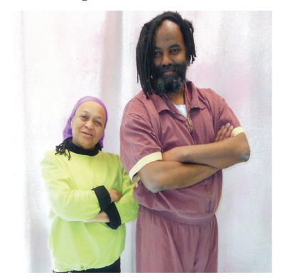
Pam Africa & Mumia Abu-Jamal Feb. 2012

sentence hearing or be removed from death row