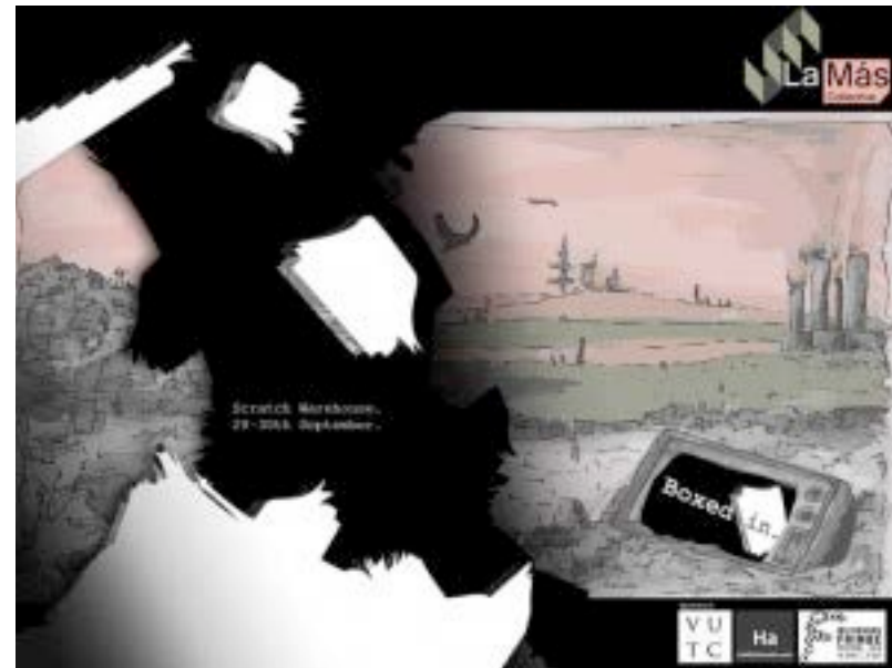
Poster for La Mas Collective