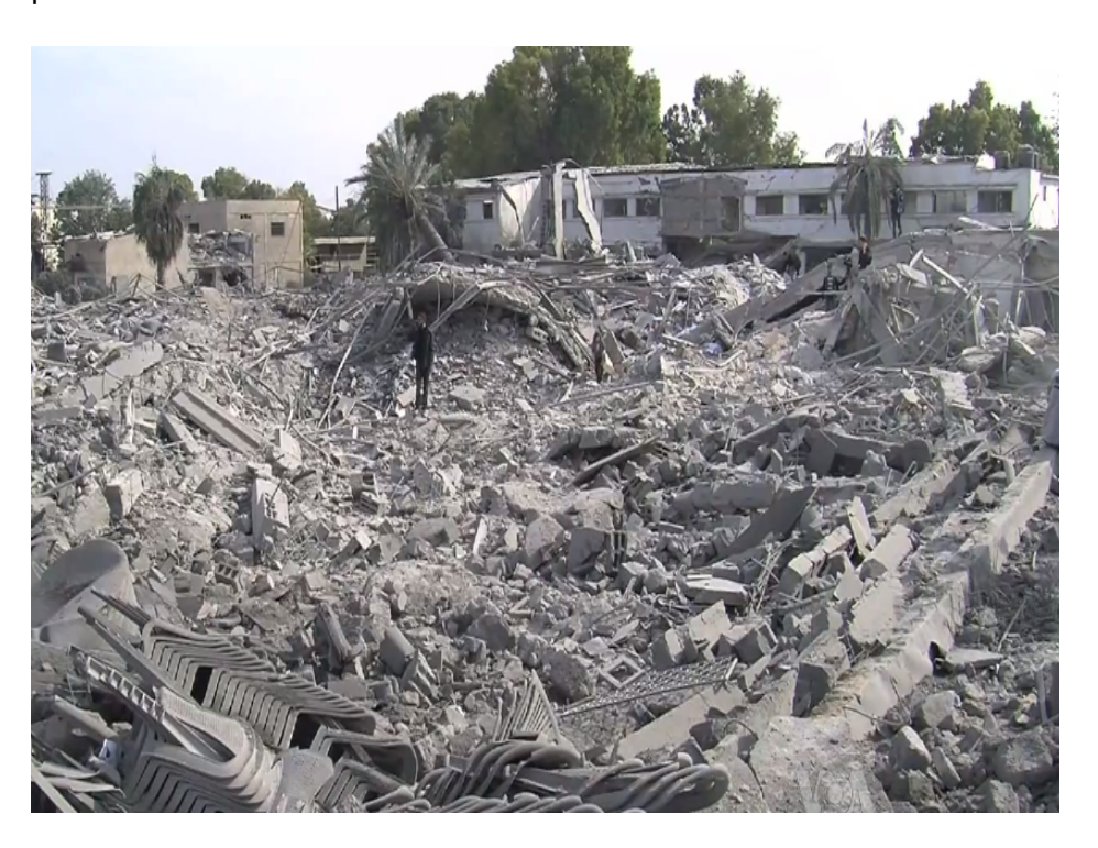
Image 1. Geography of obliteration: Destruction in Gaza after Israeli bombardment, part of Operation Pillar of Defence, 22 November 2012.

Cole 2014, p. 5). Atef Abu Saif (2014, p. 21) succinctly sums up what is at stake in this new form of drone-enabled occupation: 'Israel is offering the political dictionary with a new definition of occupation wherein the Occupying Power keeps the occupants hostage to its UAVs screening, control and extrajudicial execution without claiming a presence there'.