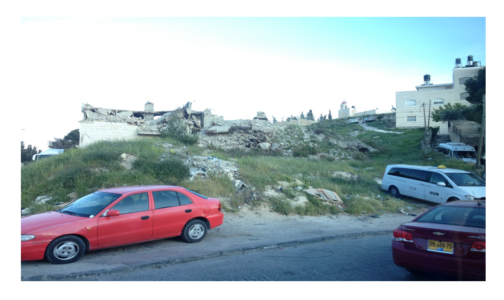
Image 3. Geography of the eliminated: corpus delicti of a Palestinian house in occupied East Jerusalem razed by the Israeli state.