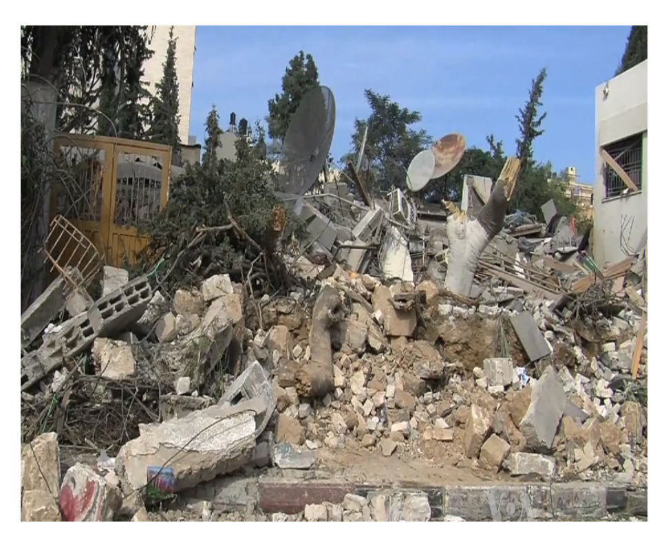
Image 4. Geography of the obliterated: forensic ecology of entanglement in Gaza after Israeli bombardment, part of Operation Pillar of Defense, 22 November 2012.

evidences the material dimensions of such a forensic ecology: blasted trees and their amputated limbs, broken doors and shattered windows, mangled domestic utensils and disabled satellite dishes, scattered bricks and twisted iron—all are entangled within an ecology that forensically testifies to the moment of catastrophic violence and its harrowing aftermath.