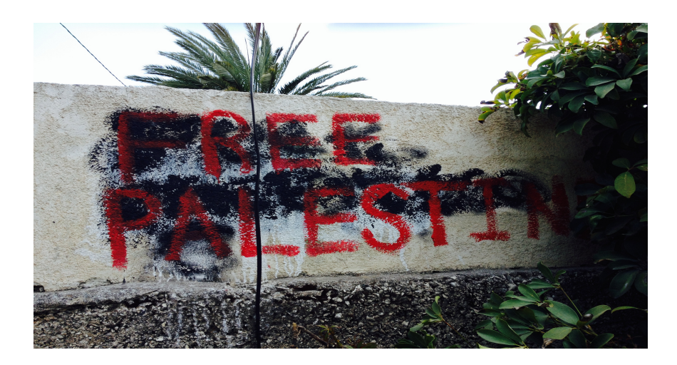
Image 7. Geography of the occupied: 'Free Palestine' grafitti on the wall of a Palestinian house now partially expropriated by Jewish settlers, occupied East Jerusalem.