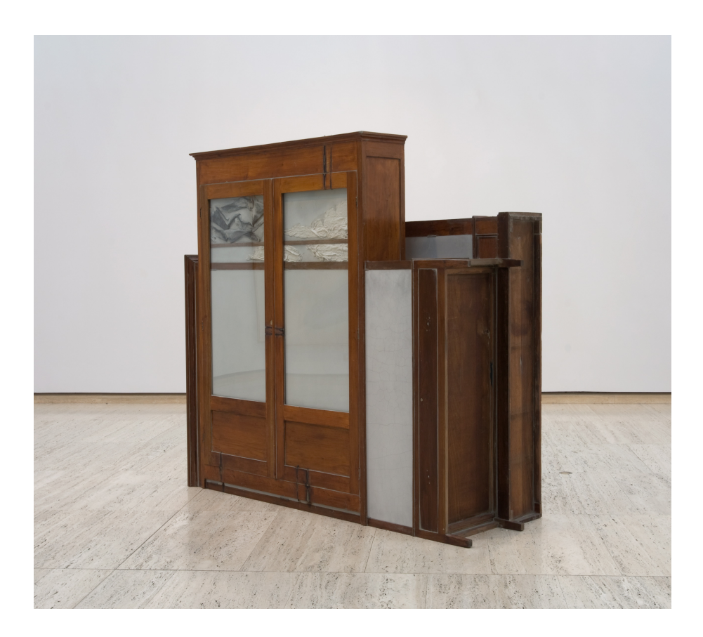
Image 5. Doris Salcedo (Colombia, b.1958), Untitled, 2007, wood, concrete, metal and fabric, 189 x 233 x 82.5 cm. Art Gallery of New South Wales. Purchased 2007. © Doris Salcedo. 364.2007

In her sculptures, Salcedo glues shut apertures such as wardrobe doors and drawers that had been handled and touched by the disappeared. She cements together discrete pieces of furniture and fabric that had supported and embraced their human charges and that, through this cementing process, become self-enclosed and preclusionary objects that deny the possibility for either comfort or embrace. Salcedo also encases in wall cavities, that are sealed over with translucent membranes, the random possessions, such as shoes, left behind by the disappeared (Image 6).