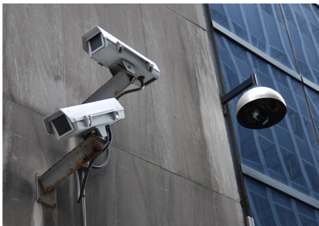
Our high-tech surveillance society had lower-tech precursors.

There are other forms of surveillance and sousveillance. Uberveillance is surveillance through bodily data, like a chip. Dataveillance is the use of surveillance through aggregate data algorithms. In the book, I also coined the term "redditveillance" [to talk about crowdsourced review of surveillance] using pub-