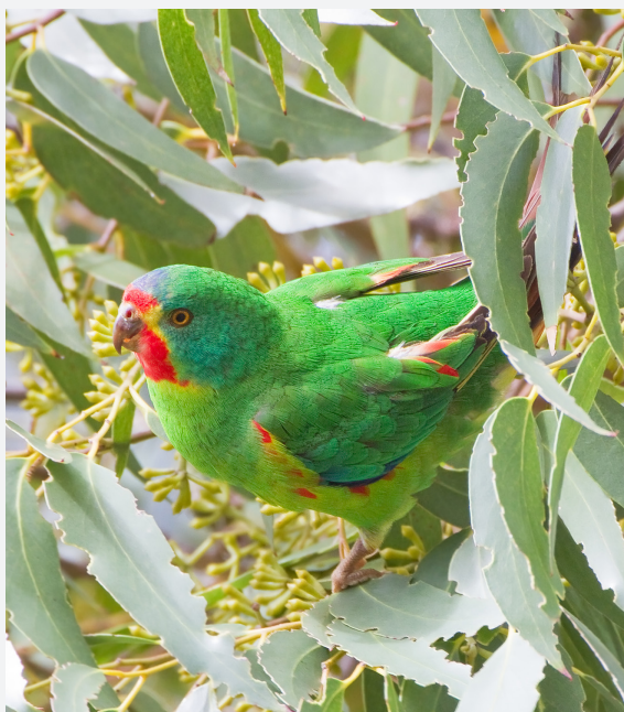
Swift Parrot ( Lathamus discolor )

Conservation Status: Critically Endangered