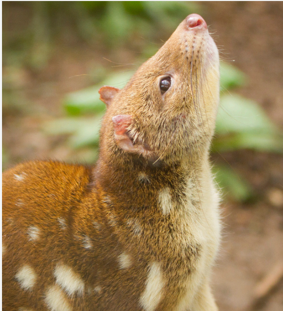
Spotted-tailed Quoll ( Dasyurus maculatus )