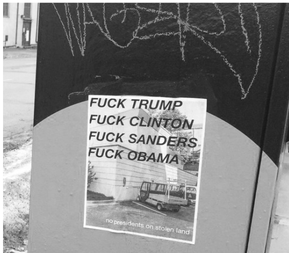
Posters along anti-Trump protest route January 2017

Put some more wheatpaste on the front of the flyer (especially the edges) to secure it to the surface. That's it!