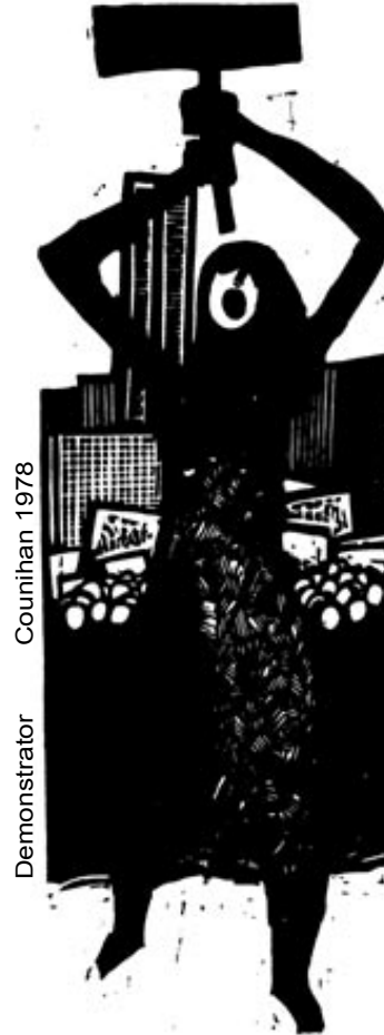
Demonstrator Counihan 1978

Now come on Wall Street don't be slow, why man this is war so go, go, go. There's plenty of big fortunes to be made, by supplying the Chinese with tools of the trade. Just hope and pray that if they start the bombing,