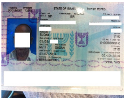
In the photo: A standard Israeli travel document, valid for three months, given to the asylum seekers in Ben Gurion Airport and taken away from them at the airports in Rwanda and Uganda by the local representative of Israel there.