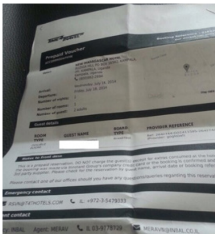
In the photo: A receipt for two nights and breakfasts in the "New Madagascar" Hotel in Kampala, given to asylum seekers who leave to Uganda.

After the first two days, the asylum seekers remain in those countries illegally. They are subject to arrest and deportation to their countries of origin, to which – Israel’s official position agrees – they may not be deported. Even if they are not arrested or deported, they lack any legal status or rights, making their lives very difficult in those countries. Therefore, even those who are not arrested or deported leave these countries and depart on a new journey, with the hope of finding protection elsewhere. Israel therefore creates a phenomenon known as “refugees in orbit”. 53 The State does not directly deport the asylum seekers to their