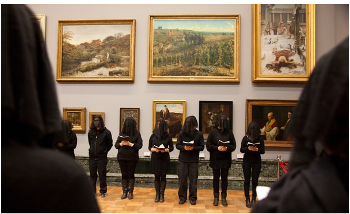
BP's sponsorship of the arts in the UK has been a focus for continuing protests and demonstrations. The protest here, at the Tate gallery in London in November 2013, was a performance aimed at BP's sponsorship of the gallery.

The briefing notes' response reiterates the museum's appreciation for BP's benevolence, saying that such exhibitions rely on external sponsorship and deepen "understanding of the world's many and varied cultures".