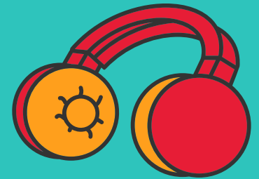
UWCC developed podcasts for home care cooperatives