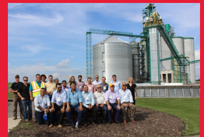
Brazilian cooperative leaders visit Landmark Services Cooperative grain terminal