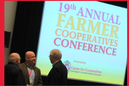
Networking at this year's Farmer Cooperatives Conference