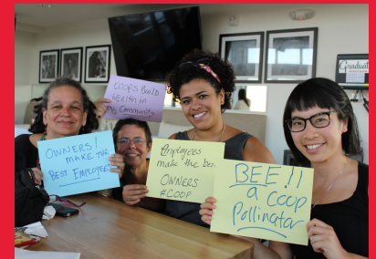
Art and Science of Cooperative Development participants