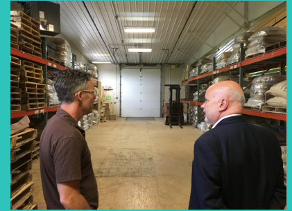
Rep. Mark Pocan tours Just Coffee Cooperative