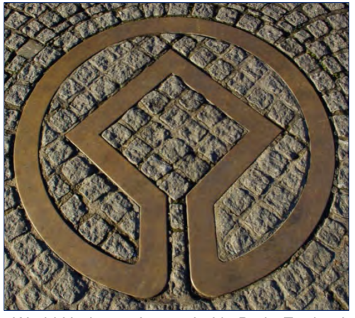
World Heritage site symbol in Bath, England.

However, the Convention does not leave the protection of world heritage to the international community alone. Instead, the Convention places the primary responsibility for protecting and conserving each World Heritage property on the state where that property is situated, <sup>59</sup> and requires each state to "do all it