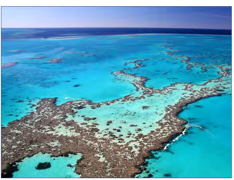
Aerial view of the Great Barrier Reef.

Under the World Heritage Convention, Australia has primary responsibility for protecting and conserving the Great Barrier Reef, and it must address both existing and potential threats to the Reef, whatever their source. The Convention requires Australia to "do all it can ... to the utmost of its own resources" to take "appropriate" action to protect and conserve the Reef. This obligation reflects the international legal principle of common but differentiated responsibilities, which is a way of determining a nation's "fair share" of responsibility for solving an environmental problem by taking into account differences in states' contribution to particular environmental problems, and their economic and technical capacity to address them.