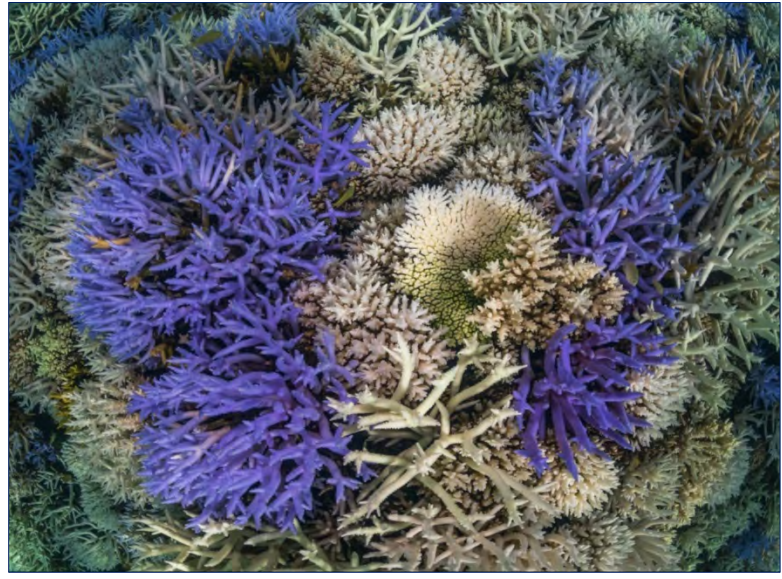
Fluorescing and bleaching corals in New Caledonia, March 2016.

The threat of climate change was made real in recent years when warming ocean temperatures caused by climate change triggered wide-scale coral bleaching around the world. From Papahānaumokuākea (United States of America) to the Phoenix Islands Protected Area (Kiribati), to the Aldabra Atoll (Seychelles), the Lagoons of New Caledonia (France), and the Great Barrier Reef (Australia), World Heritage-listed coral reefs have suffered bleaching – a process in which heat stress starves corals by destroying their symbiotic relationship with the microscopic algae that produce their food. Unfortunately, bleaching events are likely to become more frequent and devastating as seas continue to warm because of climate change.