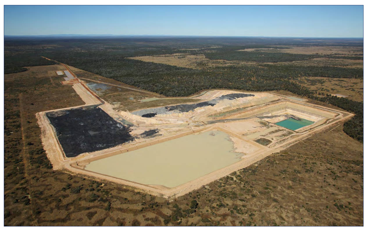
Alpha Coal Mine test pit, Queensland, Australia.

not threaten their integrity,"<sup>87</sup> which reflects a recognition that states are responsible for preventing harms from activities outside the boundaries of the properties. As the International Union for Conservation of Nature has stated, extractive projects outside World Heritage properties "should not, under any circumstances, have negative impacts" on the outstanding universal value of the properties. <sup>88</sup> To prevent negative impacts, such projects must be "subject to an appropriate and rigorous appraisal process" prior to the grant of licenses. <sup>89</sup> The appraisal should specifically assess the likely effects of the development proposal on the outstanding universal value of the property, including "direct, indirect and cumulative effects." <sup>90</sup> For example, in 2013, the Committee requested Australia ensure that the strategic assessment of the Great Barrier Reef World Heritage Area that Australia was preparing at the time "fully address direct, indirect and cumulative impacts" on the Reef. <sup>91</sup>