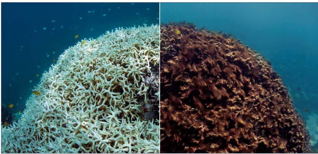
Coral bleaching, March 2016 (left), and dead coral, May 2016 (right), Lizard Island, Great Barrier Reef.

Because World Heritage-listed coral reefs are severely threatened by climate change, these principles must guide the assessment of national obligations to protect such reefs: each nation with a listed reef must do all it can, within its capacity and taking into account its contribution to climate change, to protect its reefs from the impacts of climate change. As the World Heritage Centre has recognized, the obligation of States to protect their own World Heritage properties is the "basis for States to ensure that they are doing all that they can to address the causes and impacts of climate change."