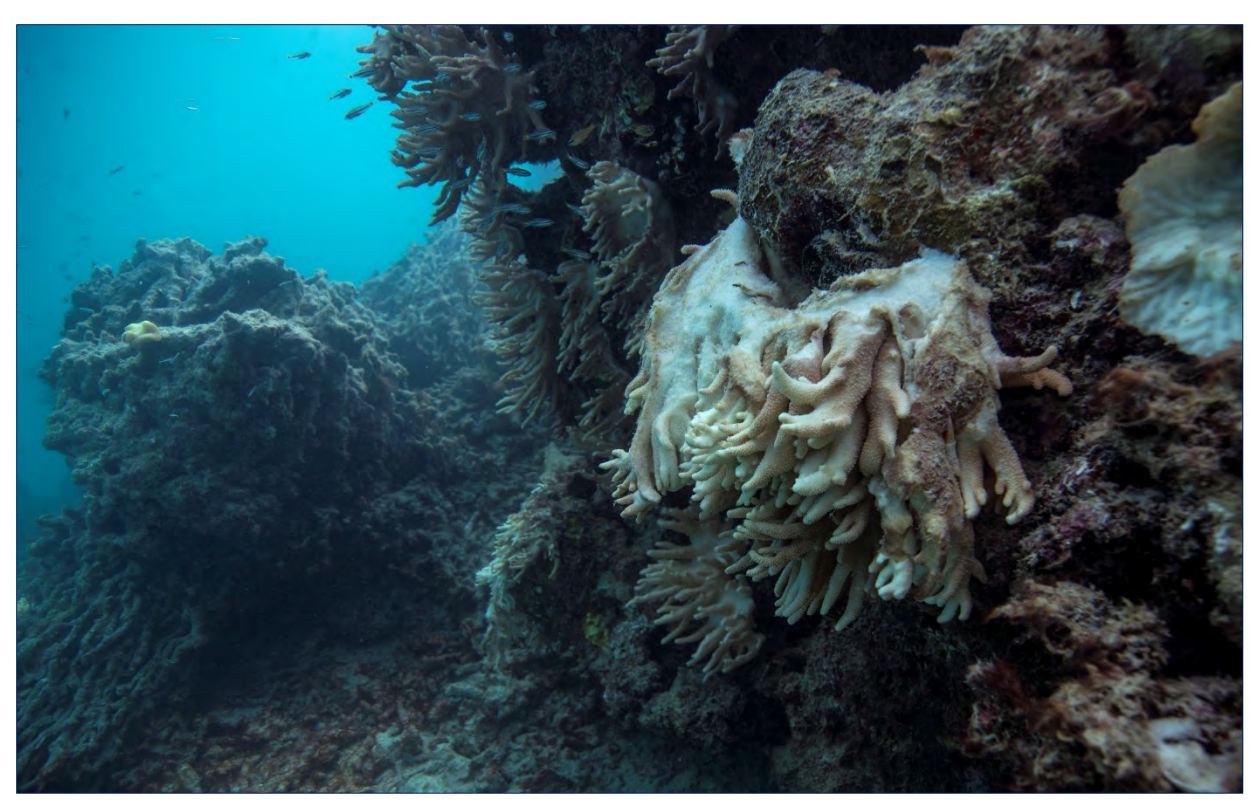
Decomposing soft coral falling off the reef, May 2016.

In the past few years, the effect of climate change on corals has been made frighteningly evident. Elevated ocean temperatures have triggered wide-scale coral bleaching events around the world, from the United States' Papahānaumokuākea Marine National Monument, to France's Lagoons of New Caledonia, the Seychelles' Aldabra Atoll, and Kiribati's Phoenix Islands Protected Area. On Australia's Great Barrier Reef, a staggering 22% of corals died in 2016 – the worst coral die-off in recorded history. In the northern third of the Reef, an area that had previously been relatively unaffected due to its distance from other human pressures, approximately two-thirds of the shallow-water coral died in just eight to nine months. On some reefs in the north, almost all the coral died.