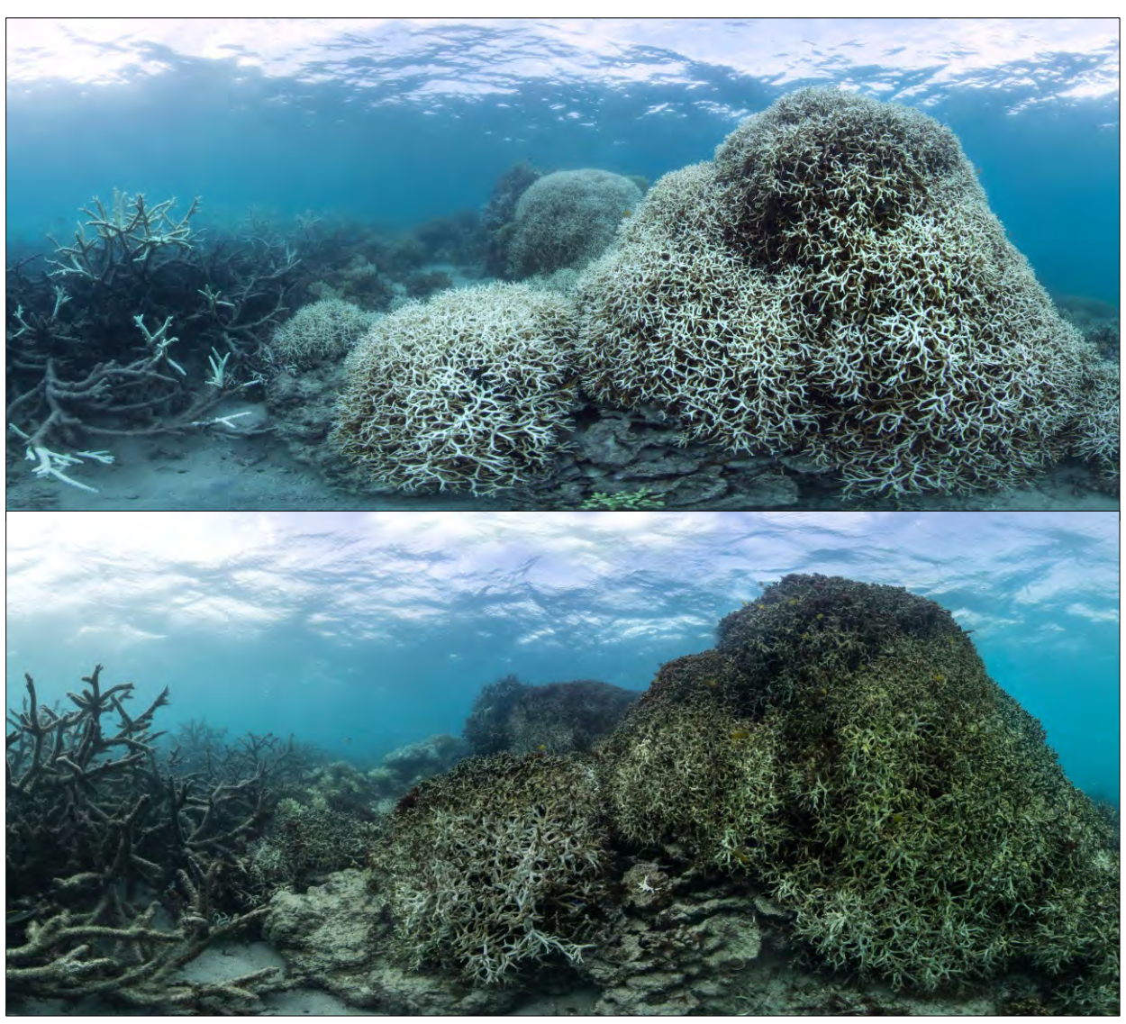
Coral bleaching, March 2016 (top), and dead coral, May 2016 (bottom), Lizard Island, Great Barrier Reef.

Despite this obligation and the critical vulnerability of the Reef to climate change, Australia is failing to meet its obligations to protect the Reef.