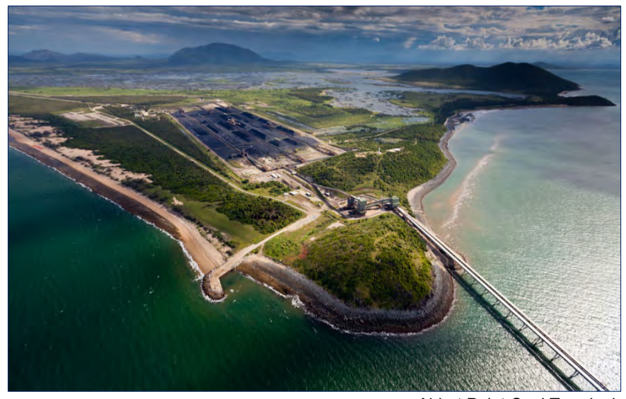
Abbot Point Coal Terminal.

First, in December 2015, the Australian government approved a dredging project to expand the coal export port at Abbot Point, which is within and adjacent to the World Heritage Area. This project, for which the Queensland government is the proponent, supports the development of a new terminal (which the Australian government approved separately in 2013). The expansion of Abbot Point Port is intended to facilitate the export of coal from the Galilee Basin, and, if developed as proposed, Abbot Point Port would be among the largest coal ports in the world: the export capacity would increase from 50 million tons of coal per year to between 85 and 120 million tons. The dredging project would require the offshore dredging of around 1.1. million cubic meters of previously undisturbed seabed within the World Heritage Area and the construction of onshore containment ponds for the dredge material and temporary pipeline infrastructure to pump this material to the ponds. The development of the new terminal would require the construction of onshore coal handling facilities, rail loops and outloading facilities, and a jetty and two ship berths.