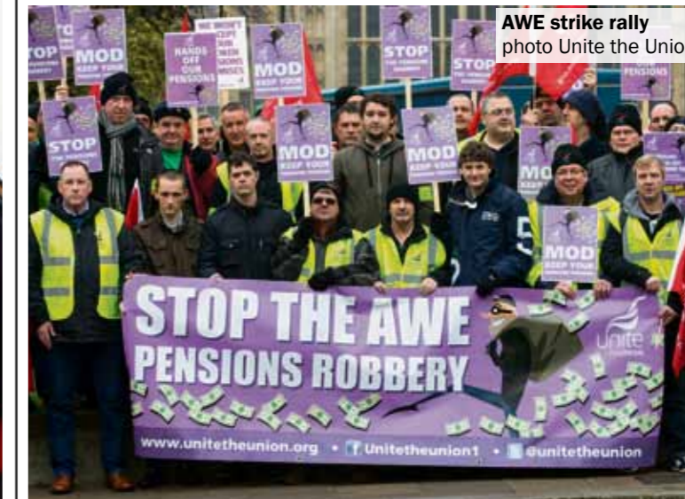
AWE strike rally photo Unite the Union