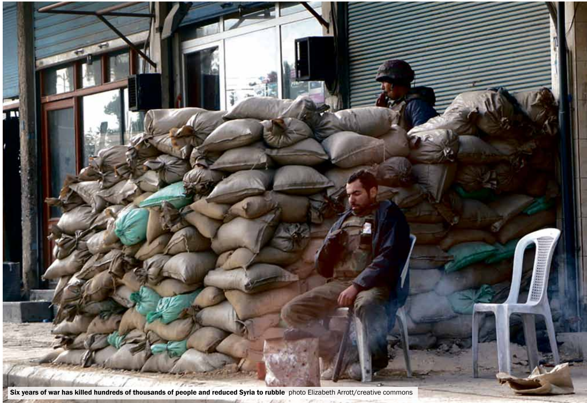
Six years of war has killed hundreds of thousands of people and reduced Syria to rubble