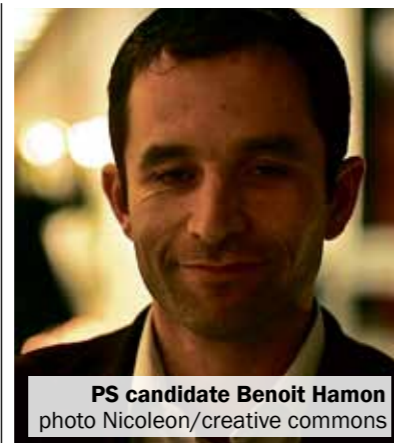
PS candidate Benoît Hamon

Far from moving towards better-funded welfare, successive governments are pushing more and more people into destitution, one of the latest measures being backdoor cuts during the change to Universal