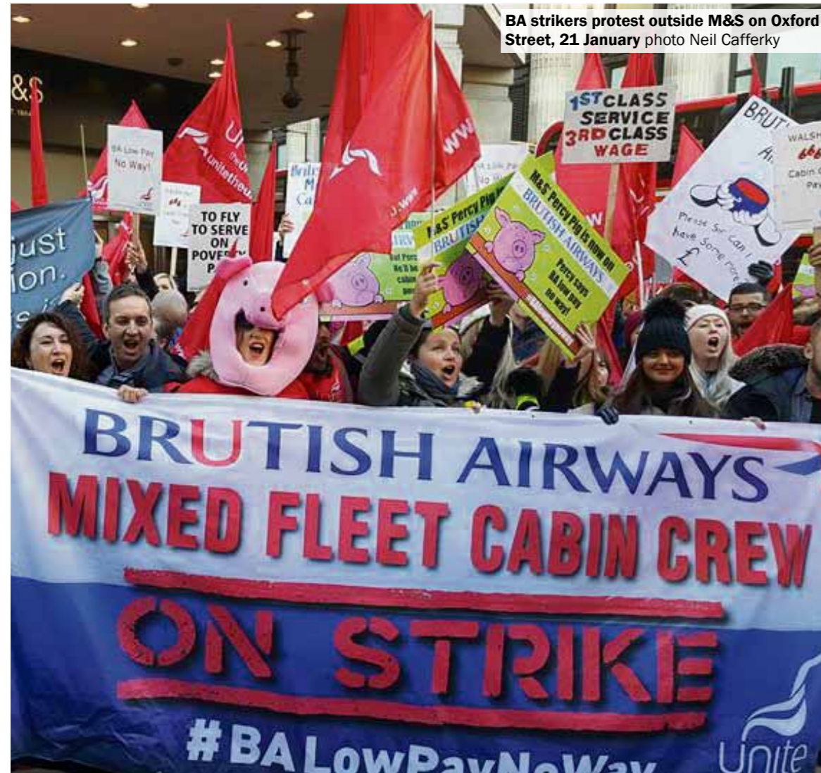
BA strikers protest outside M&S on Oxford Street, 21 January