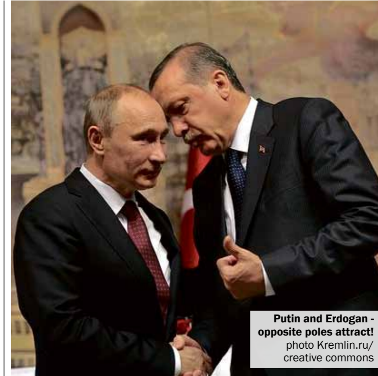
Putin and Erdogan - opposite poles attract!

The country is in ruins and has several hundred thousand internal refugees. This and the reconstruc-