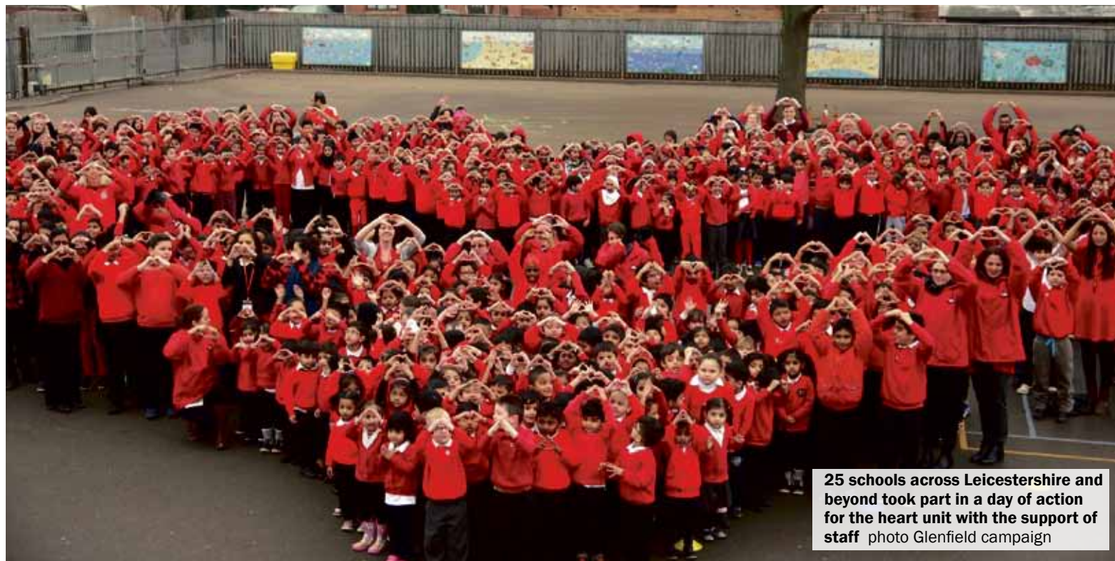
25 schools across Leicestershire and beyond took part in a day of action for the heart unit with the support of staff

But NHSE's proposals do not add up! It says Glenfield doesn't carry out enough operations, yet the hospital is on track to reach its target number. They say it's about achieving 'standards', but Glenfield has been praised as having "excellent outcomes". It is the leading UK centre for certain treatments.