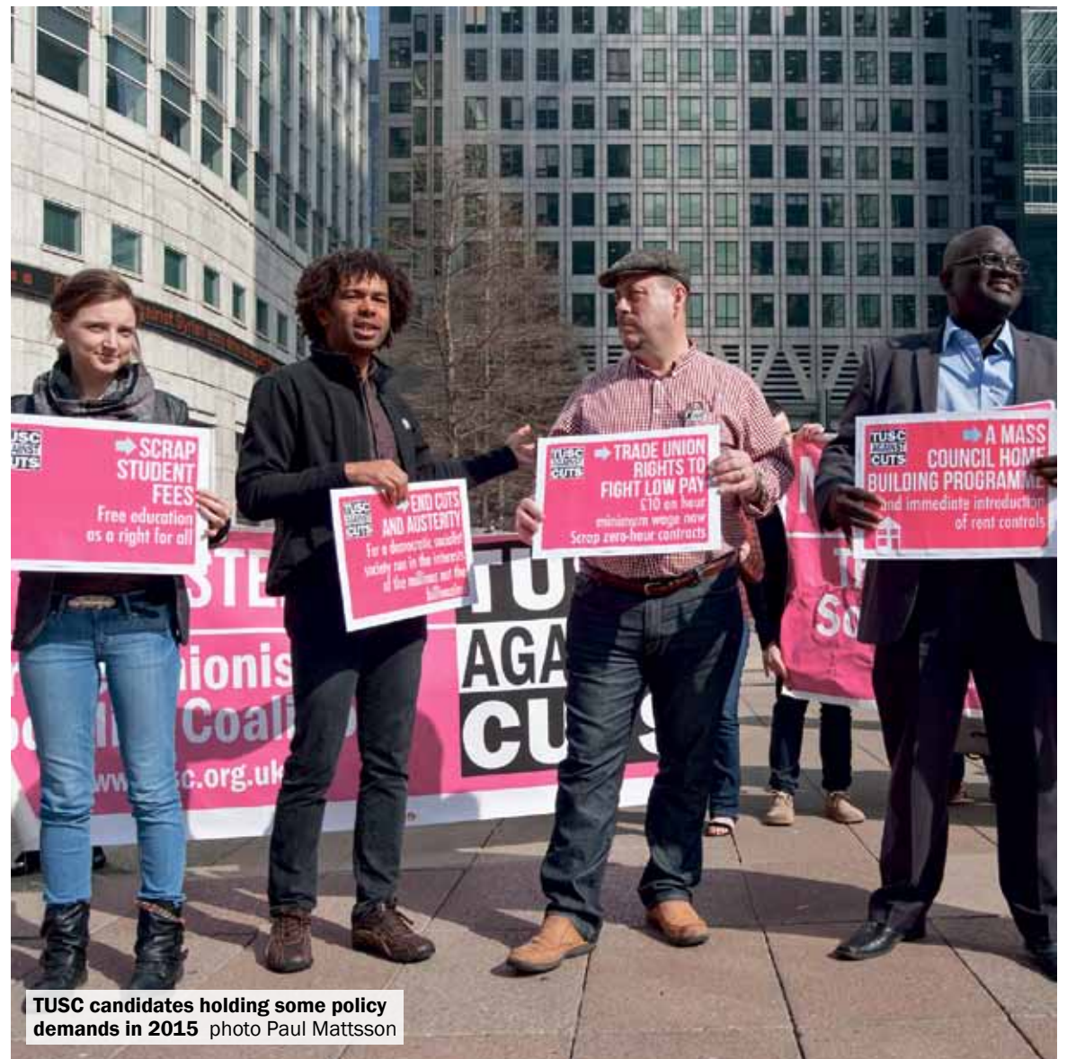
TUSC candidates holding some policy demands in 2015

TUSC and unions call for legal no-cuts budgets