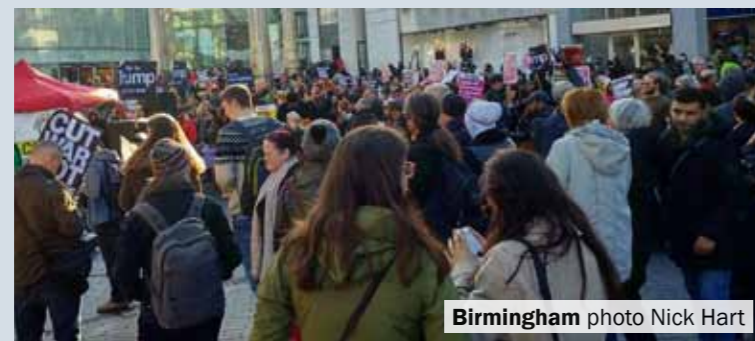
Birmingham photo Nick Hart

On the third Leeds anti-Trump protest in two weeks, 1,000 people gathered in Victoria Gardens to listen to speakers before marching through the city centre, growing in number as we went.