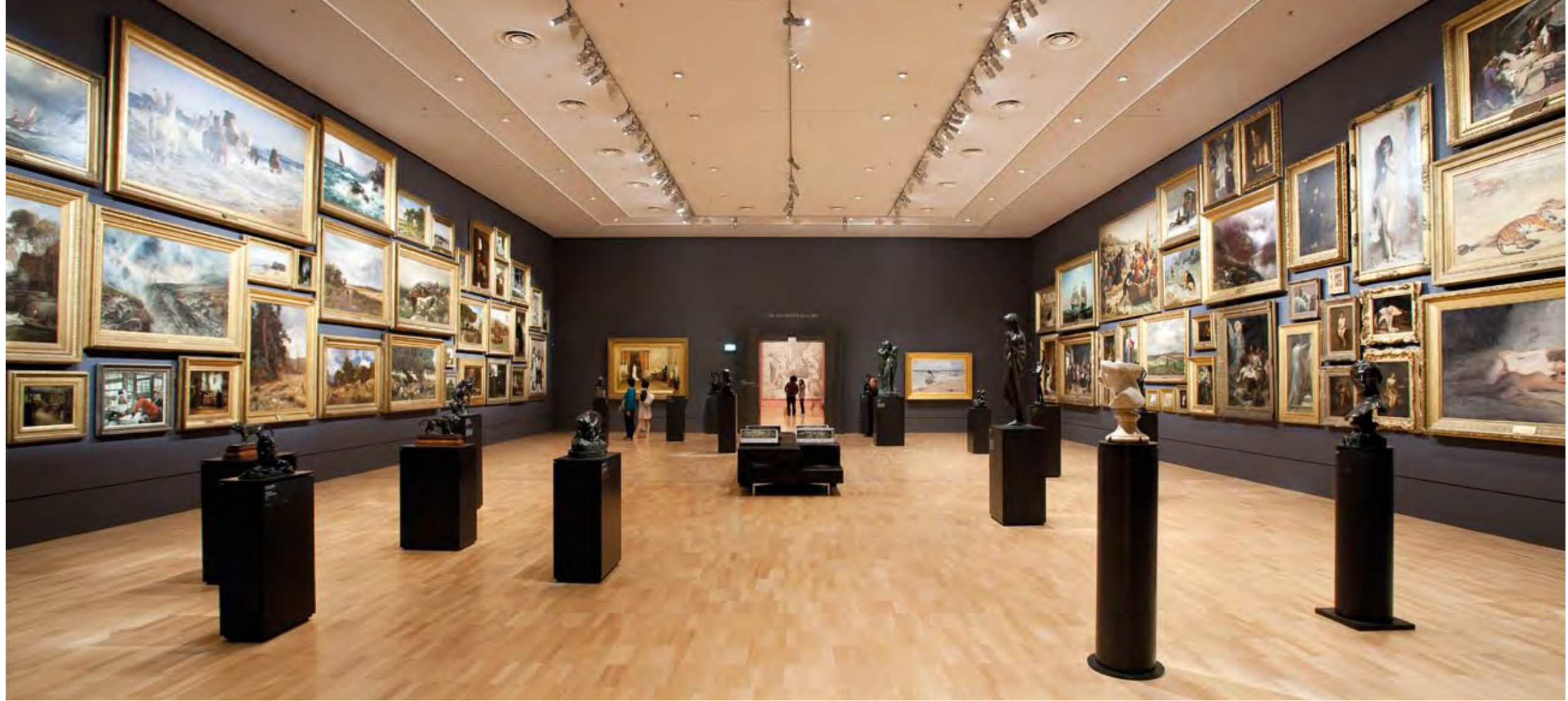
(clockwise from top) Salon Room, NGVI; NGV Studio: Everfresh exhibition, NGVA; Art of the Pacific gallery; Regency Room, NGVI