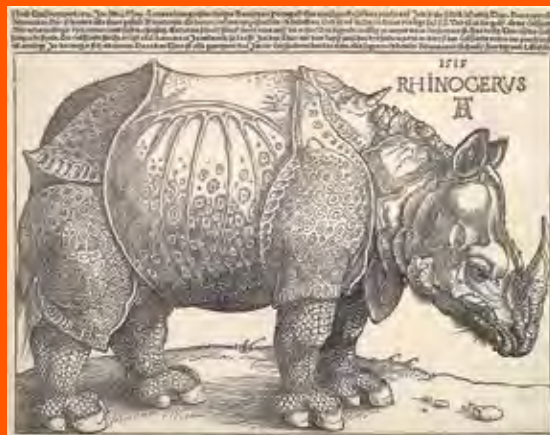
Albrecht Dürer German 1471–1528 The rhinoceros 1515 woodcut 21.2 x 30.0 cm (image) 23.8 x 30.6 cm (sheet) National Gallery of Victoria, Melbourne Felton Bequest, 1956

2011: THE NATIONAL GALLERY OF VICTORIA'S 150TH ANNIVERSARY