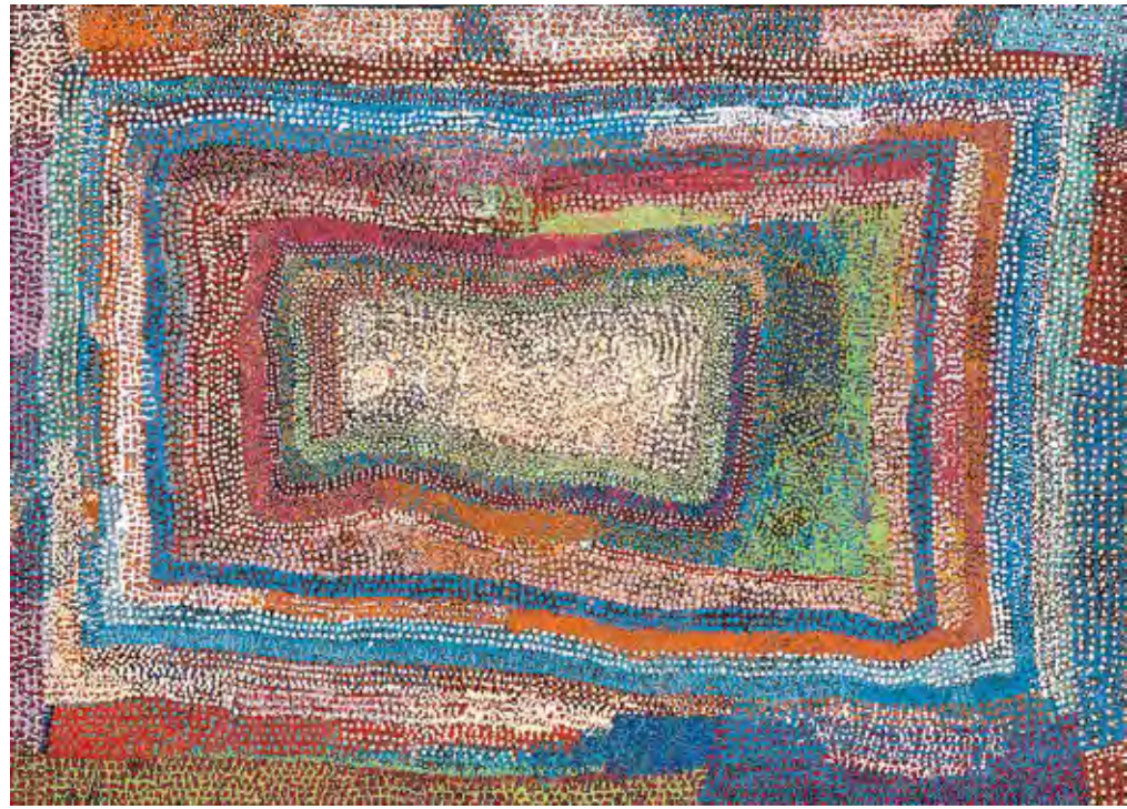
Tommy Mitchell Ngaanyatjarra born c.1943 Kurtilypurru 2009 synthetic polymer paint on canvas 152.0 x 212.0 cm Felton Bequest, 2011 © Tommy Mitchell, courtesy Warakurna Artists Aboriginal Corporation