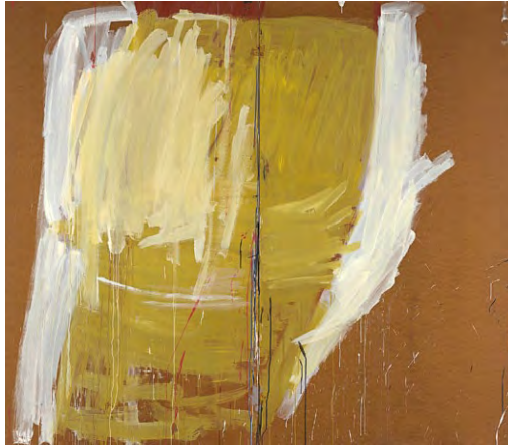
Tony Tuckson English 1921–1973, worked in Australia 1950–73 Untitled – Yellow 1970–73 synthetic polymer and enamel paint on composition board (a-b) 213.5 x 244.0 cm (overall) National Gallery of Victoria, Melbourne Purchased with funds donated by Loti Smorgon AO and Victor Smorgon AC, 2011