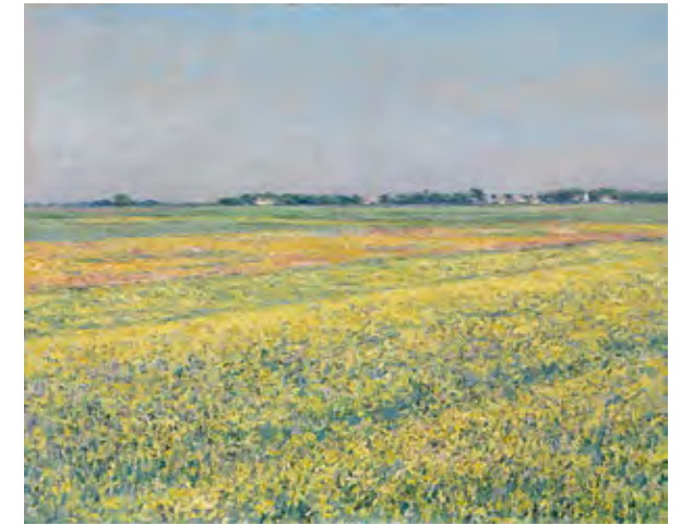
Gustave Caillebotte France 1848–94 The plain of Gennevilliers, yellow fields (La plaine de Gennevilliers, champs jaunes) 1884 oil on canvas 65.5 x 81.5 cm National Gallery of Victoria, Melbourne Felton Bequest, 2011