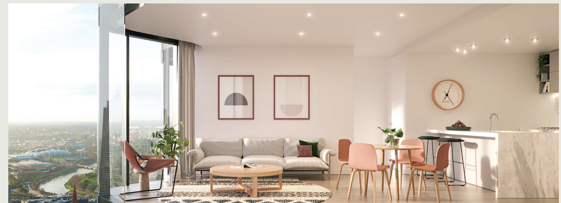
Artist's impression — Sectional view of kitchen living area, light scheme