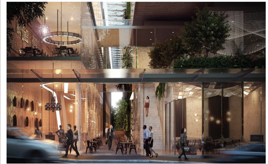
Artist's impression Elevated view of 380 Melbourne (top) Lonsdale Street Facade (bottom)

With its many sublime spaces for exercise, recreation and relaxation, 380 Melbourne lets you live life to the full, without leaving the building.