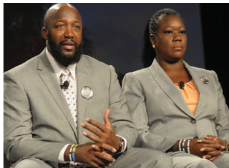
Tracy Martin and Sybrina Fulton, parents of slain teen Trayvon Martin.