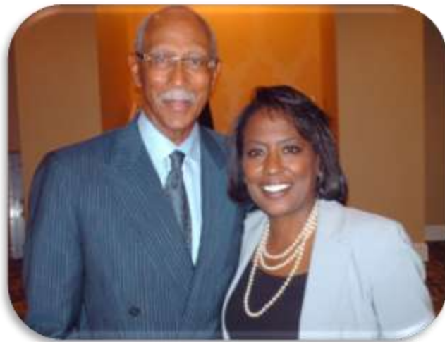
Detroit Chapter of NABJ

A website can be the face, the welcome card for a chapter. In a perfect world, a member would be available to help set up a website. If not, TheSiteWizard.com offers a great tutorial for setting up a home page from scratch. But if that's too much, buy a domain name at places including GoDaddy.com , Register.com and NetworkSolutions.com , then consider providers that offer free and paid website creation. Some of the free ones include Weeby.com , Wix.com and Google Websites , and have easy drop-and-drag instructions.