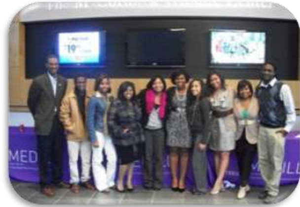
NABJ at Marquette University