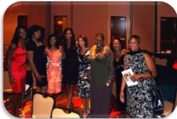
Colorado Association of Black Journalists

For more information, check with successful professional and student chapters of NABJ. Also, consult with NABJ's parliamentarian for guidance in writing your governing documents.