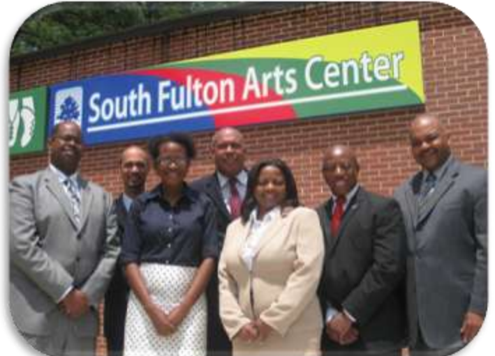
Atlanta Association of Black Journalists

4 Help members make informed choices. If you have a chapter newsletter, you can publish mini-profiles on each candidate before the elections. If the nominee wants to personally send out information with their political platform, you could make the chapter mailing list available to the candidate. In some places, chapters give the candidates a dedicated amount