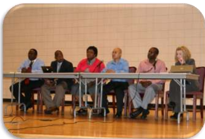
Triangle Association of Black Journalists

Once a chapter begins collecting dues that money should go into a checking account in the chapter's name. Banking laws differ from state-to-state, but basically the organization's name, address, and two signatures are required to open an account.