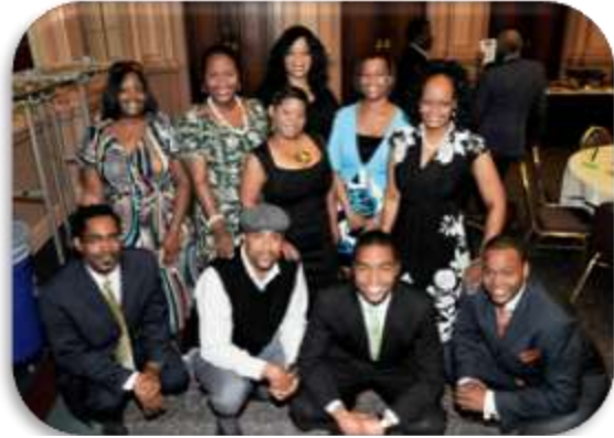
Pittsburgh Black Media Federation

The Philadelphia Association of Black Journalists Operating Procedures clearly outline all officer duties. PABJ is NABJ's founding chapter and the NABJ organizational bylaws were adapted from PABJ's bylaws. You will do your chapter a great service by adding both operating procedures and financial procedures to your organizational bylaws because further outlining how to manage the association will help your current members and future leaders sustain your chapter. To view PABJ's operating procedures and financial procedures, visit www.pabj.org .