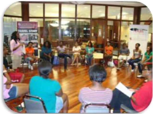
University of Oklahoma NABJ Chapter