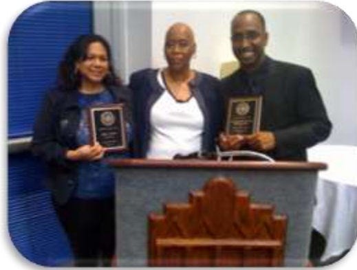
San Antonio Association of Black Journalists

Now... to confuse things. Not all chapters have two separate documents. Some successful chapters have followed what has become common practice and just have a single governing document. This accepted practice is noted in "Robert's Rules of Order." This single document can be called the "bylaws" or the "constitution and bylaws." According to "Robert's Rules," "the term bylaws, as used in this book, refers to this single, combination type instrument -- by whatever name the particular organization may describe it."