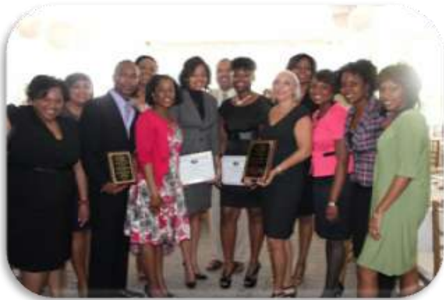
Atlanta Association of Black Journalists

NABJ chapters should be creative in finding ways to get people involved and keep them engaged. Chapters should keep in mind members' investments on three fronts: