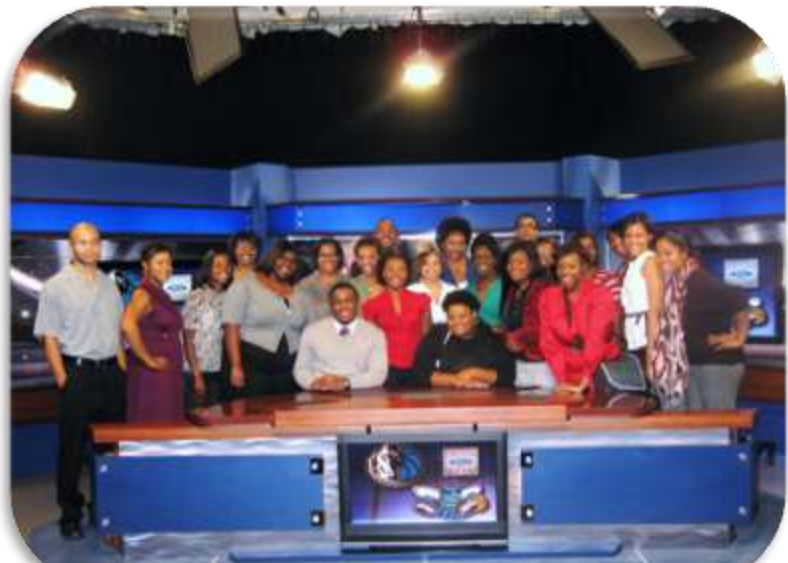
University of North Texas Association of Black Journalists Chapter

Please see Chapter 15 for more useful information pertaining to student chapters.