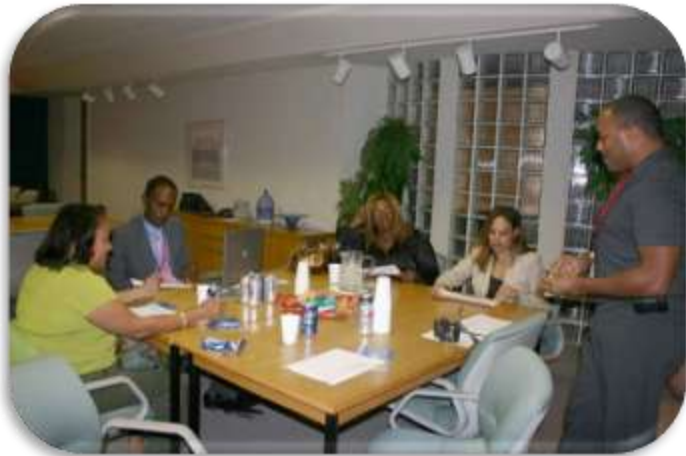
South Florida Black Journalists Association