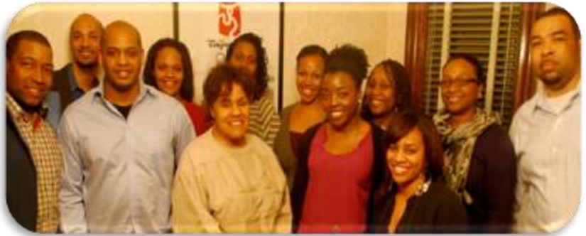
Boston Association of Black Journalists

Your chapter constitution ensures that all of the rules and regulations are proposed and debated openly and lays down detailed procedures for the conduct of debates, discussion, meetings and the like. It is your building block for accountability, representation and explanations for the division of power.