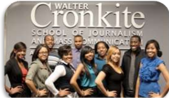
NABJ – Arizona State University

Congratulations! Your city has been chosen to host a convention of the National Association of Black Journalists. It may be one of the greatest experiences of your career and it may be one of the worst.