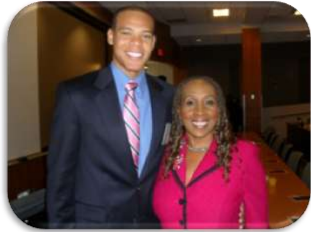
West Virginia University Association of Black Journalists

Producing meaningful programming is paramount to your chapter's success. Being engaged in the community is a tenet of all NABJ chapters. You may want