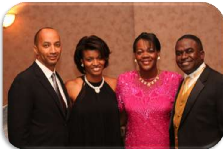
Triangle Association of Black Journalists

Fundraising can be the Achilles heel for many ambitious chapters. Organizations without a comprehensive, well-organized plan for raising money will often find their activities curtailed and achievements limited, as the lack of resources puts serious boundaries on the projects they can tackle.