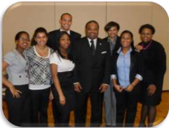
West Virginia University Association of Black Journalists

Nothing can make a smart plan look haphazard faster than unreliable officers who cannot or will not carry their weight.