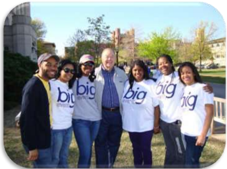
University of Oklahoma NABJ Chapter

The president or adviser of the student group should contact the NABJ student representative, as well as the respective regional director for consultation, guidance and advice. Local dues may be collected. If a checking or savings account is opened in the name of the chapter, the signatures of the chapter president or treasurer and adviser are required. All candidates who run for president and vice president(s) must be paid members of NABJ..