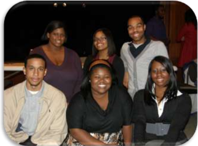
Oklahoma University Chapter of NABJ