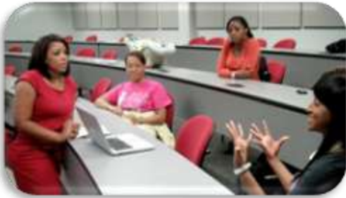
University of Mississippi Association of Black Journalists

NABJ regional conferences generally draw an estimated 100-300 attendees, depending on the region, location of the conference, timing and other factors. Most cities have facilities that can accommodate those numbers either at a full-service hotel, conference or convention center, or combination of both.