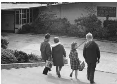
Cedar Park, ca. 1965 SPSA 210-6

After this closure, the district leased Cedar Park as an arts studio. Cedar Park Arts Center comprised a number of live-in arts studios, but their status was not made clear until 1994 when an agreement was reached with the district for a limit of nine at a time. Presently seven day-studios operate in the building, utilizing not only former classrooms, but also the auditorium, kitchen, teachers' conference room, and breezeway play area.