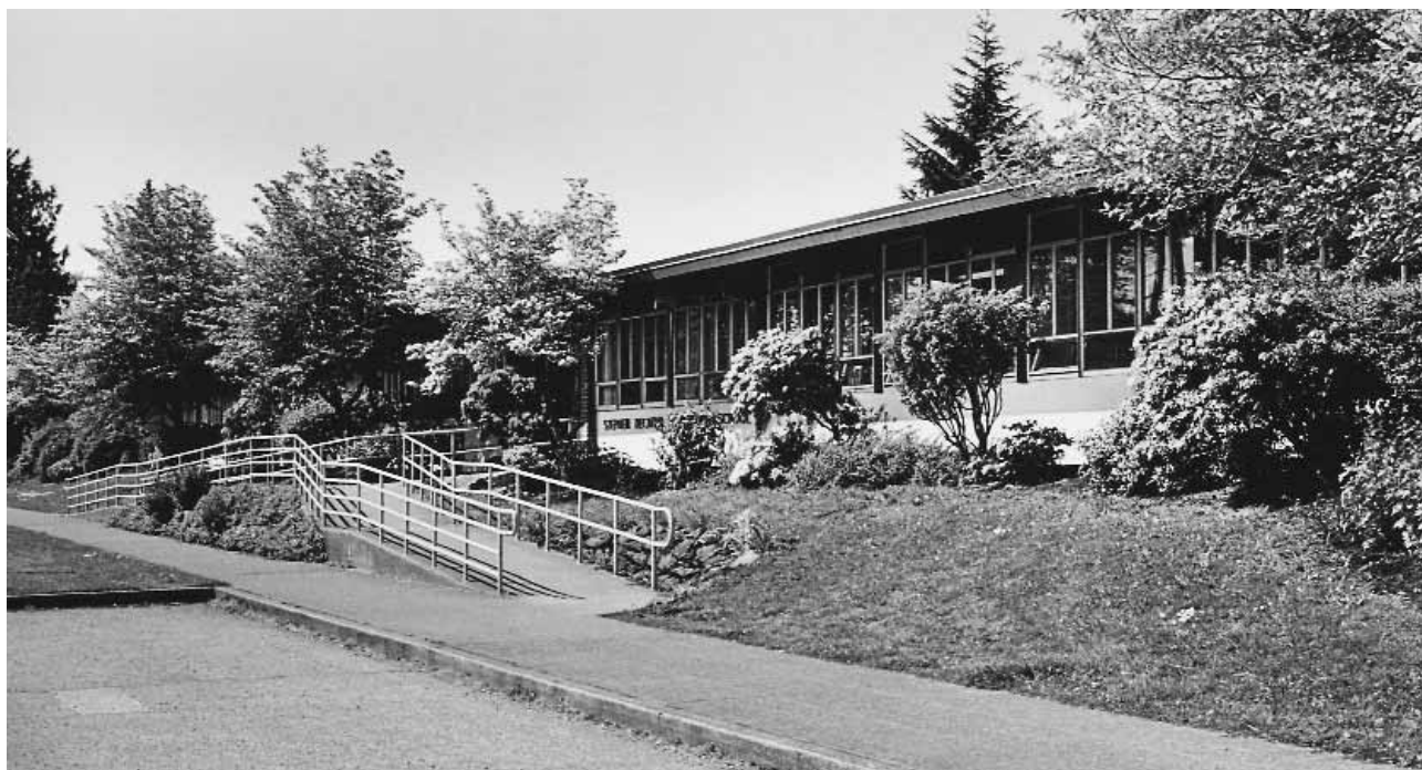
Decatur, 2000 SPSA 287-28

In the late 1950s, the Seattle School Board sought a solution to overcrowding at View Ridge and Wedgwood. They acquired the playground area of the Shearwater Housing Project from the federal government, who had declared the area surplus. Shearwater was built in the Wedgwood neighborhood as a housing unit primarily for United States Navy personnel stationed at the Sandpoint Naval Air Station and their families.