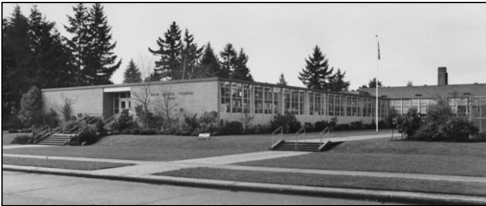
Seattle Public Schools