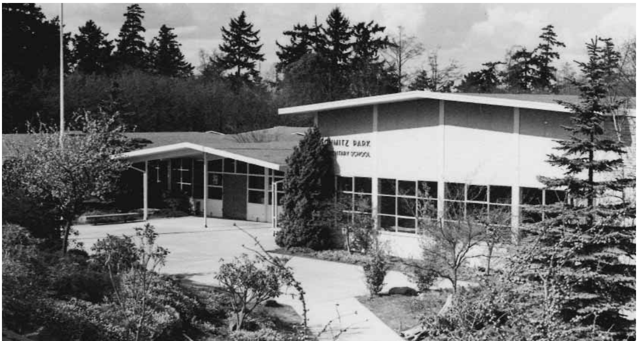
Schmitz Park, ca. 1970 SPSA 270-23

Under the district's desegregation plan, Schmitz Park served as a