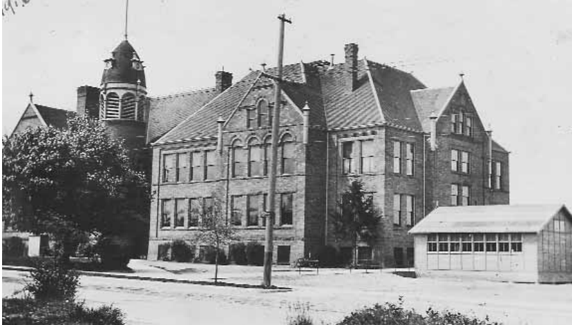
West Seattle, 1916 SPSA 239-12

1893: Opened in September by West Seattle District 1908: Annexed into Seattle School District on July 1 1909: Addition (James Stephen) 1917: Renamed West Seattle Elementary School 1918: Renamed Lafayette School on November 7 1941: Addition (Naramore & Brady) 1946: Site expanded to 4.6 acres 1949: Closed by earthquake on April 13; 1893 and 1909 portions demolished in August 1950: 20-room brick addition (John Graham & Co.) opened in September 1953: addition (Graham)