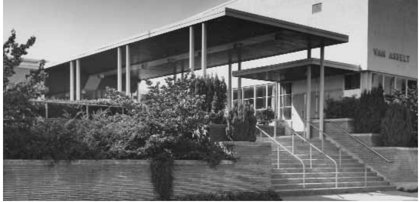
Van Asselt, 1960