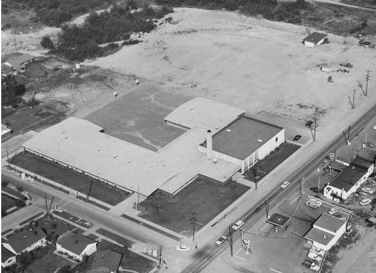
Roxhill, 1960 SPSA 267-1

Name: Roxhill Elementary School Location: 9430 30th Avenue SW Building: 18-room brick Architect: John Graham & Co. Site: 3.01 acres