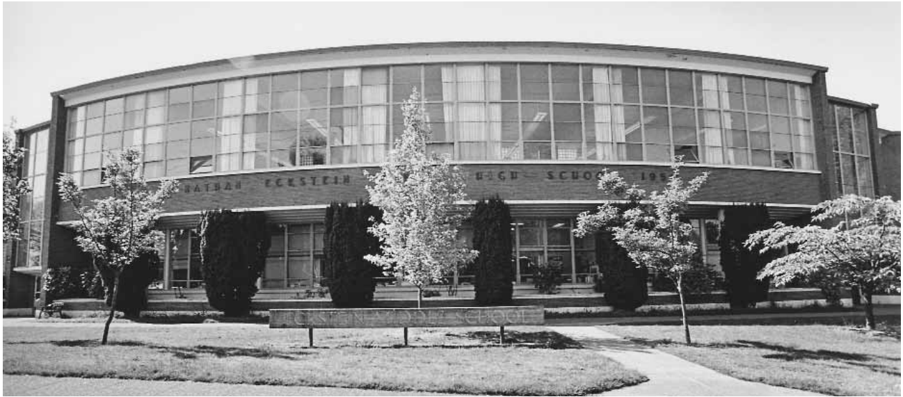
Eckstein, 2000 SPSA 104-6

Until the late 1930s, the northeastern area, which developed into the neighborhoods of View Ridge, Wedgwood, and Hawthorne Hills, was characterized by scattered farms and forested land. When the city's population began spreading to the suburbs, this area became a prime location for new homes, parks, and schools. With an eye to the future, the Seattle School Board in 1927 purchased five acres of property at NE 75th Street and 32nd Avenue NE from homesteader John Bloomquist. As late as 1944, the property was leased as horse pasture.