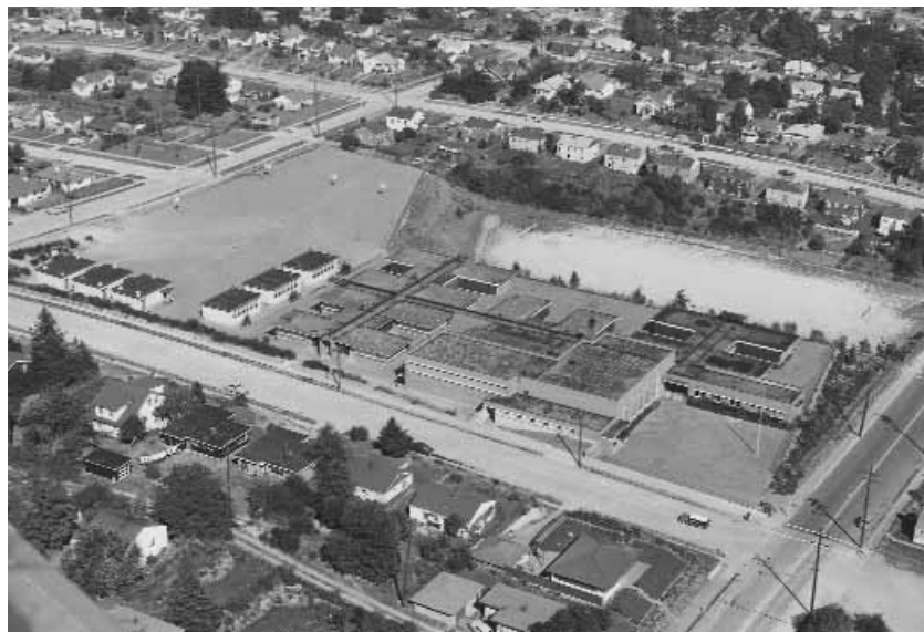
Genesee Hill, 1960 SPSA 227-2