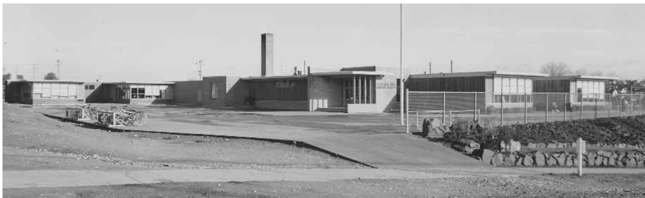
Genesee Hill, ca. 1949 SPSA 227-4

A second addition in 1953-54 included administrative offices, a teachers room, a lunchroom-auditorium and kitchen, and gymnasium.