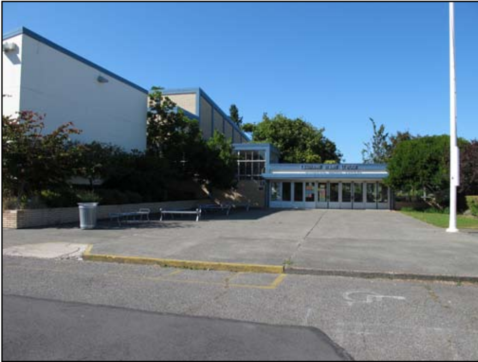
The Johnson Partnership, August 2012