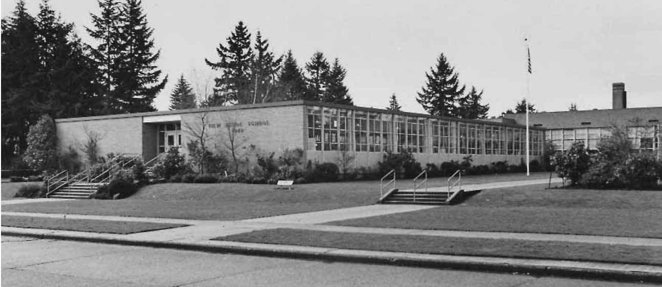
View Ridge, ca. 1970 SPSA 277-5

Children from View Ridge were bused to Bryant School. However, when Bryant became overcrowded, the search was on for a school site in View Ridge. A plot of state-owned land, part of which was being used as a ballfield, was selected.