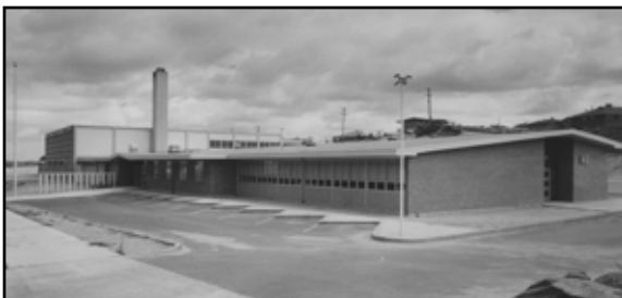
Seattle Public Schools