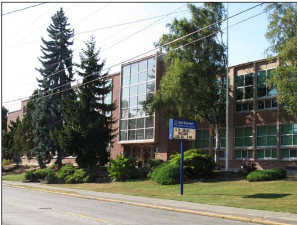
The Johnson Partnership, August 2012