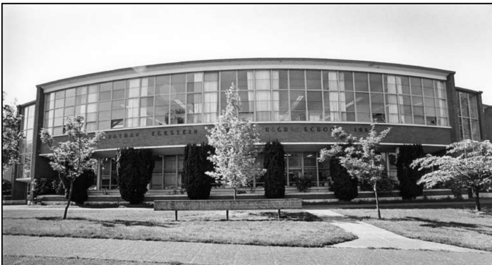
Seattle Public Schools