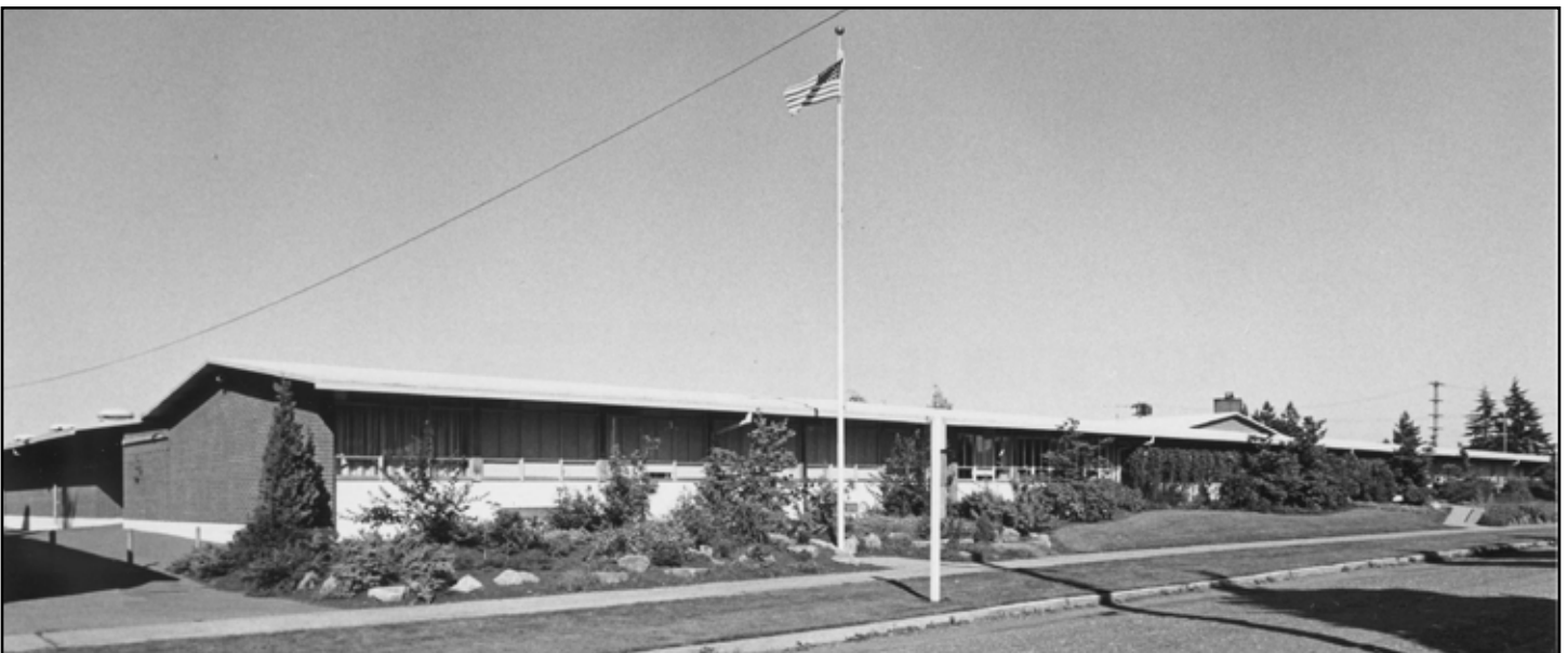
Seattle Public Schools