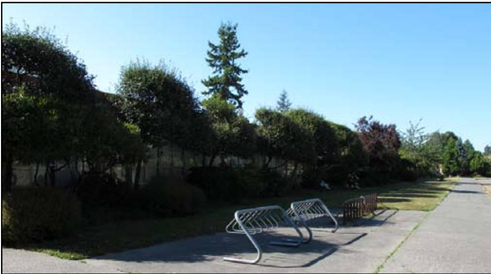
The Johnson Partnership, August 2012