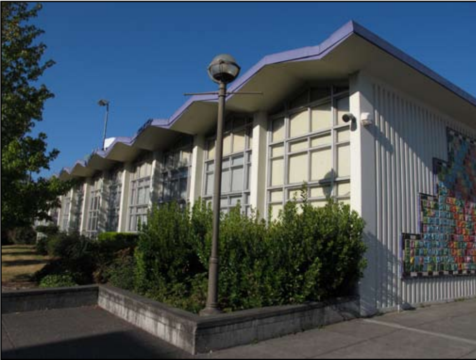
The Johnson Partnership, August 2012