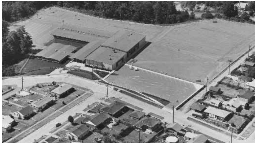
Schmitz Park, 1965

Throughout the school's history, the adjacent park has provided an outdoor classroom for nature studies, science, and conservation. The school's mascot, The Red Fox, was inspired by a real fox family that visits the playground each fall and spring and inhabits the nearby woods.