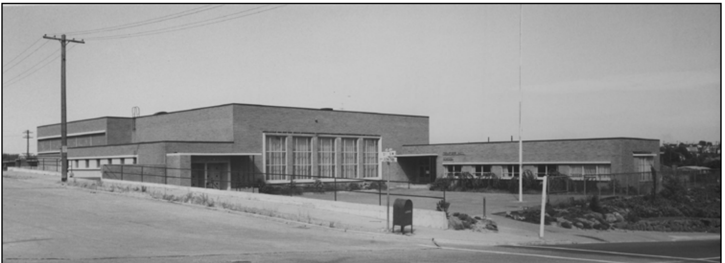
Seattle Public Schools