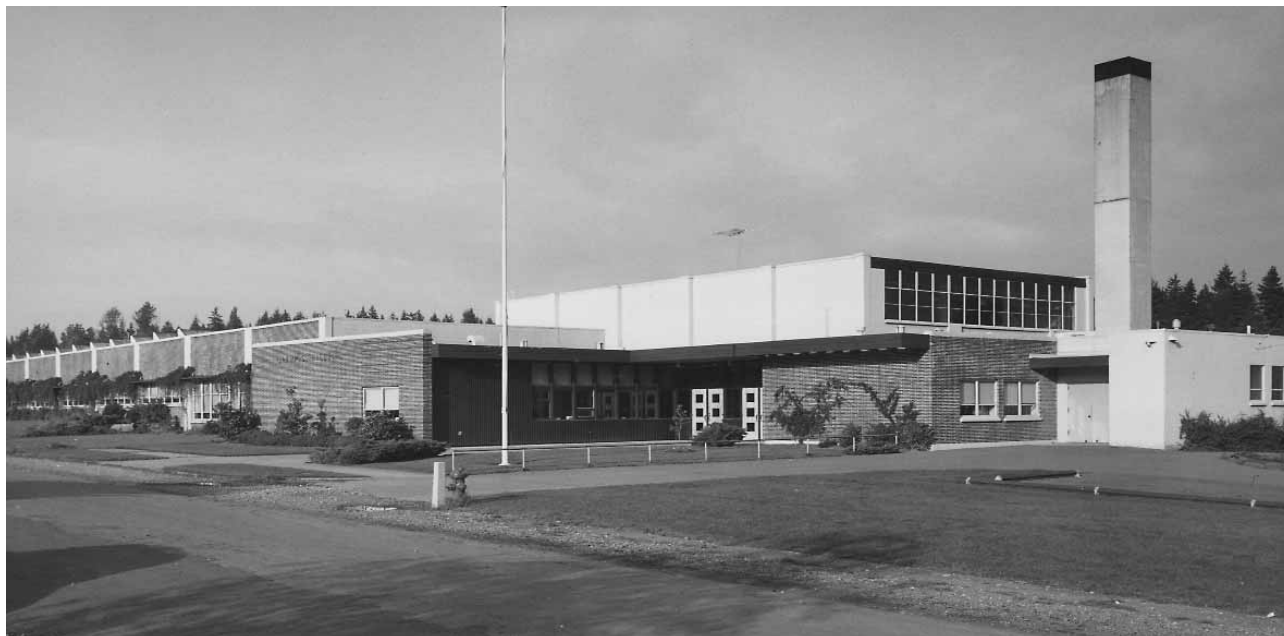
Olympic Hills, 1960 SPSA 261-3

Olympic Hills School is the third Seattle Public School with “Olympic” in its name (see Olympic and Olympic View). It was planned, named, and its construction started by the Shoreline School District, but before it opened in 1954, the area was annexed into the City of Seattle. The school opened in the Seattle School District with 585 pupils.