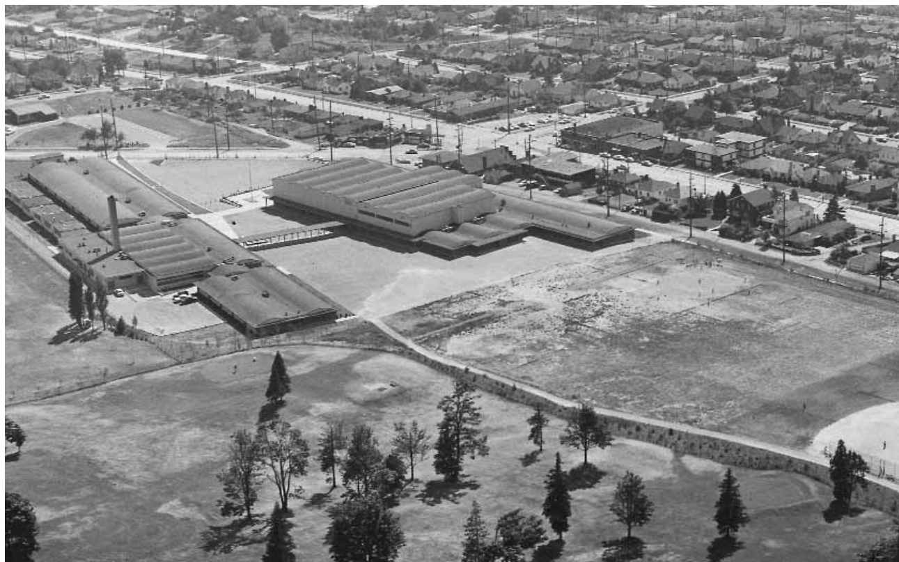
Asa Mercer, 1960 SPSA 110-3

The school was built with an 800-seat auditorium. When Mercer opened in fall 1957, its 1,093 students came from several south end