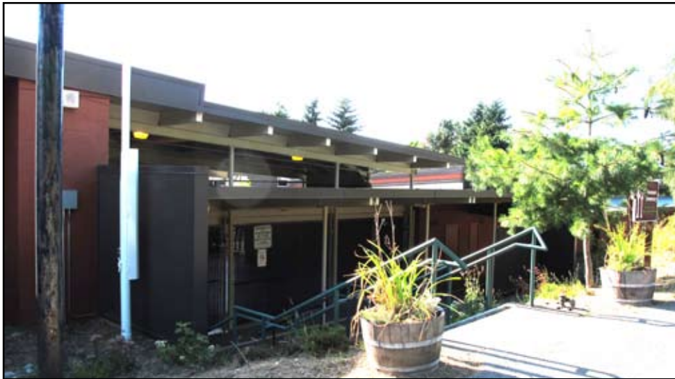
The Johnson Partnership, August 2012