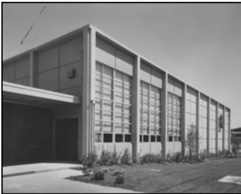
Seattle Public Schools