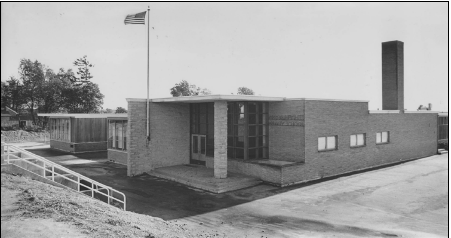
Seattle Public Schools 1949

Stoddard also designed Briarcliff Elementary (1949, demolished), Genessee Hill Elementary (1949), and Sandpoint Elementary with F. Huggard (1958).