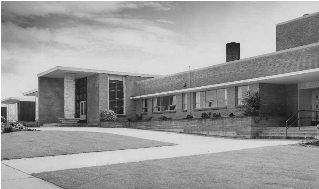
Briarcliff, 1960 SPSA 206-4

The number of pupils at Briarcliff gradually decreased to about 500 in 1963–64 and leveled off at about 320 pupils in 1972–73. As part of the district’s desegregation plan, in September 1978 Briarcliff received students in grades 1–4 bused across town from the recently closed Hawthorne. Although only one staff member (Carol Postell, who taught 1st grade) made the move from Hawthorne to Briarcliff, the operation at Briarcliff School, including the PTA, was renamed Briarcliff-Hawthorne. Over the years, it emphasized the arts. The school