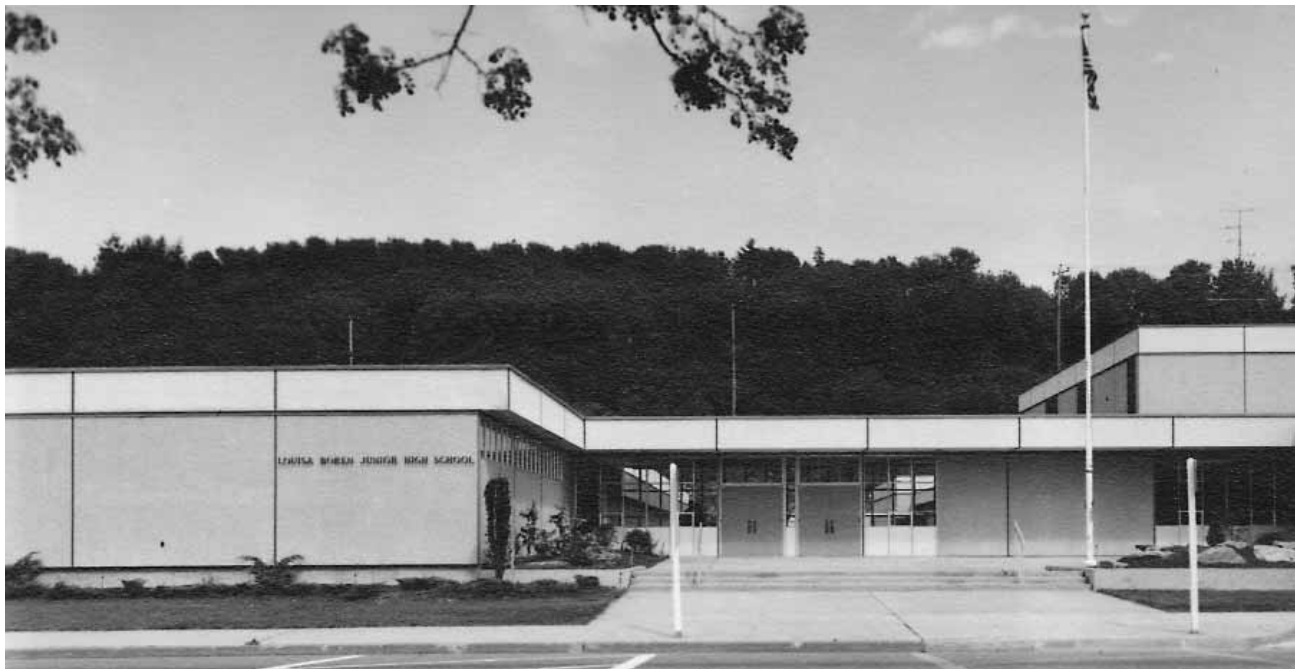
Boren, ca. 1963