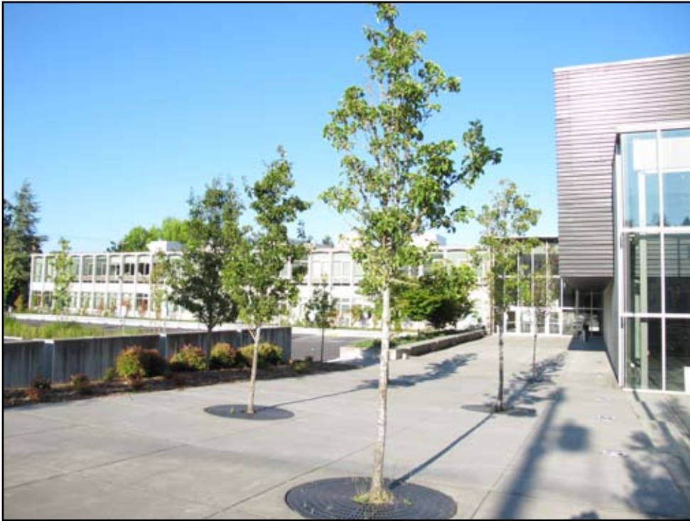
The Johnson Partnership, August 2012