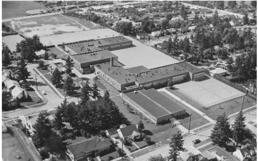
View Ridge, 1963 SPSA 277-1

1944: Opened on November 10 as annex to Bryant 1948: Closed in June