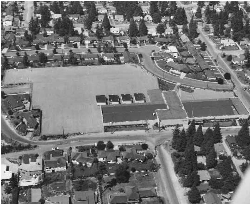
Wedgwood, 1960 SPSA 279-1

1954: Named on April 16 1955: Opened on June 1