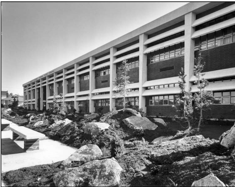
Seattle Public Schools

Edward Mahlum also designed Decatur Elementary (1961).