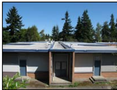
The Johnson Partnership, August 2012