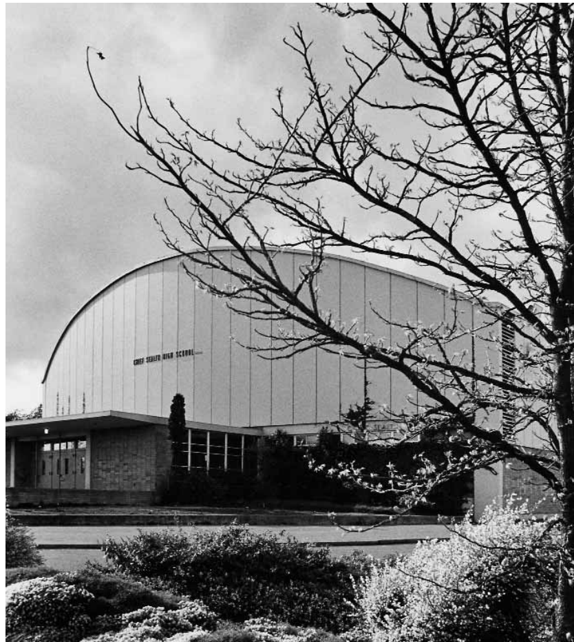
Sealth, 1973 SPSA 018-6

In 1988, West Seattle parents debated a proposal to create a “mega-Sealth.” In the plan, West Seattle High School would close and its students consolidated at Sealth. Sealth, in turn, would expand into Denny Middle School, whose students would be sent Boren and Madison. The value of the larger school would have been in providing students a larger number of classes from which to choose. This plan did not become reality, however.