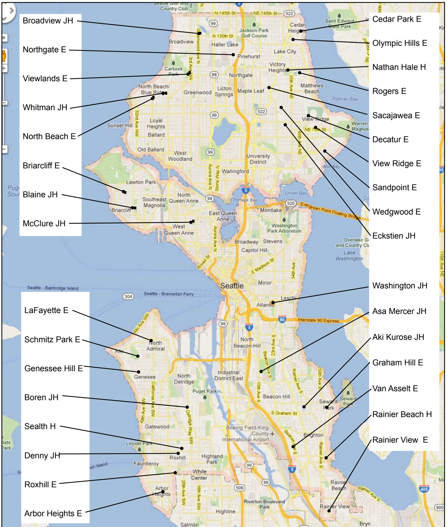
Figure 1 • Location Map

*abbreviations: E=Elementary School, JH=Junior High School, H= High School