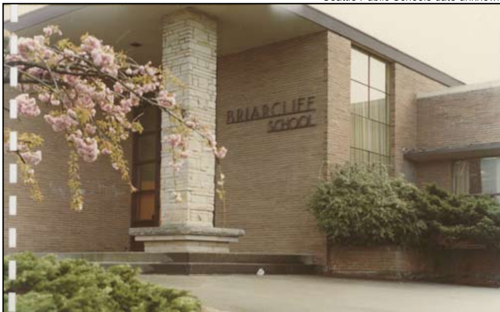
The Johnson Partnership, August 2012