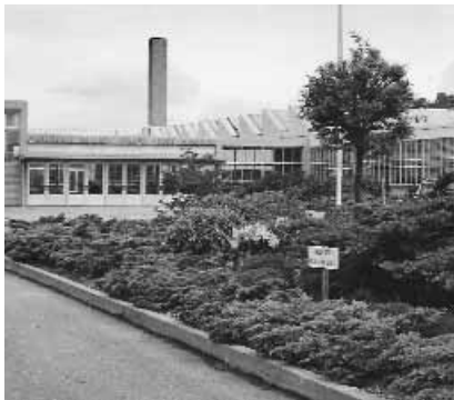
Blaine, 1960 SPSA 101-2

The building contains 11 regular classrooms, two music rooms, two science rooms, two home economics rooms, two art rooms, three shops, a library, two gymnasiums that open onto each other to become one large court, a spacious office suite, and custodial quarters. There is also an auditorium/lunchroom with kitchen facilities at one end and a stage at the other. The parks department wing contains three large rooms, offices, a kitchen, and a lobby.