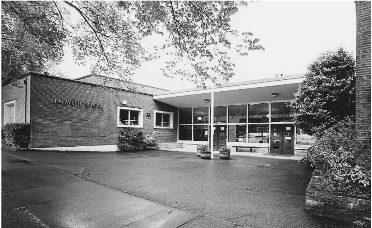
Lafayette, 2000