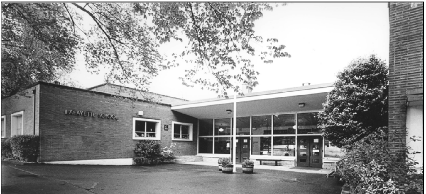
Seattle Public Schools 1949

John Graham & Co. also designed North Beach Elementary (1958), Olympic Hills Elementary (1954), Roxhill Elementary (1958), Wedgewood Elementary (1955), & Washington Junior High (1963).