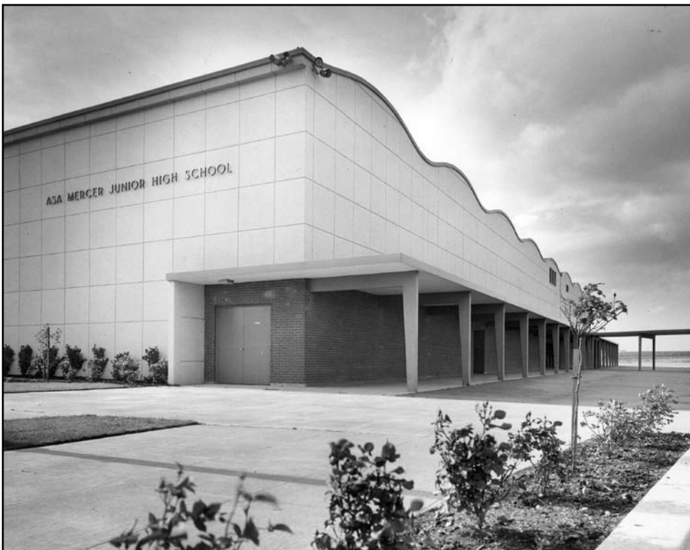
Seattle Public Schools