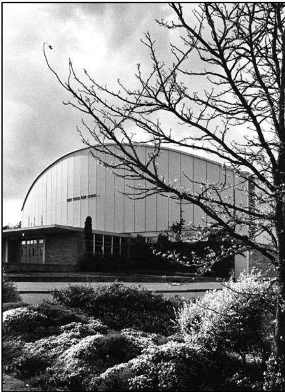
Seattle Public Schools