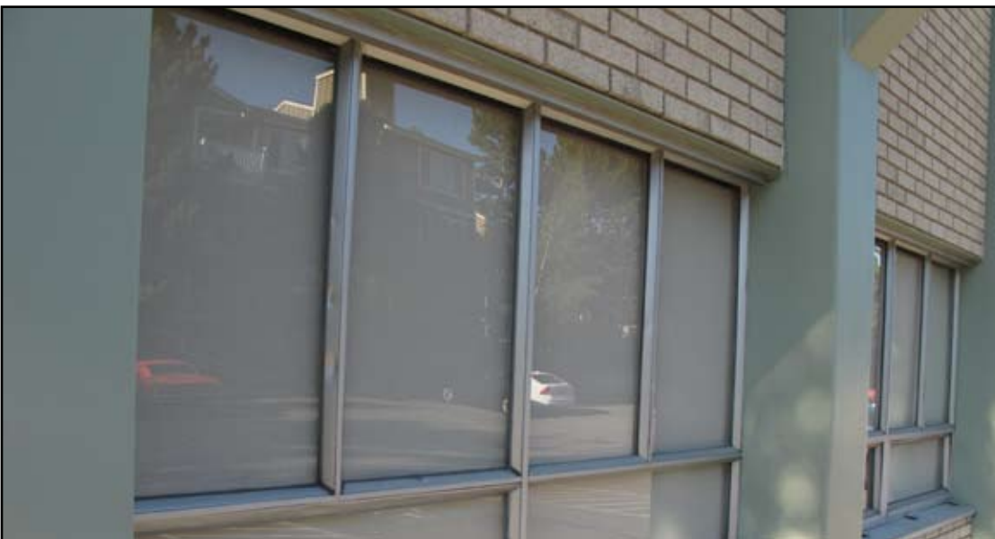
The Johnson Partnership, August 2012