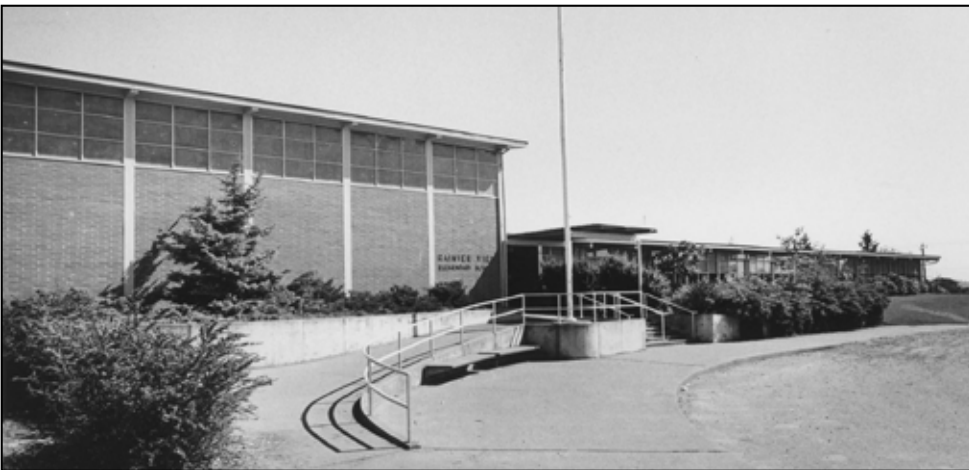
Seattle Public Schools