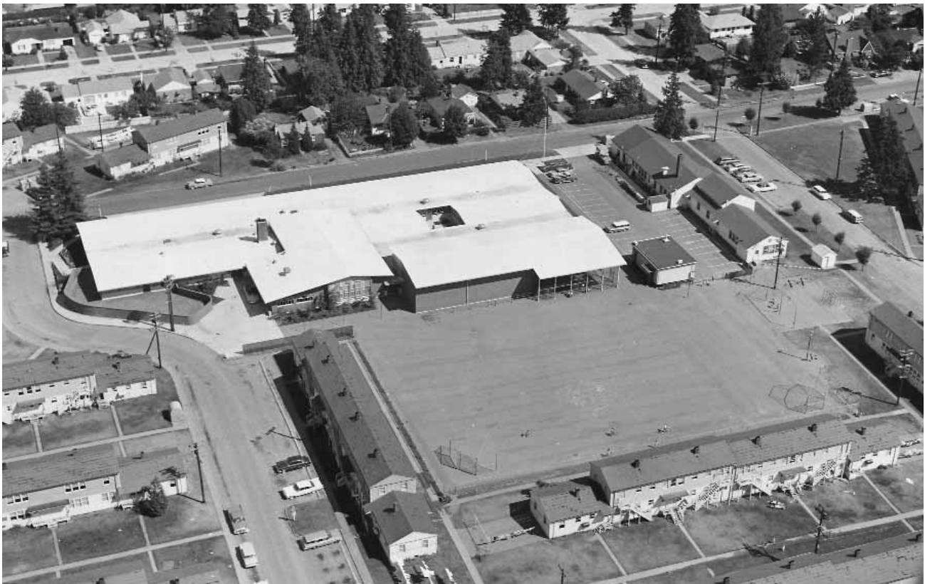
Decatur, 1963 SPSA 287-1

In 1979–80, a “modified Montessori classroom” for 27 children in grades 1–3 was added. An innovative program called “The House System” began at Decatur in September 1983, patterned on a similar system in New Zealand. The purpose was to provide “an opportunity for children to mix and work with children from across grades, races, and social groups.” Each fall, the entire student body was divided into four