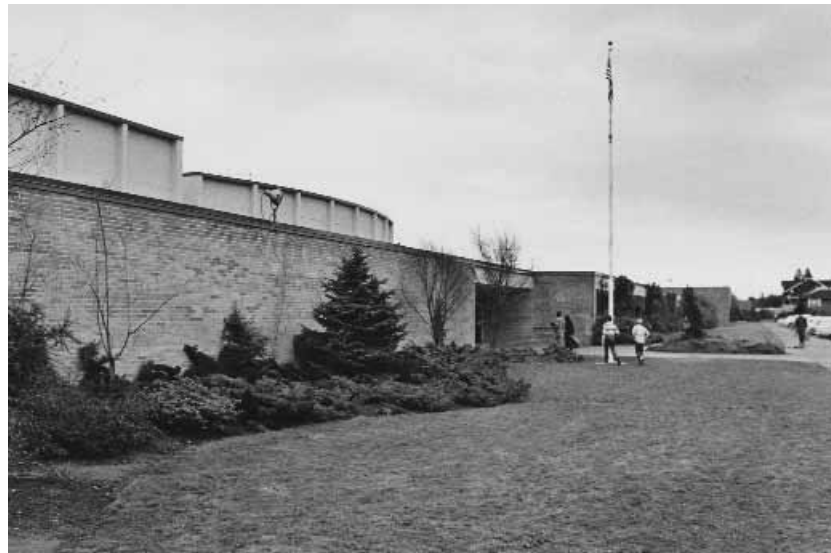
Whitman, 1972

Beginning in 1996–97, a new track, soccer field, and baseball field were built west of the school in a PTA project that relied on contributions from community organizations. Today approximately 16 percent of the students are in the Spectrum program for the highly capable. Whitman’s 6th graders who demonstrate good citizenship and good academic effort can attend a camp at Warm Beach at the end of the school year.