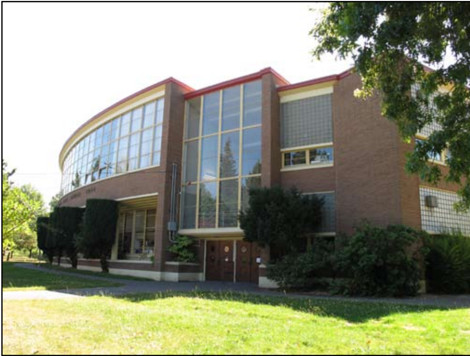
The Johnson Partnership, August 2012