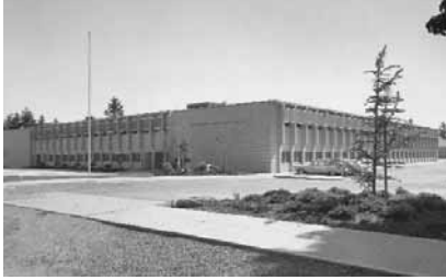
Thomson, 1964 SPSA 116-162