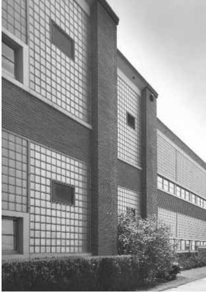
Eckstein, 1960 SPSA 104-5

and 143 from Madrona), and children from the Eckstein attendance area were transported to Meany-Madrona.