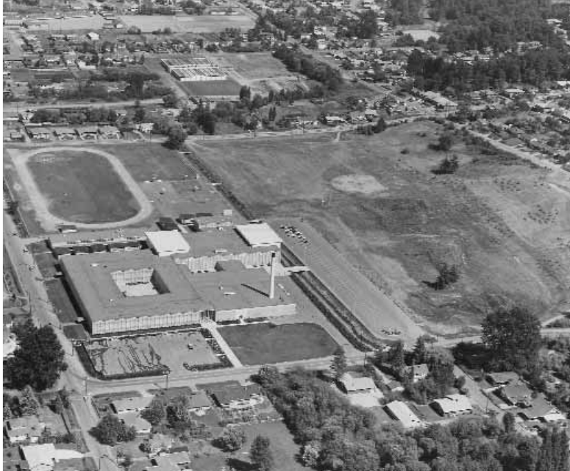
Hale, 1965 SPSA 022-1

Named after the American Revolutionary War hero, who proclaimed, “I only regret that I have but one life to lose for my country,” Nathan Hale assumed independence as a school-wide theme. Its colors are red, white, and blue, and its student body is at liberty to pursue diverse fields of study. The likeness of a 1776 Minuteman on its distinctive smokestack was painted in the dark of night, presumably by a student or students. The hallways are painted red, white and blue.