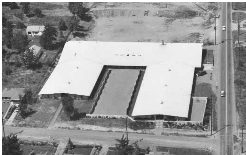
Northgate, 1960 SPSA 257-3

Today Northgate has a diverse, multiethnic student population. Its state-of-the-art computer lab provides one computer per student. In a year-long Young Authors project, each child produces a book, story, and a set of poems that are typed, illustrated, bound, and presented to an audience.