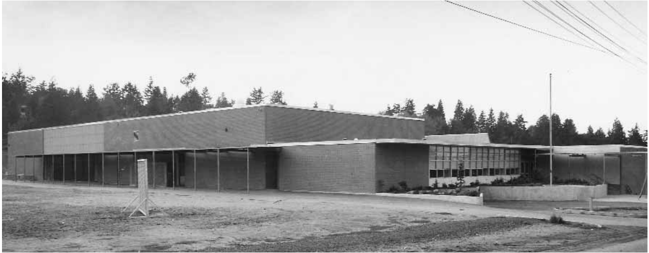
Sacajawea, 1960 SPSA 268-4

With the expansion of Seattle city limits north to 145th Street in 1953 came the problem of how to provide classroom space for students living in the Maple Leaf neighborhood between Bothell Way and 15th Avenue NE, and NE 85th Street and NE 105th Street. That fall, almost 200 children from that area, called Victory Heights, were transported to University Heights in the University District.