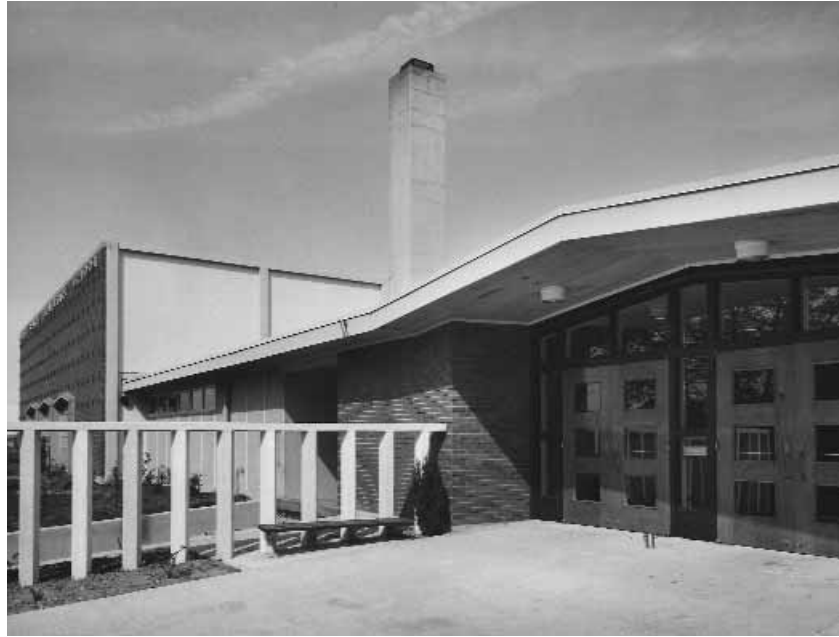
North Beach, 1960 SPSA 259-2

1958 to 446 pupils, many of whom had previously been at overcrowded Crown Hill and Loyal Heights.