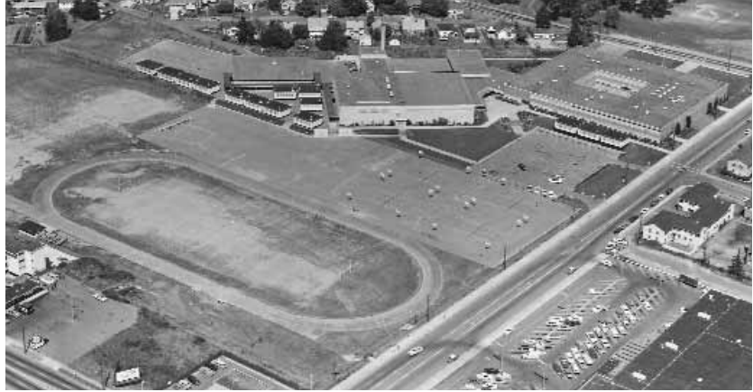
Rainier Beach, 1965 SPSA 021-1

By 1967, the school was overcrowded, with 2,159 students housed in a building designed for 1,500. The principal, Don Means, urged the school district to establish a separate facility for the younger students. The Model Middle School began in portables on the grounds of Rainier Beach in September 1970. The first year only 7th graders attended the middle school; the next year it comprised grades 7–8. The middle school moved to a new permanent building called South Shore in December 1973. The following September, American Indian Heritage School moved into the portables at Rainier Beach.