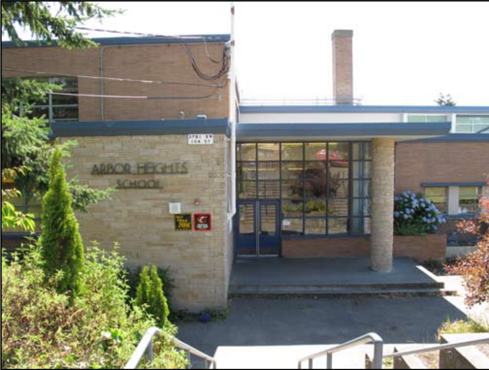
The Johnson Partnership, August 2012