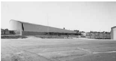
Sealth, 1958 SPSA 018-8

The construction of the new school was unique for the region, although it had been used extensively in other countries. It was selected because of its ability to withstand earthquakes. Known as a "thin-shell" type of building, the structure is all concrete with three-inch walls. The