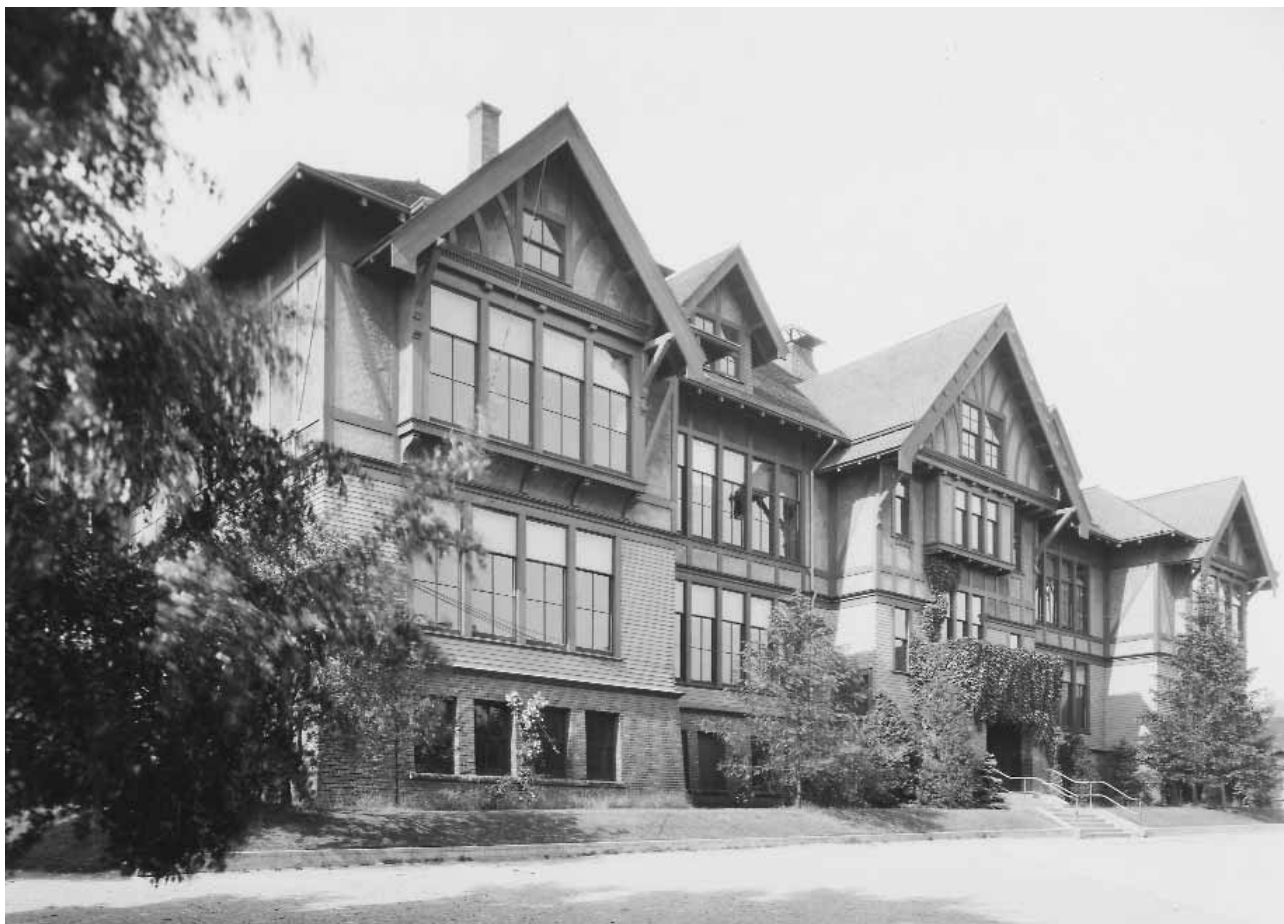
Franklin, ca. 1920

Few schools can look back in their history and find a grade school, a junior high school, and a high school. In fact, at its inception in 1906 as Franklin School, Washington had a dual purpose.