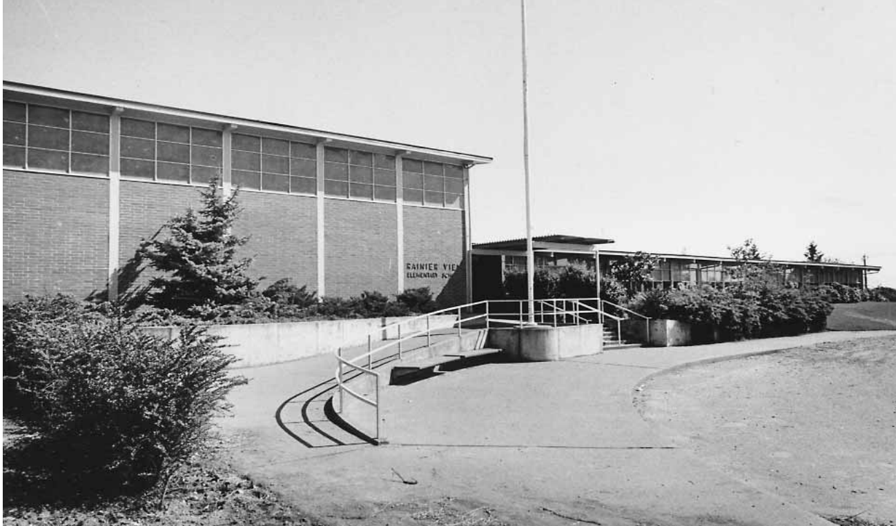
Rainier View, ca. 1973 SPSA 264-4

Name: Southeast Beacon Hill School Location: 11230 Luther Avenue Building: Portables Site: 9.5 acres