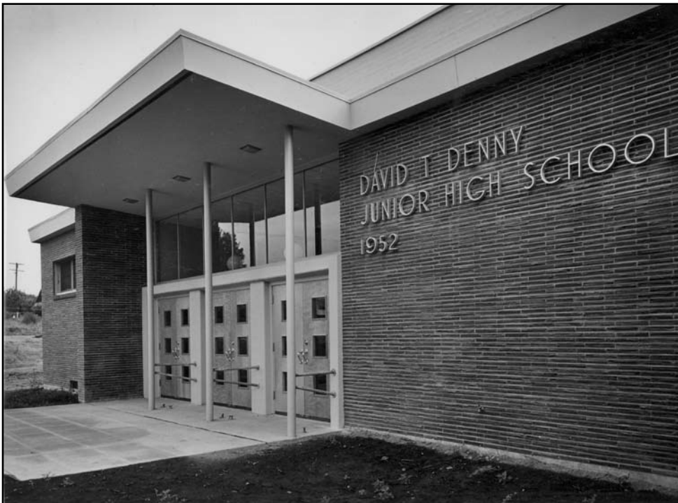
Seattle Public Schools