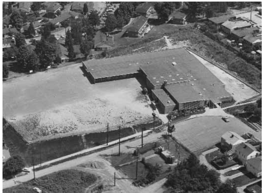
Sand Point, 1960 SPSA 269-1

1957: Named on February 15 1958: Opened in September 1988: Closed in June 1990: Leased to North Seattle Community College