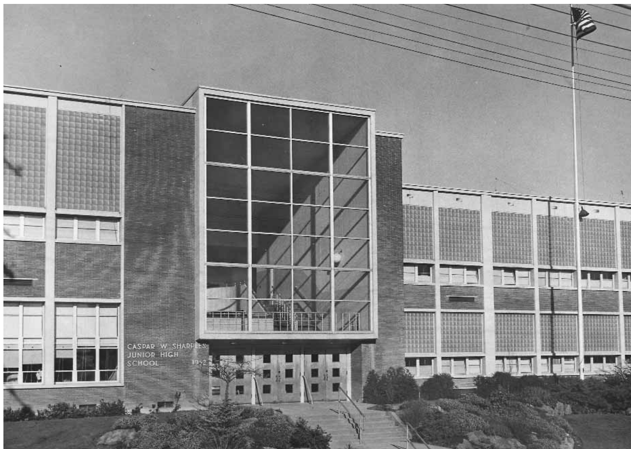
Sharples, ca. 1960

In 1952, Casper W. Sharples Junior High School opened to serve a large area in south Seattle, taking in students from Beacon Hill, Muir, Whitworth, Hawthorne, Van Asselt, Emerson, Brighton, Dunlap, Columbia, and Rainier View. In addition to over 1,220 students in grades 7–9, 130 sixth graders attended the new school that first year.