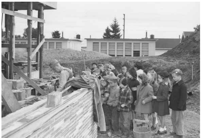
View Ridge, 1948: Permanent building under construction in foreground PI Coll. MOHAI 25742

In 1910, the area that would become View Ridge was still old growth forest. In the early 1930s, only a few farms dotted the undeveloped land above the Sand Point Naval Air Station. In 1936, two former radio station workers bought the hill between Wedgwood to the west and Hawthorn Hills to the south and settled there. At first, growth was slow, but it began to accelerate after the area was annexed into the City of Seattle in the mid-1940s.