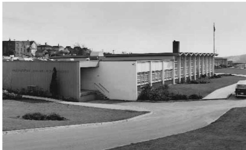
Washington, 1968 SPSA 117-8

In 1970, the junior high school was converted for use as an annex