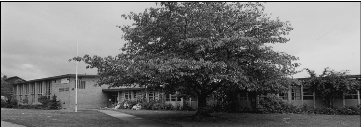
Seattle Public Schools