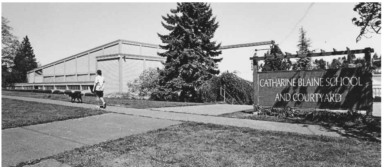
Blaine, 2000