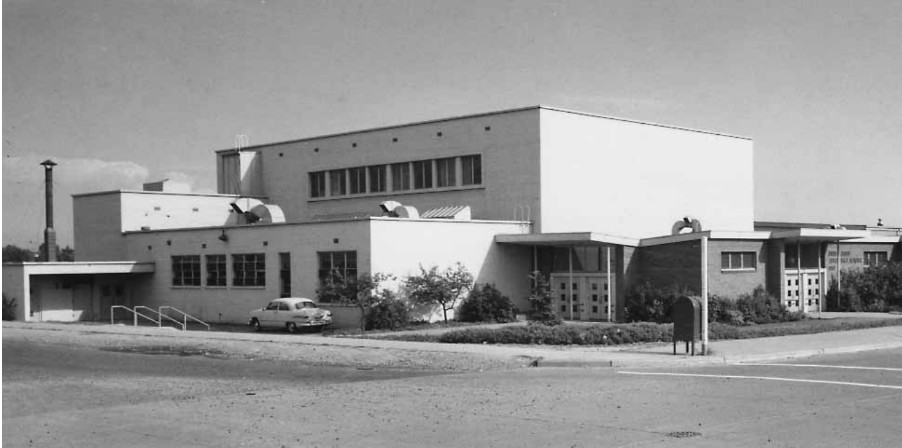
David T. Denny, 1958 SPSA 103-3

The junior high school facility is single-story with five buildings on three levels joined by breezeways. It is comprised of 35 classrooms, a library, combination lunchroom-auditorium, and a gymnasium.