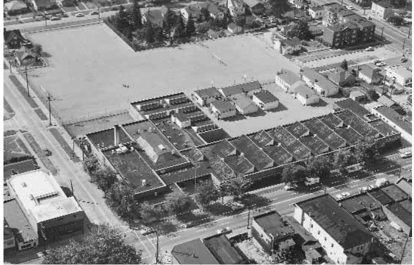
Lafayette, 1960 SPSA 239-17

about why you couldn't go up to the third floor—like about all the evil things that would happen to you.”