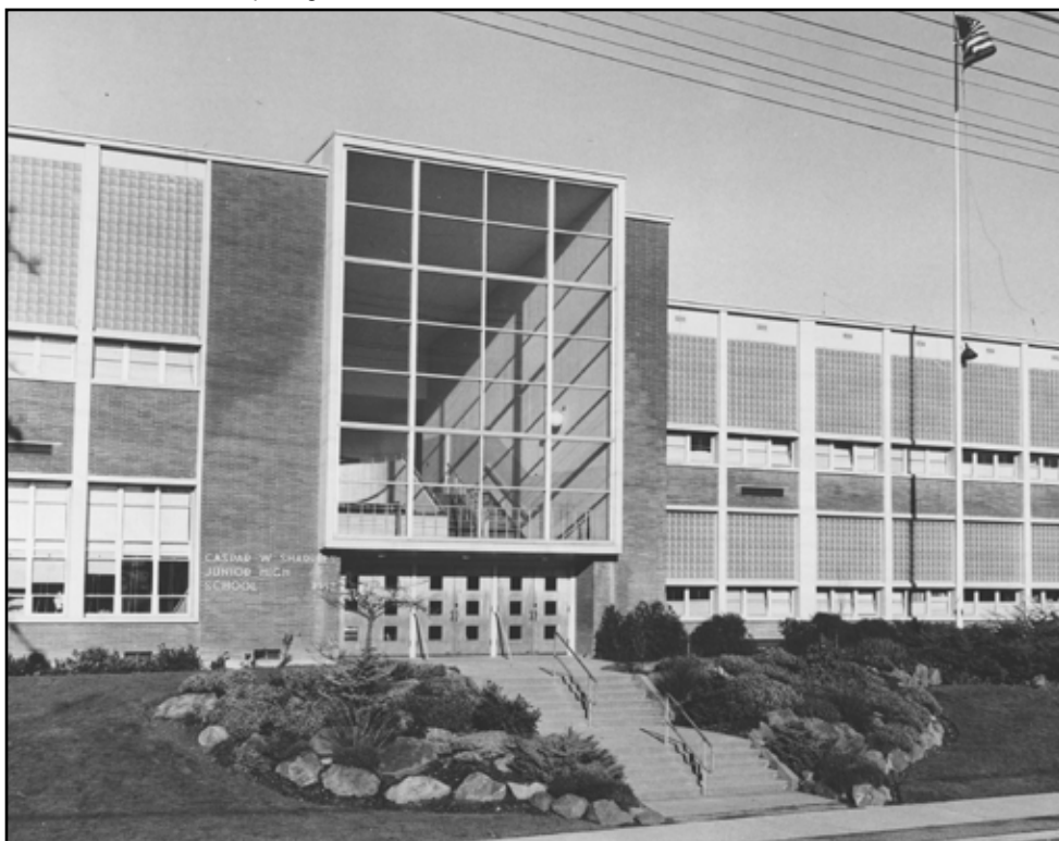
Seattle Public Schools