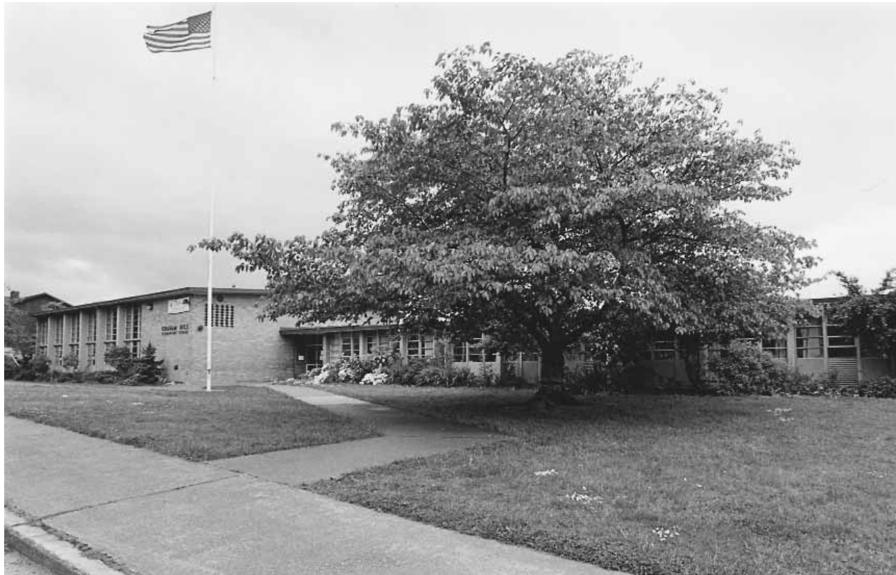
Graham Hill, 2000