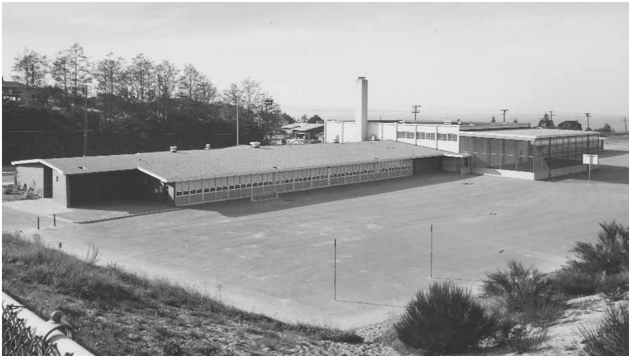
North Beach, 1960 SPSA 259-1