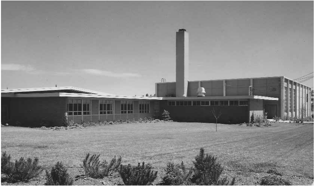
Roxhill, 1960 SPSA 267-4

In the early 1950s, residents of Roger's First Addition in West Seattle decided they needed a community club to improve and protect the neighborhood. They chose the name "Roxhill" to define their location on the hill north of Roxbury Street. After organizing their club, the members focused on two priorities: acquiring a neighborhood playground and a school for the 140 children in their four-square-block area.