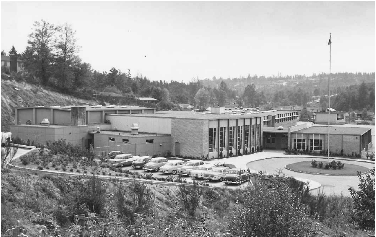
Rogers, 1958 SPSA 266-4

The La Villa Station on the Seattle, Lake Shore & Eastern Railway stood near (N)E 98th Street and 49th Avenue NE. It served as a rail connection for the La Villa Dairy. The first Maple Leaf School operated nearby from 1896 until just before 1910.