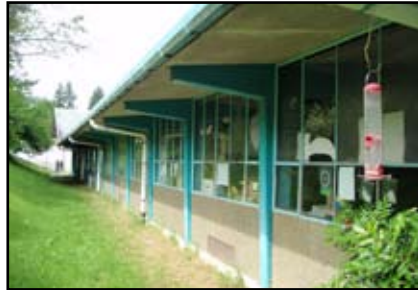
The Johnson Partnership, August 2012