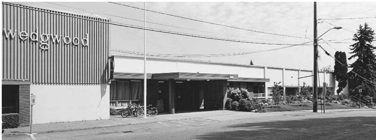
Wedgwood, 2000 SPSA 279-5