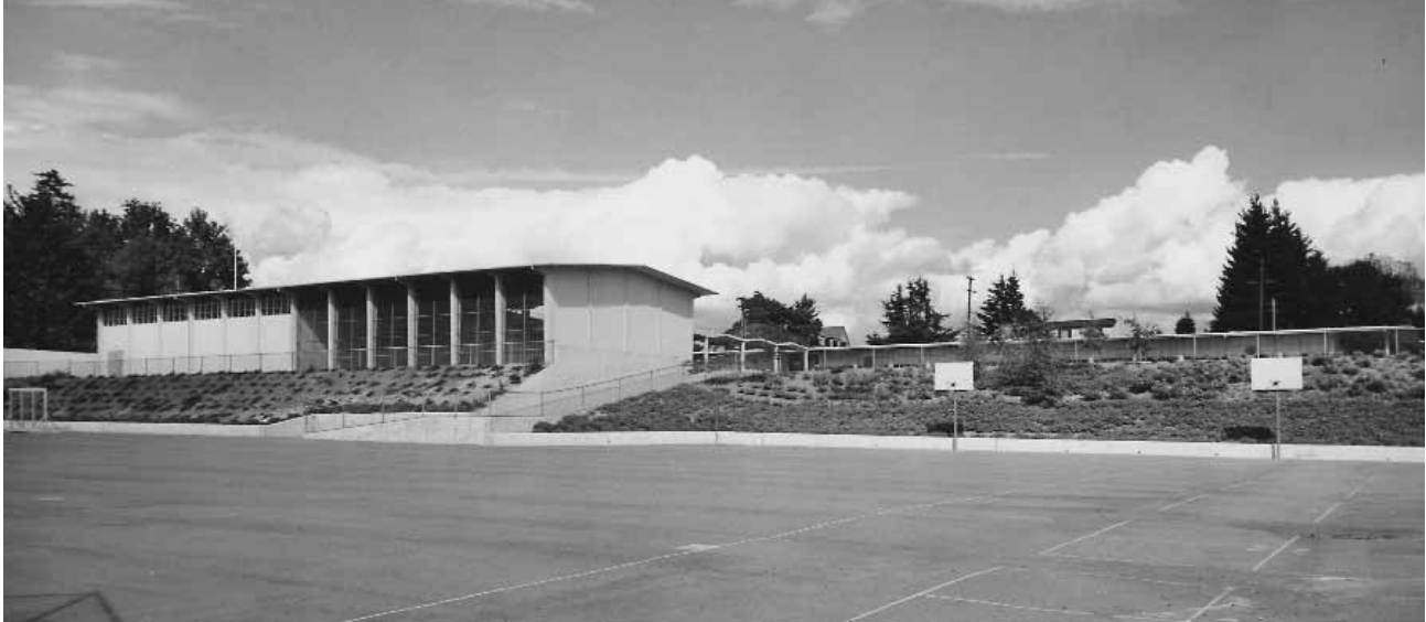
Cedar Park, 1963 SPSA 210-4

Name: Cedar Park Elementary School Location: 13224 37th Avenue NE Building: 11-room, 1-story precast cement Architect: Paul Thiry Site: 4.38 acres