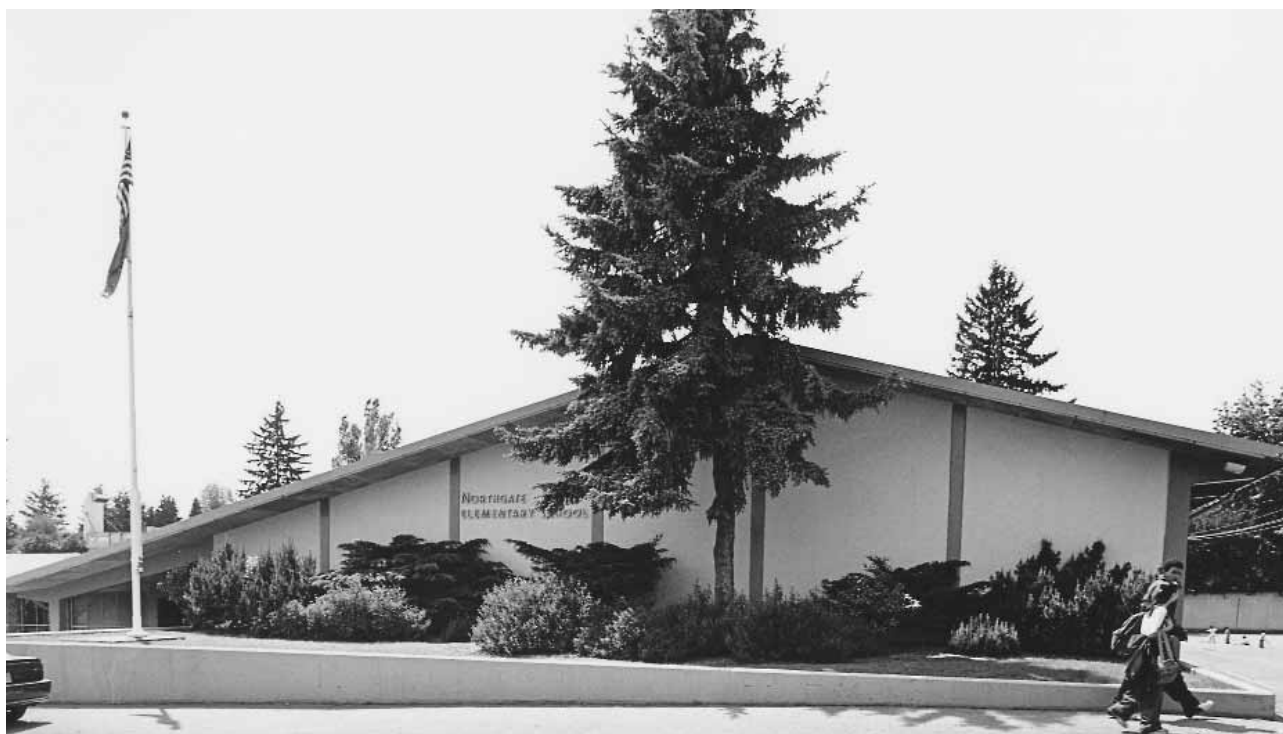
Northgate, 2000 SPSA 257-6

After World War II, as the economy boomed and growth in suburban areas around Seattle accelerated, a new concept emerged to change the face of North America: the suburban shopping mall. America's first shopping mall, Northgate Shopping Center opened in 1950 on the suburban fringes of north Seattle. Northgate, a cluster of stores surrounded by ample parking with nearby highway access, became the model for regional shopping centers across the country. Northgate was an immediate success and led directly to growth in the surrounding area, both in terms of other businesses and new homes.