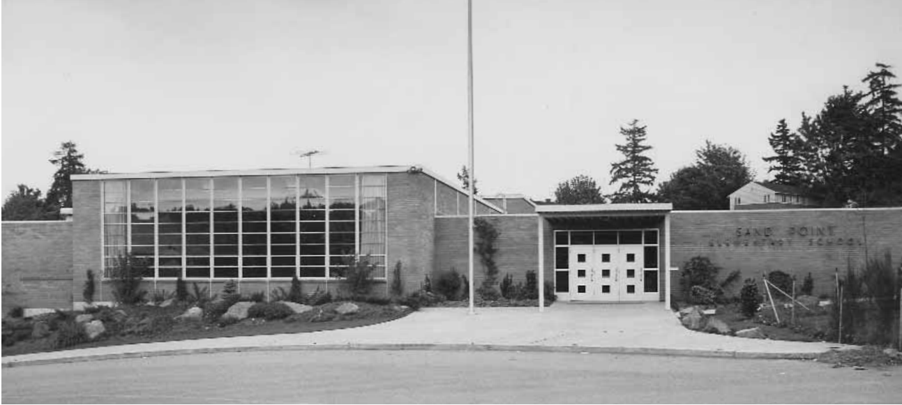
Sand Point, 1960 SPSA 269-2

A construction bond issue passed in November 1956 provided the funds for a permanent Sand Point facility. The architects' plans called for 14 classrooms, a gymnasium, cafeteria and kitchen, a book room with audio-visual facilities, administrative offices, and faculty rooms. Additional features included forced hot-water heating and both incandescent and fluorescent lighting. In September 1957, work began on the new building on the site of the old orchard. One year later 13 teachers greeted 407 pupils at the doorways of their new classrooms. A few weeks later, one more teacher joined the staff and every classroom was in use.