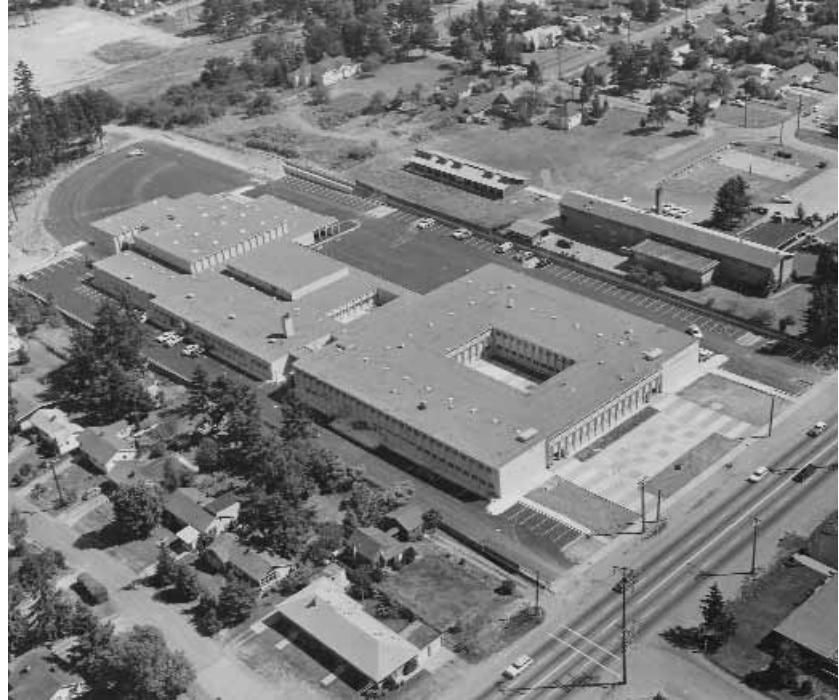
Thomson, 1963 SPSA 116-161

September 1978, Thomson took in 6th graders who had just completed Graham Hill, Northgate, Olympic View, or Viewlands.