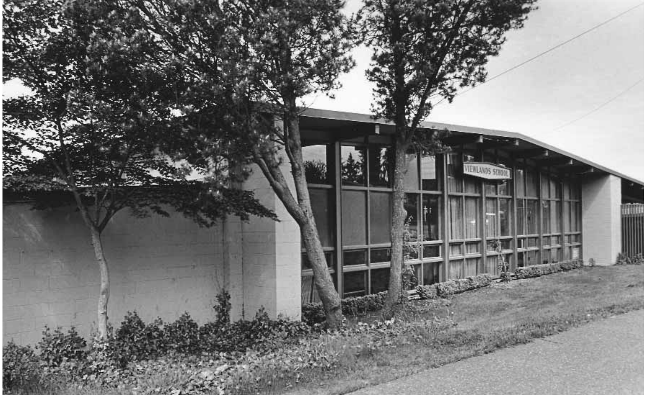
Viewlands, 2000 SPSA 276-6

By 1911, Children in the western part of the Oak Lake School District No. 51 had to cross a highway and interurban tracks to get to Oak Lake School. For the safety of younger children, a one-room schoolhouse was built at 105th and Greenwood for grades 1-2. This "Little Green School" remained open after World War I. The Bethel Presbyterian Church held services there in 1919.