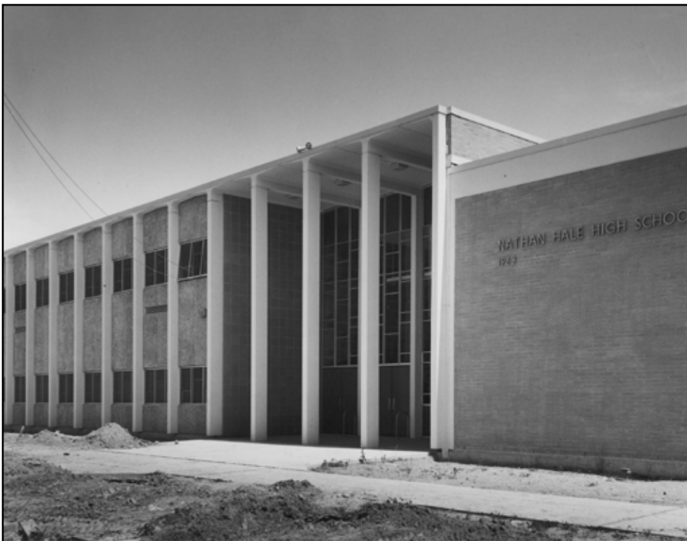
Seattle Public Schools