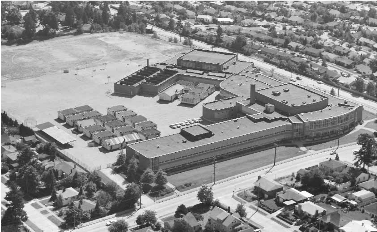
Eckstein, 1965 SPSA 104-3

In September 1971, Eckstein became a middle school along with Hamilton, Wilson, and Meany-Madrona housing grades 6–8. As part of a district-wide desegregation plan, groups of students from the Meany-Madrona area were bused to Eckstein (60 students came from Leschi