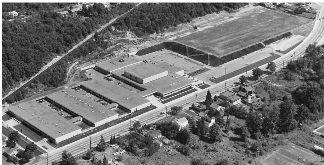
Boren, 1965

Cooper was the next school in need of temporary quarters and they moved into Boren in September 1989. At this time, the Indian Heritage School was moved to a leased building at 315 22nd Avenue S and subsequently to Wilson. For one school year (1993–94), Alternative Education IV made its home at Boren and then moved to Genesee Hill.