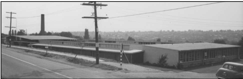
Seattle Public Schools