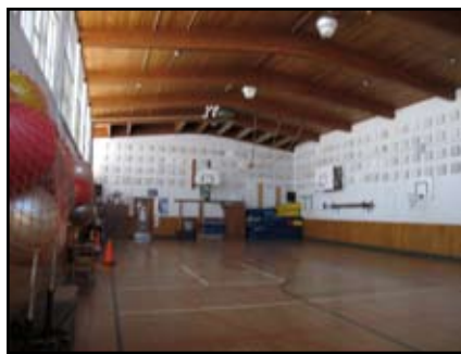
The Johnson Partnership, August 2012