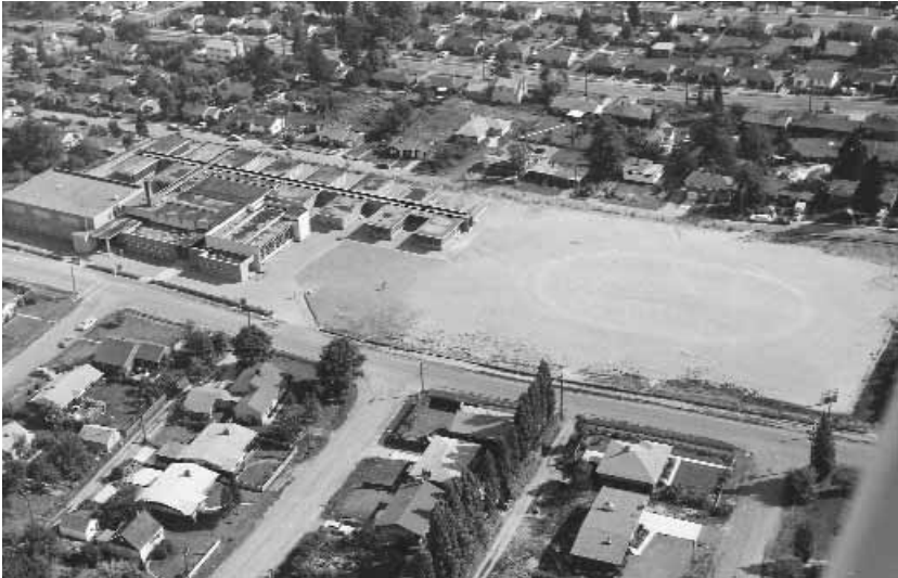
Arbor Heights, 1960

city school within the county caused some jurisdictional confusion concerning transportation and other issues.