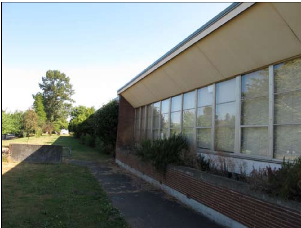
The Johnson Partnership, August 2012

This is the only school designed by Jones & Binden during this period.