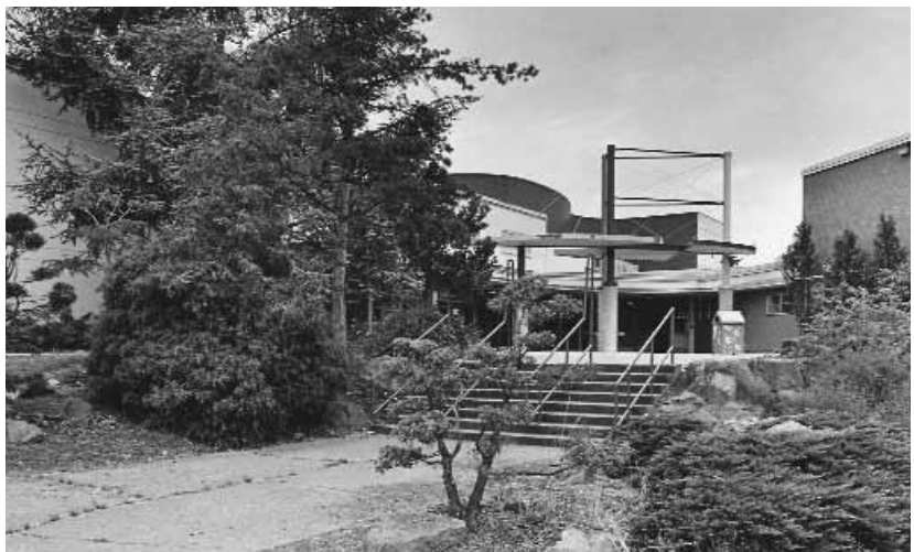
Rainier Beach, 2000, entrance to Performing Arts Center ©Mary Randlett SPSA 021-84

During the 1980s and 1990s, a district policy limiting the percentage of minority enrollment in any one school meant that some neigh-