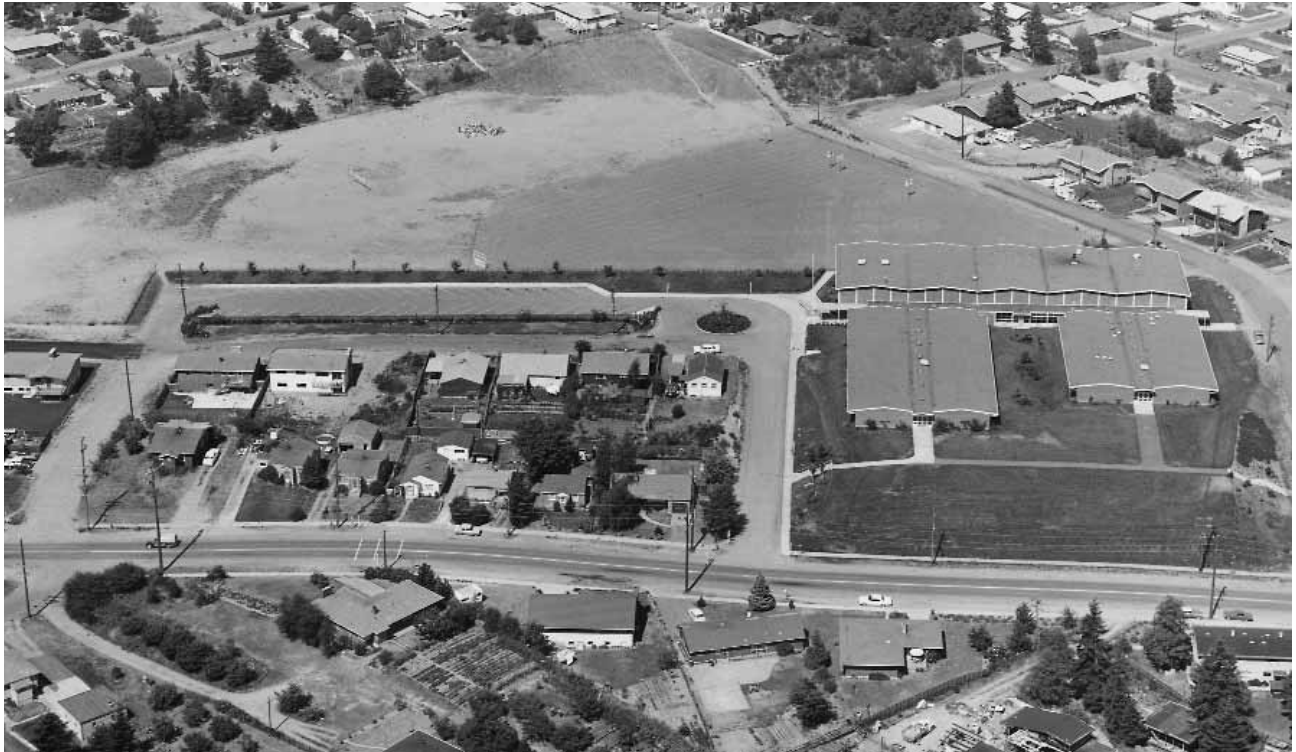
Rainier View, 1965 SPSA 264-1

In 1951, a committee from the Rainier Valley Community Club asked the Seattle Parks Department to install a playfield in the southeast Beacon Hill area. They were told that there first had to be a school in the area. The committee approached the Seattle School Board in 1952 and, in January 1953, Southeast Beacon Hill School was opened in an old gravel pit with five portables for grades K-3 to help ease overcrowding at Dunlap and Emerson.