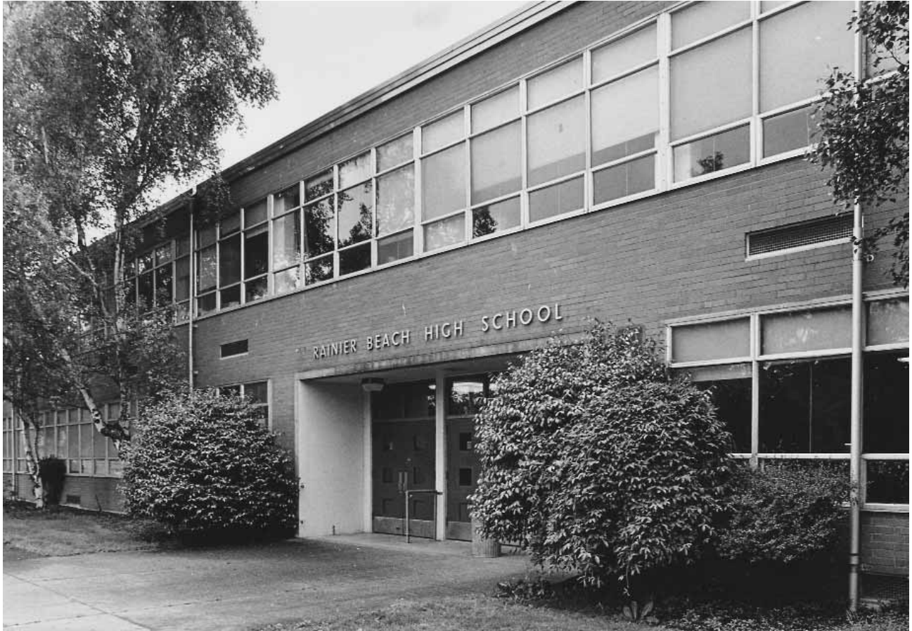
Rainier Beach, 2000 SPSA 021-82