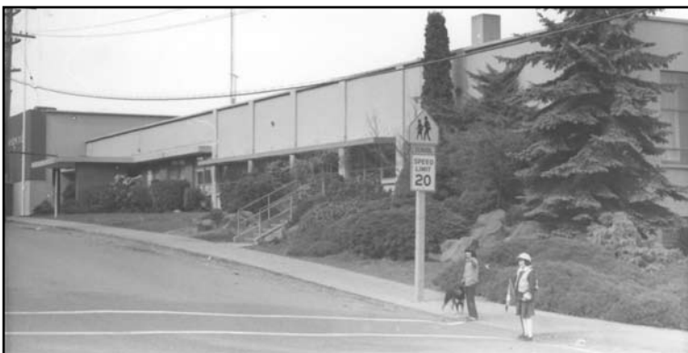
Seattle Public Schools

Supplement to Cedar Park Elementary Landmark Nomination Report