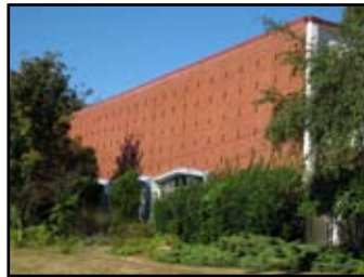
The Johnson Partnership , August 2012