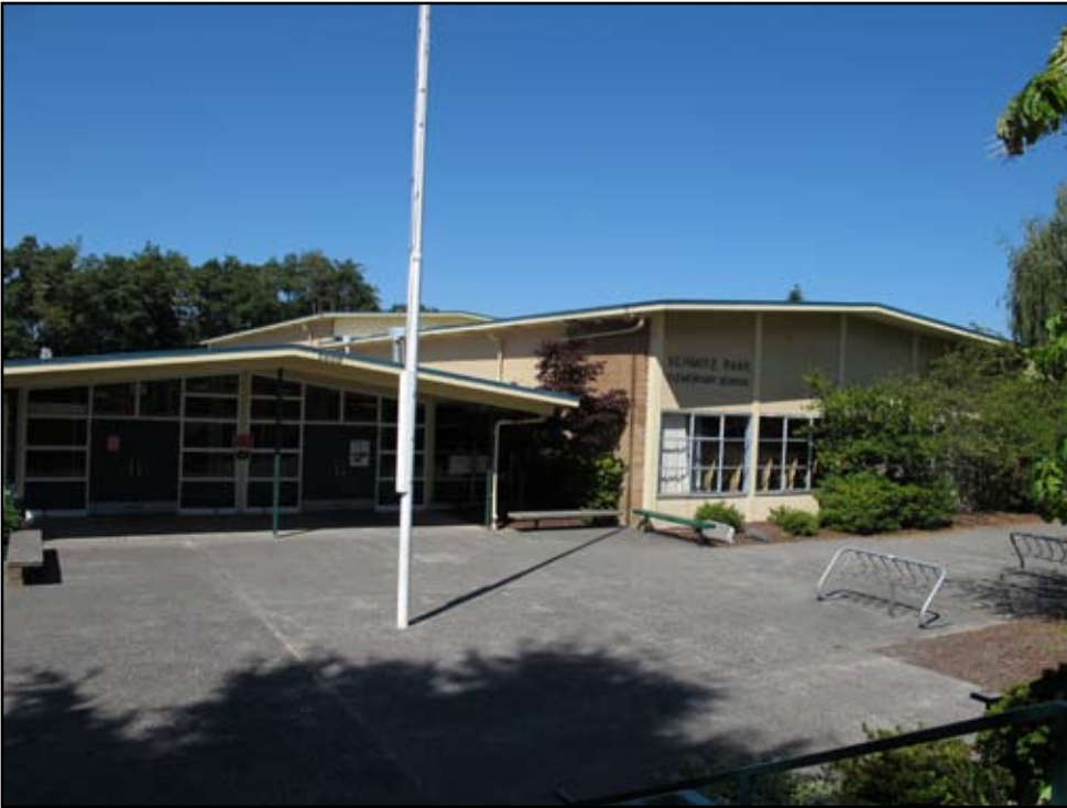
The Johnson Partnership, August 2012