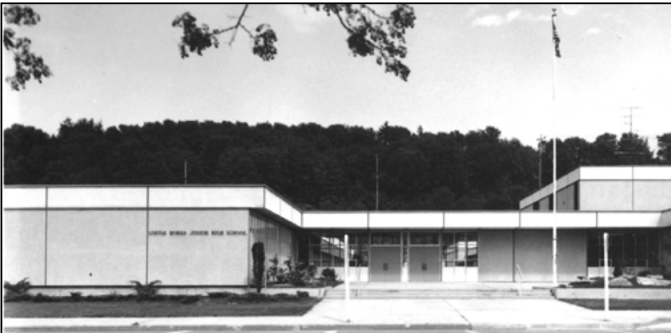
Seattle Public Schools