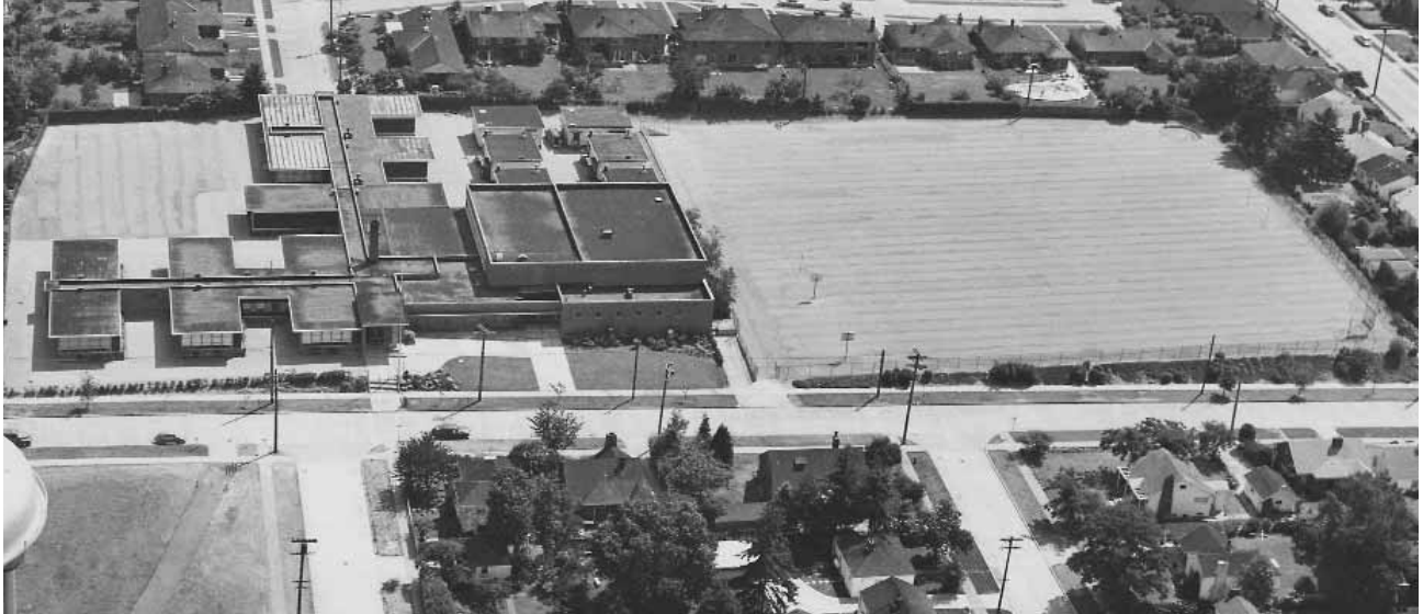
Briarcliff, 1960

became K-6 in 1982-83 after the closure of Blaine. In 1983-84, the combined student population was steady at 310.