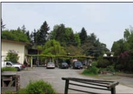
The Johnson Partnership , May 2012