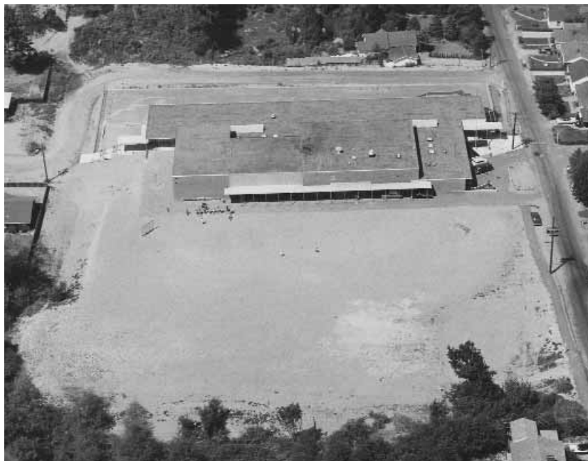
Sacajawea, 1960 SPSA 268-2