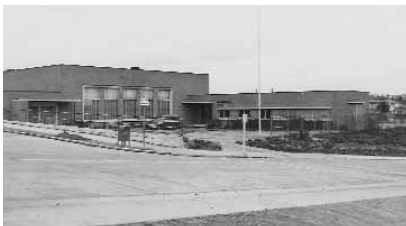
Genesee Hill, 1960

Pathfinder School is an alternative school with a Native-American focus. Pathfinder practices an expeditionary learning approach in which classes embark on learning expeditions focused on an interdisciplinary theme or topic for six or more weeks. The 11 multigrade classes are organized into three halls: Earth, Wind, and Sky. Each class is a “clan” named for an animal. Thus a student will be in the Coyote Clan, rather than the 4th or 5th grade.