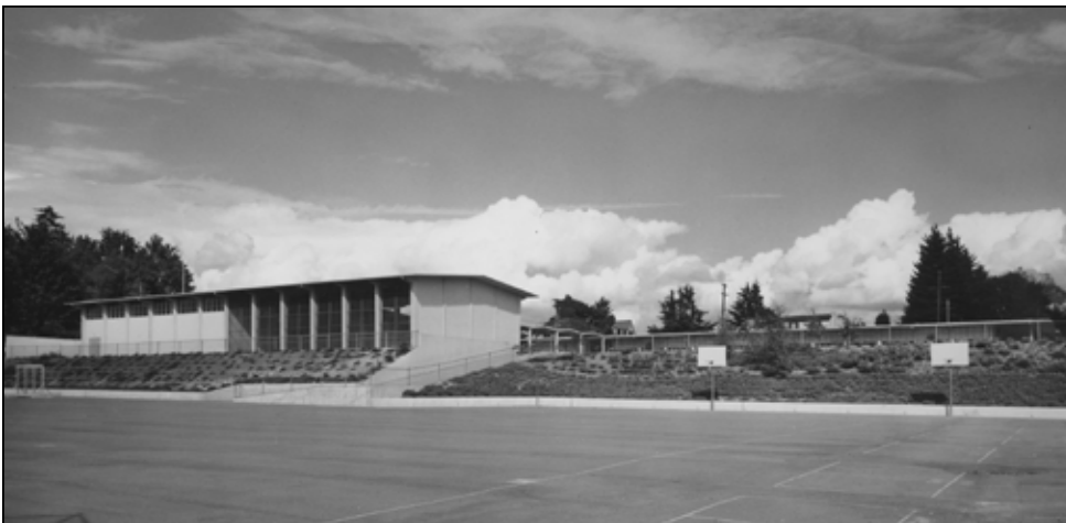
Seattle Public Schools