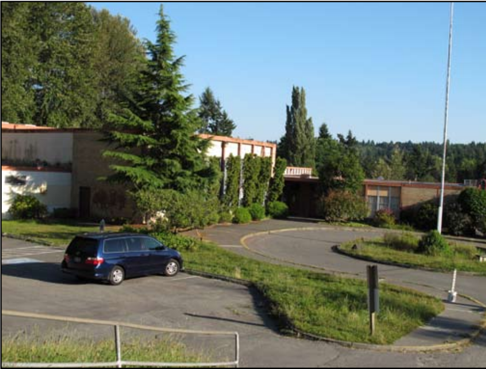
The Johnson Partnership, August 2012