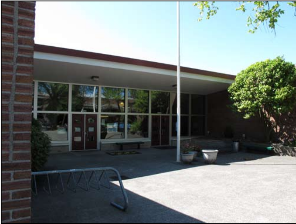
The Johnson Partnership, August 2012