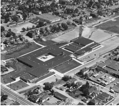
Washington, 1965 SPSA 117-7

Name: Franklin School Location: 18th Avenue S and Main Street Building: 20-room wood frame and stucco Architect: James Stephen Site: 1.41 acres