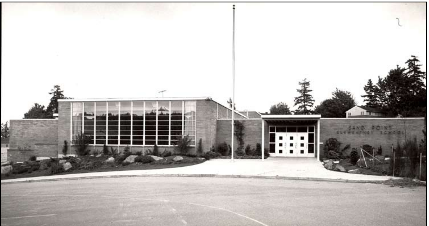
Seattle Public Schools

Stoddard also designed Arbor Heights Elementary (1949), Briarcliff Elementary (1949, demolished), & Genessee Hill Elementary (1949).