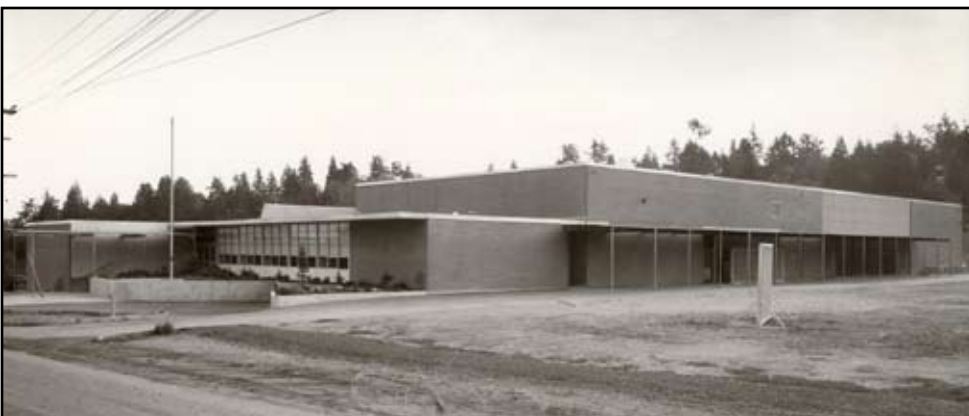
Seattle Public Schools

Supplement to Cedar Park Elementary Landmark Nomination Report