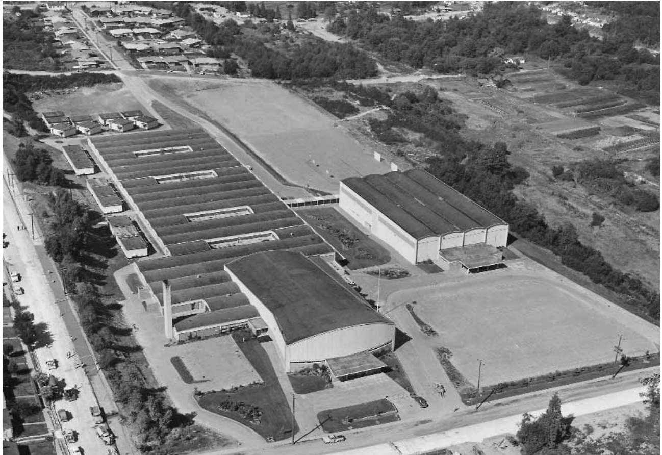
Sealth, 1963 SPSA 018-1

In June 1954, the growing population in southwest Seattle led the Seattle School District to plan for its first new high school in some 30 years. Enrollment estimates indicated that the high school population in West Seattle would reach 4,000 by 1965. The school board selected a site in the Westwood neighborhood near White Center, across the street from Denny Junior High School.