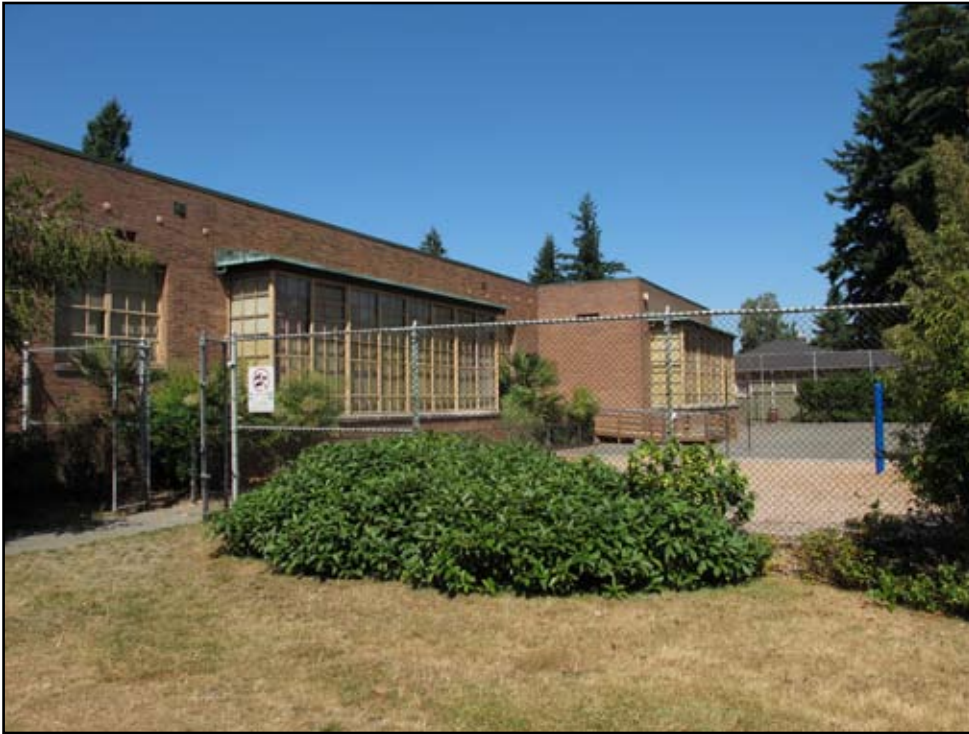
The Johnson Partnership , August 2012