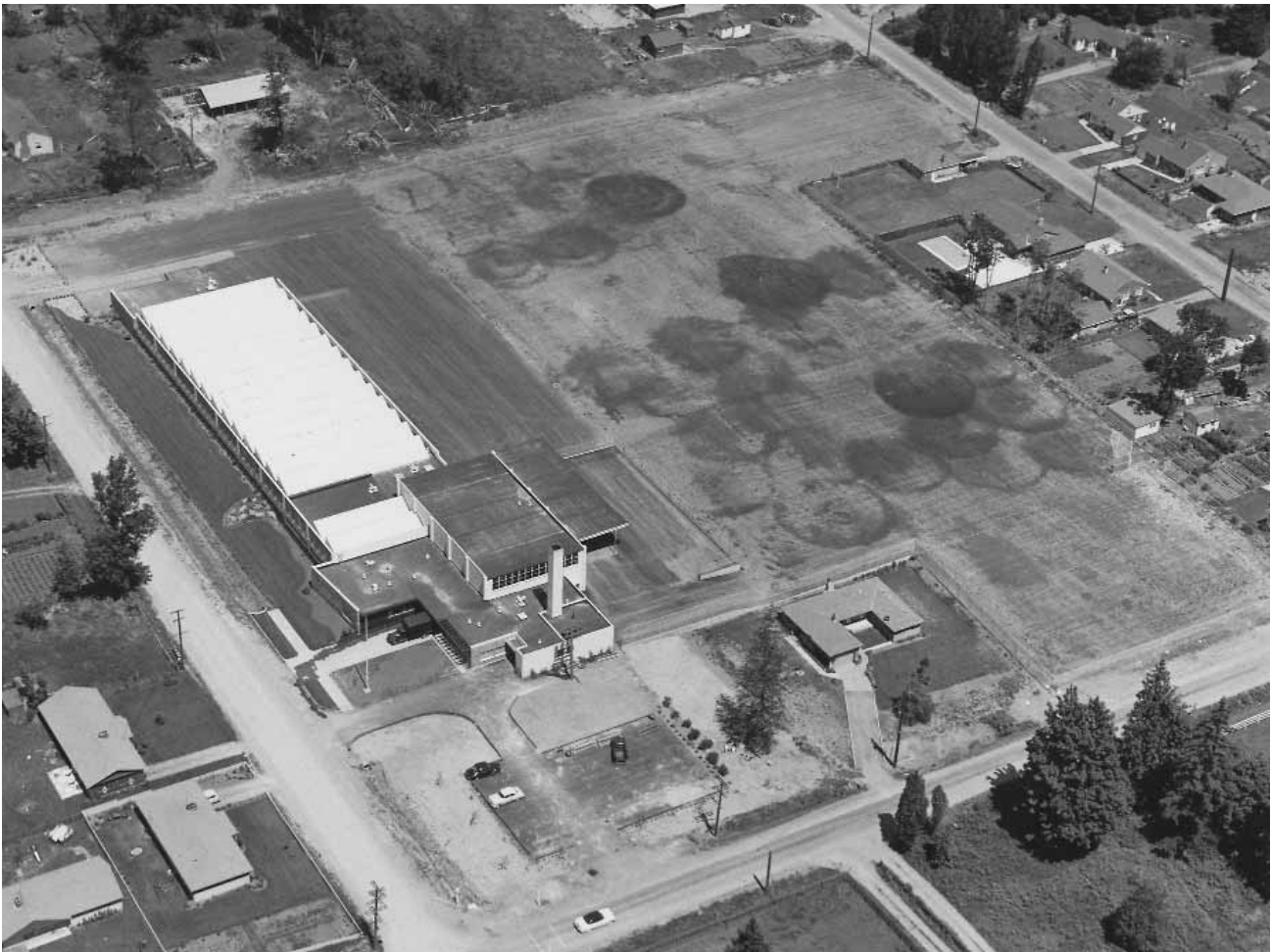
Olympic Hills, 1955 SPSA 261-1

The current project-based curriculum at Olympic Hills allows for choice between single grade level classes or a mix of grade levels. The school has continued its emphasis on experiential learning and students take frequent fieldtrips, sharing what they learn at weekly celebration assemblies. An all-school trip to Camp Long in West Seattle is a highlight of the school year. Students help create a school song book and campfire skits for this end-of-the-year experience.