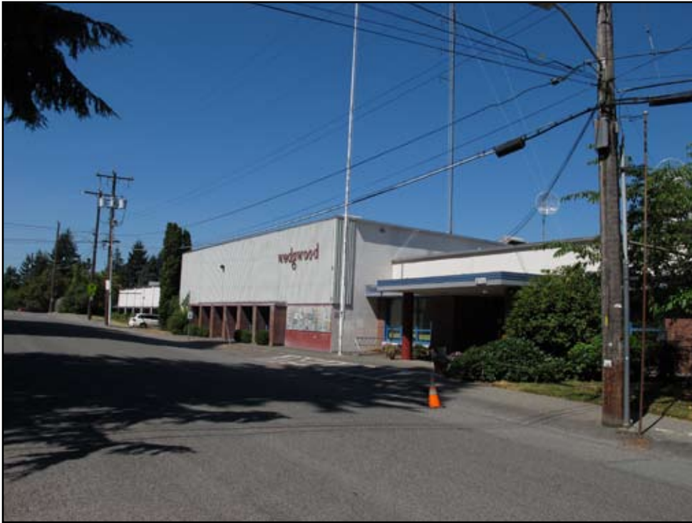
The Johnson Partnership, August 2012