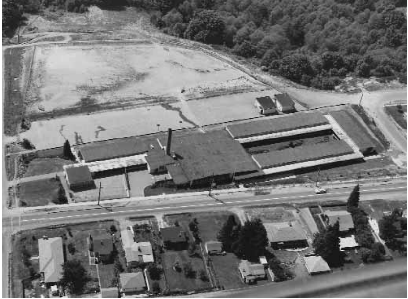
Viewlands, 1960 SPSA 276-2

A pilot program started in a resource room with three teachers and an aide to provide help and enrichment for all handicapped children at the school. In 1982, Viewlands received about 100 students from the closing of Oak Lake School, and enrollment grew to 397. The school remained K–6 through 1988.