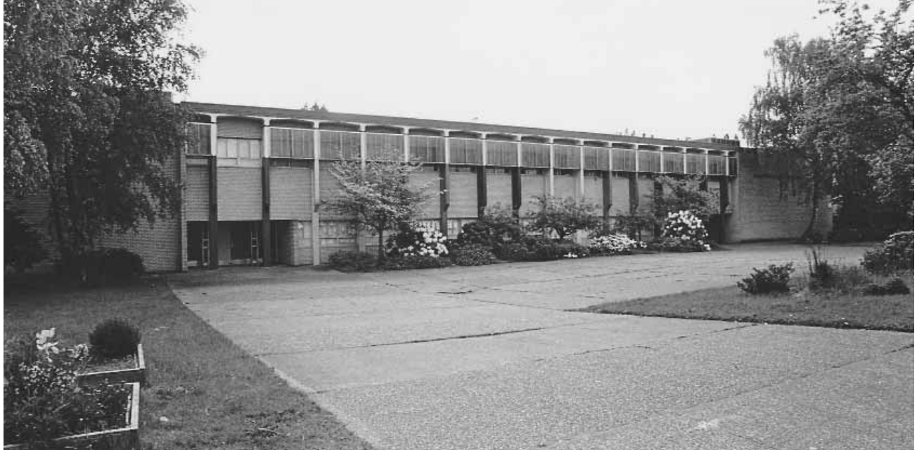
Broadview-Thomson, 2000 SPSA 116-164

Early in the 1900s, a sawmill stood on the western shore of a small lake north of Seattle. The taste of tannic acid left by the logs floating in the water gave the lake its name, Bitter Lake. Playland, an amusement park, opened on the south shore of the lake on May 27, 1930. The Interurban dropped riders off at the Bitter Lake Station, just outside the park. Large crowds from throughout the region came in summer to visit the haunted house and ride the merry-go-round, water slide, and big-dipper roller coaster. In winter, visitors were attracted to the lake for ice skating.