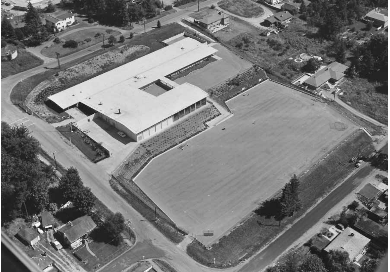
Cedar Park, 1963 SPSA 210-5