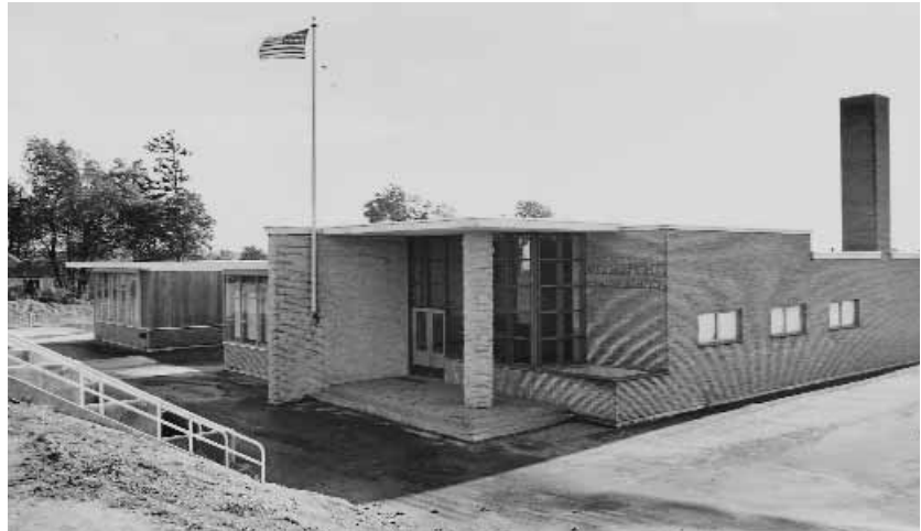
Arbor Heights, ca. 1949 SPSA 203-1

In the early 20th century, the area south of Fauntleroy in West Seattle was sparsely populated, at first it was called Green Acres but later the name was changed to Arbor Heights, perhaps in an effort to promote the sale of property. The one-mile square neighborhood is bounded by SW 98th Street on the north and 30th Avenue SW on the east. Early residents founded their own church (Arbor Heights Church) and community club (Arbor Heights Community Club).