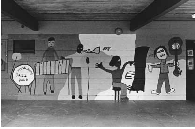
Viewlands, 2000 SPSA 276-7