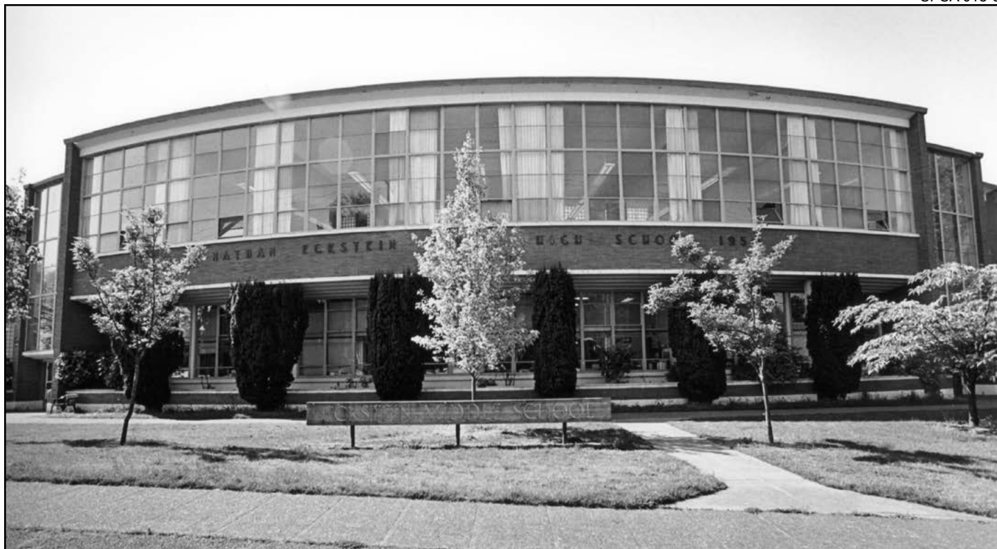
Figure 19. Eckstien Junior High (1950, William Mallis, City of Seattle Landmark)