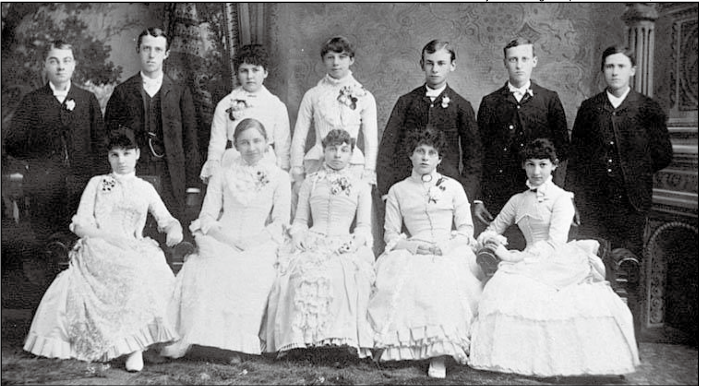
Figure 2. Seattle High School graduating class, June 4th, 1886