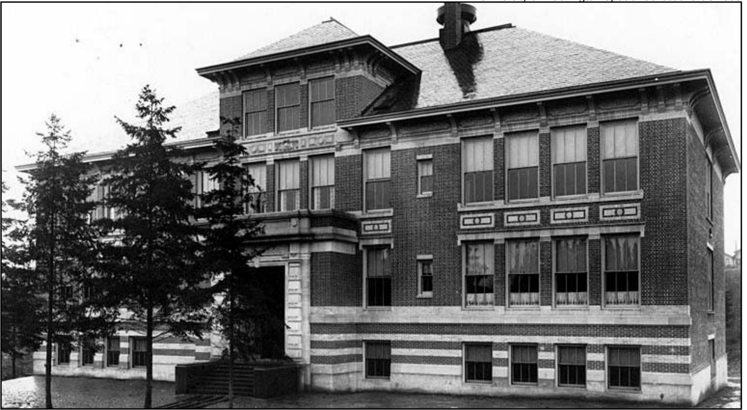
Figure 9. Ravenna School (Edgar Blair, 1911)