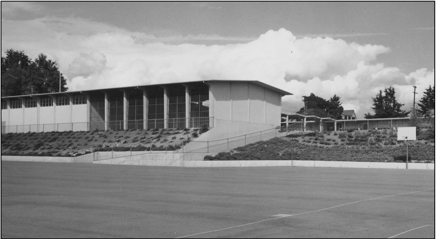
Figure 18. Cedar Park Elementary (1959, Paul Thiry, City of Seattle Landmark)