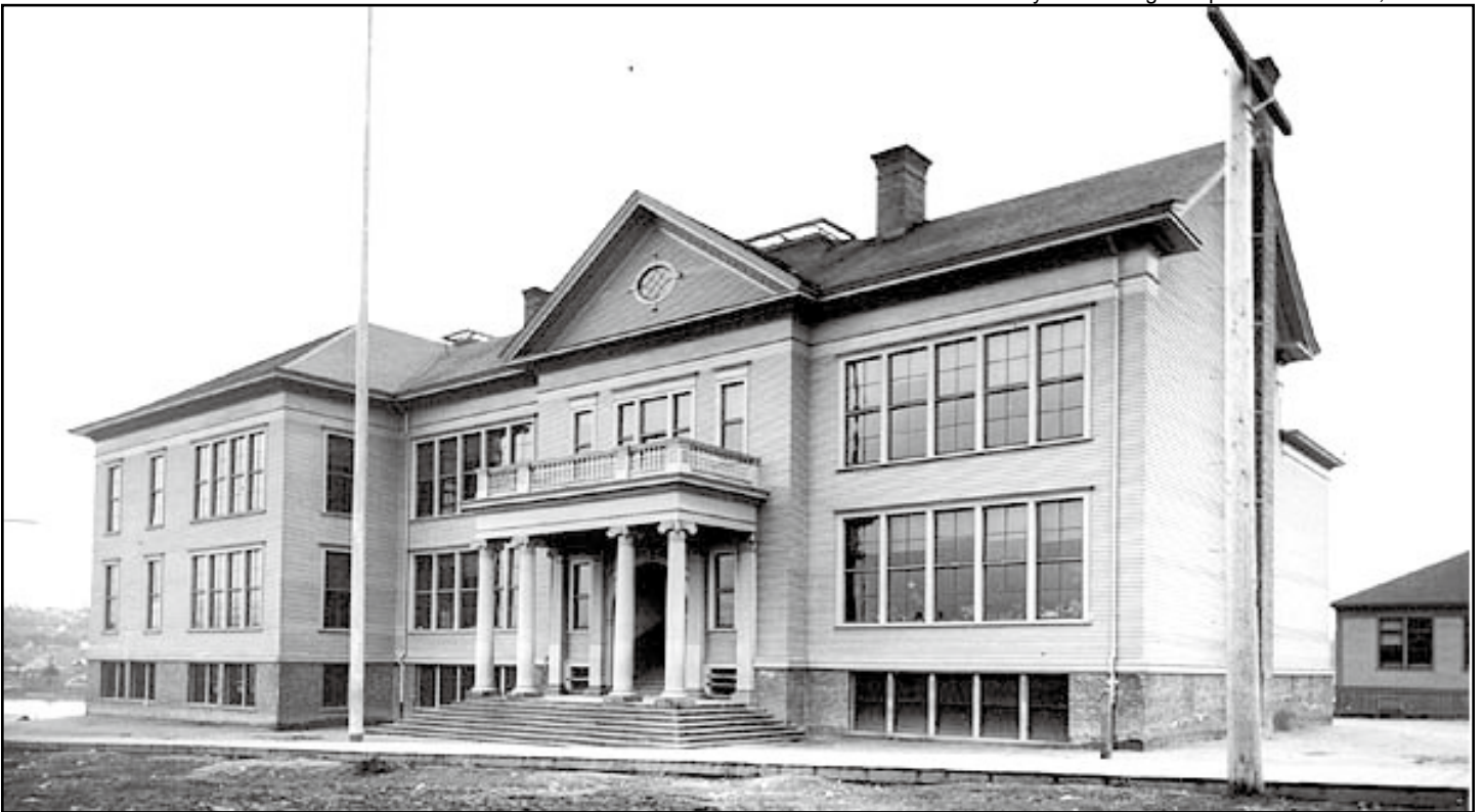
Figure 4. Green Lake School, 1902 (James Stephen, 1902)