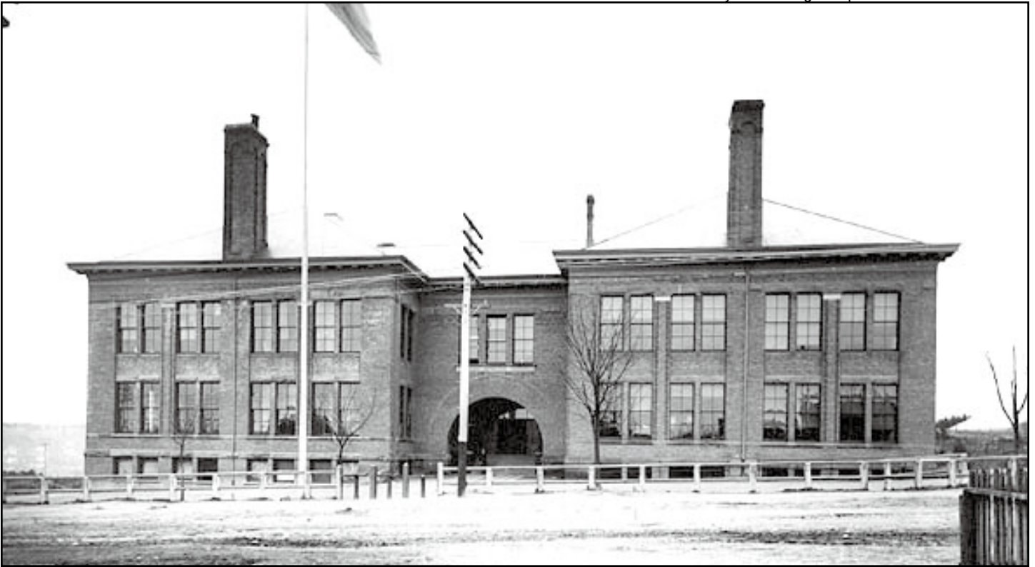
Figure 3. B.F. Day School (John Parkinson, 1892)