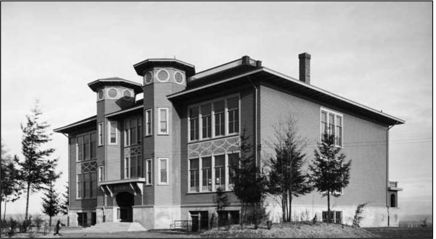
Figure 5. John B. Hay School (James Stephen, 1905, City of Seattle Landmark)