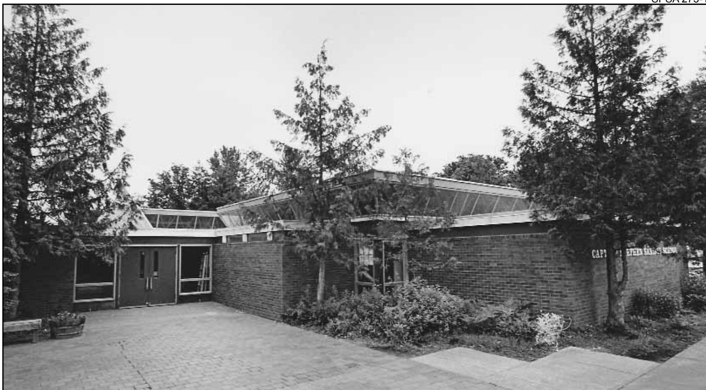
Figure 20. Captain Steven E. Sanislo School (Sullam, Smith & Associates, 1970)