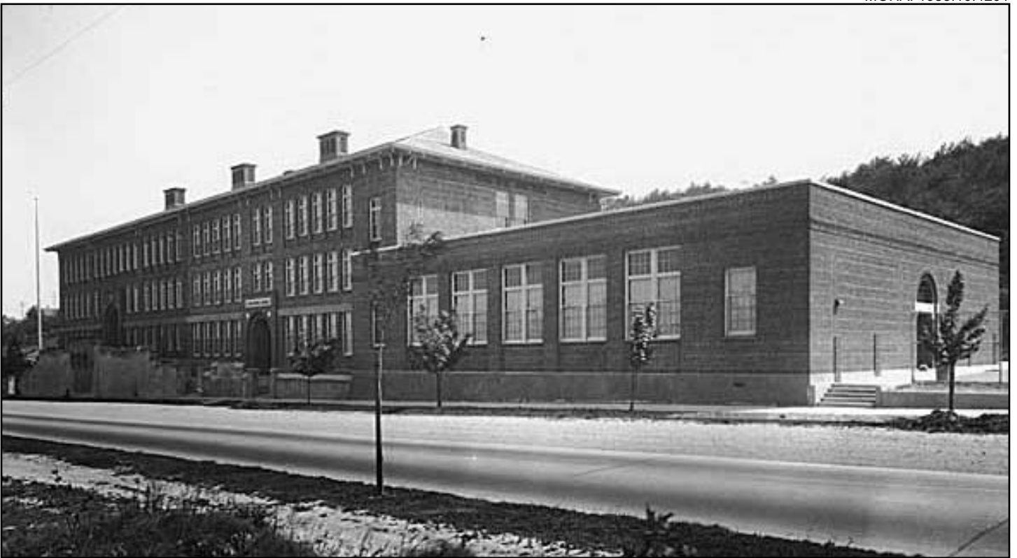
Figure 10. Frank B. Cooper School (Edgar Blair, 1917, City of Seattle Landmark)