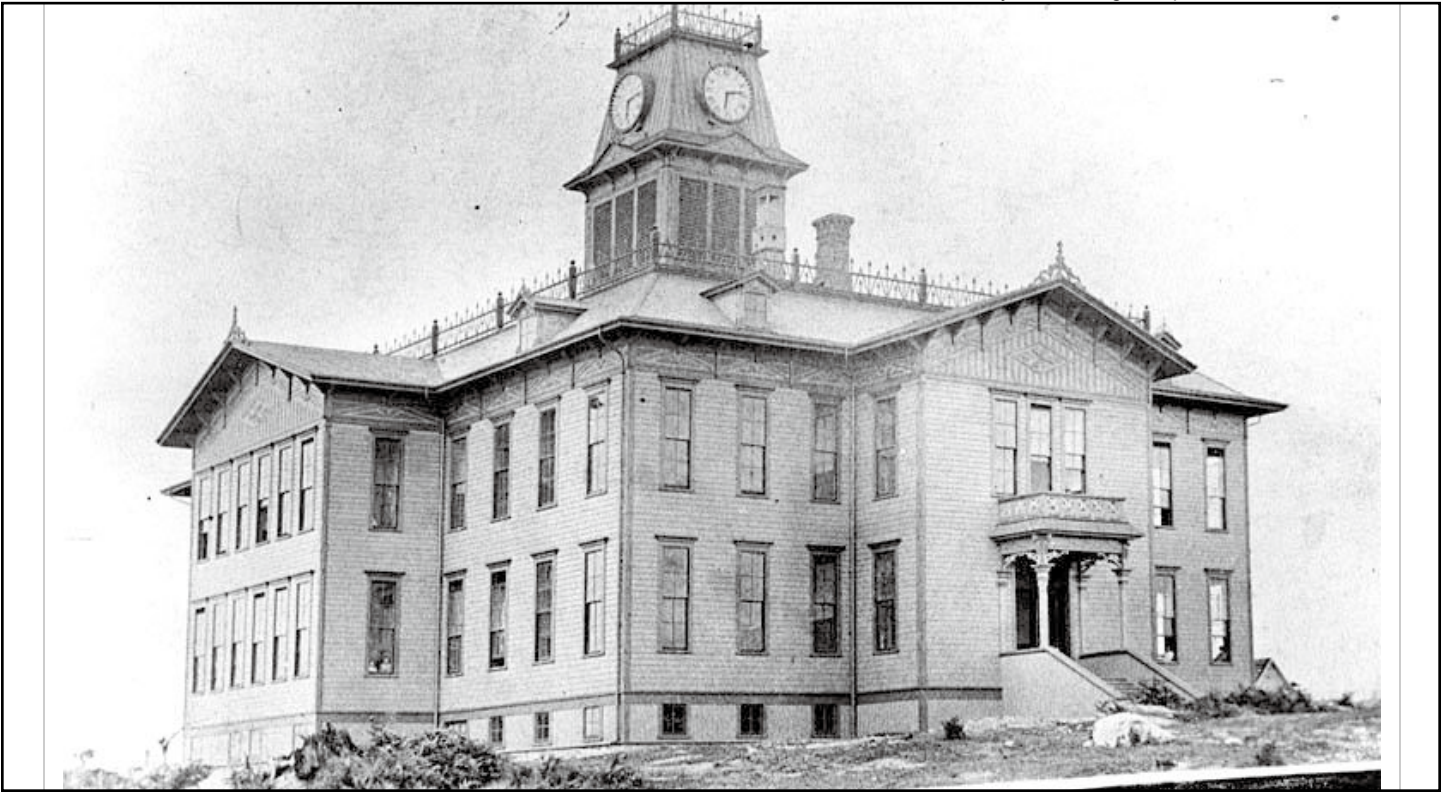
Figure 1. 6th street School, also named Central School, 1885 (1883-1888, destroyed by fire)