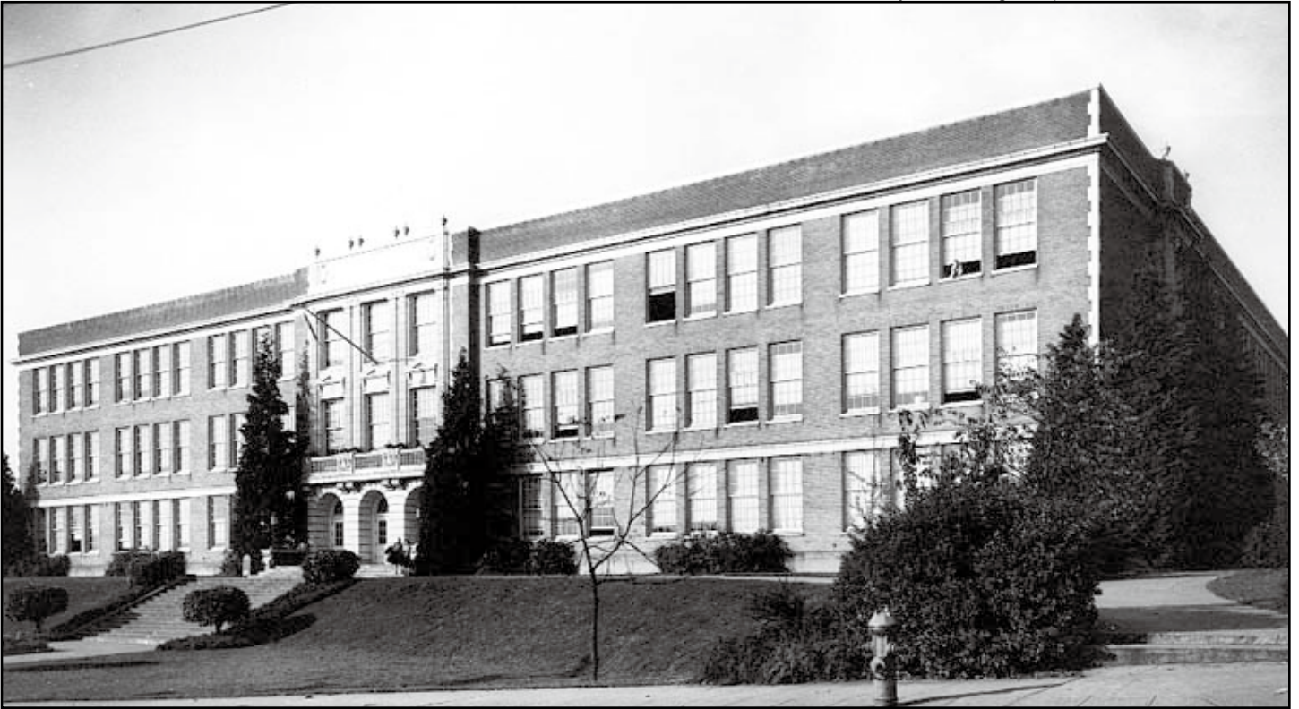
Figure 15. Roosevelt High School (Floyd A. Naramore, 1922, City of Seattle Landmark)