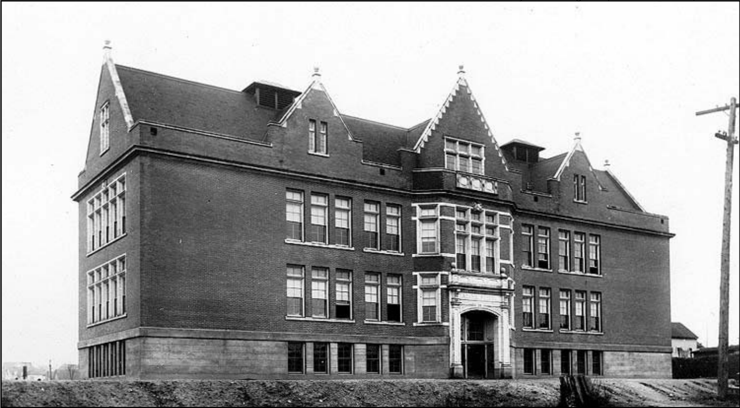
Figure 7. Adams School (James Stephen, 1901)