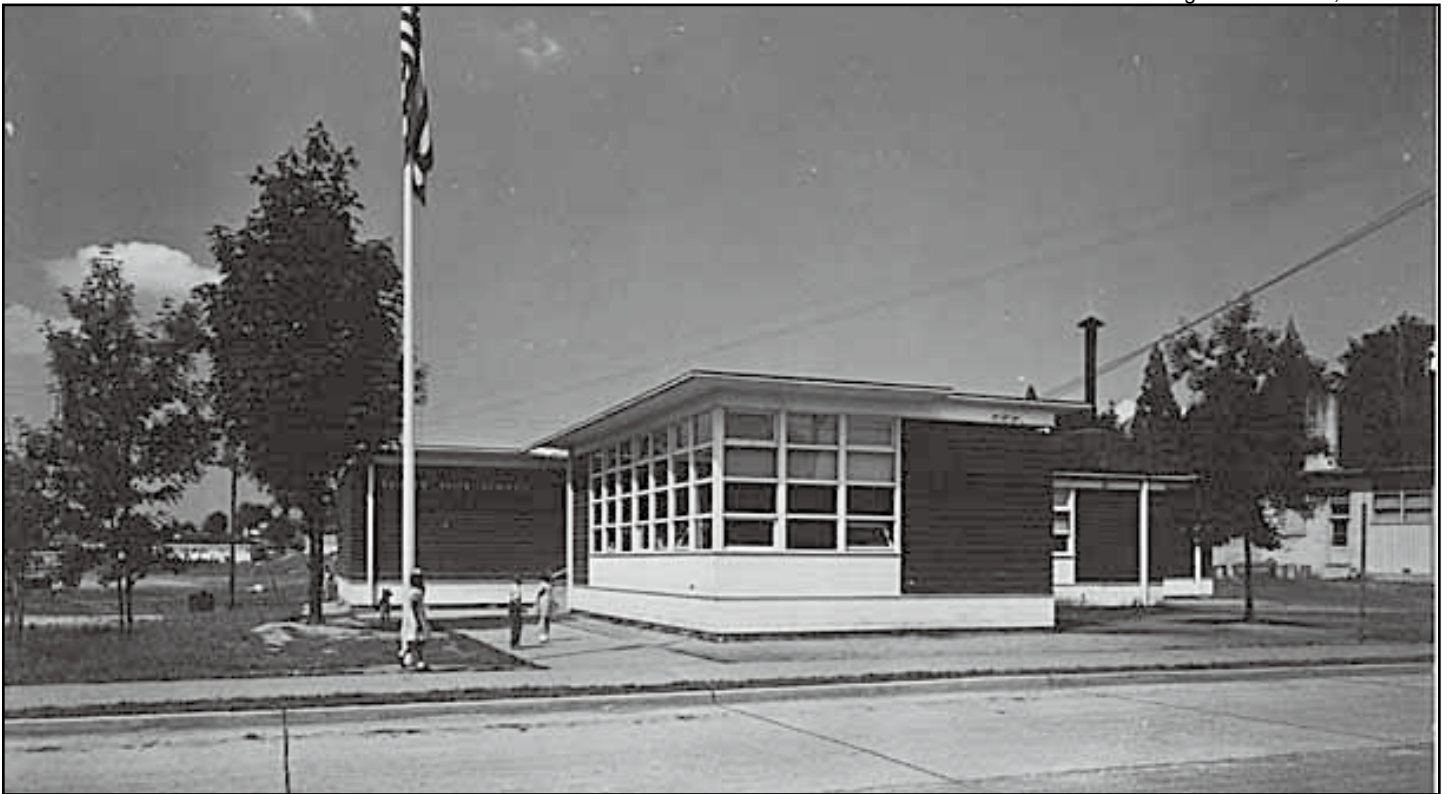
Figure 16. Rainier Vista School, Seattle (1943, J. Lister Holmes)