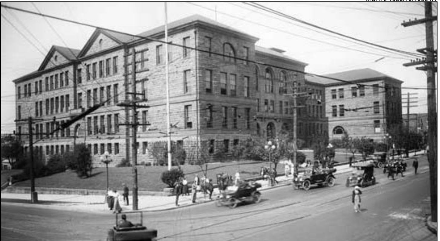
Figure 6. Central High School/Broadway High School (W.E. Boone & J.M. Corner, 1902)