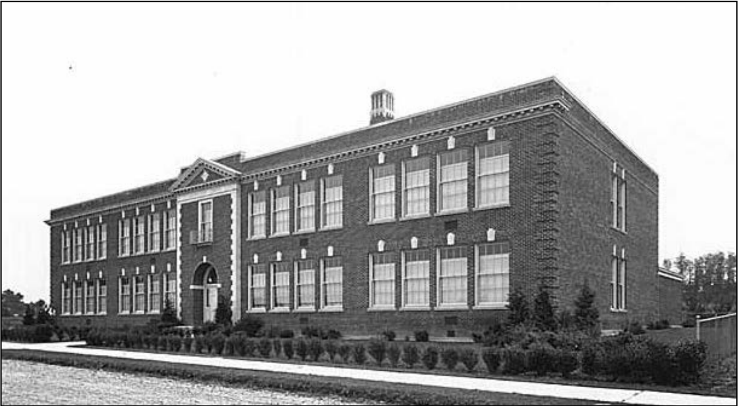
Figure 13. Laurelhurst School (Floyd A. Naramore, 1928)