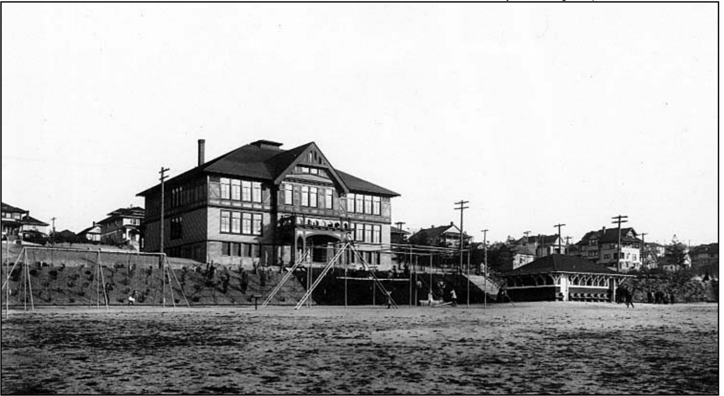
Figure 11. Seward School (Edgar Blair 1917)