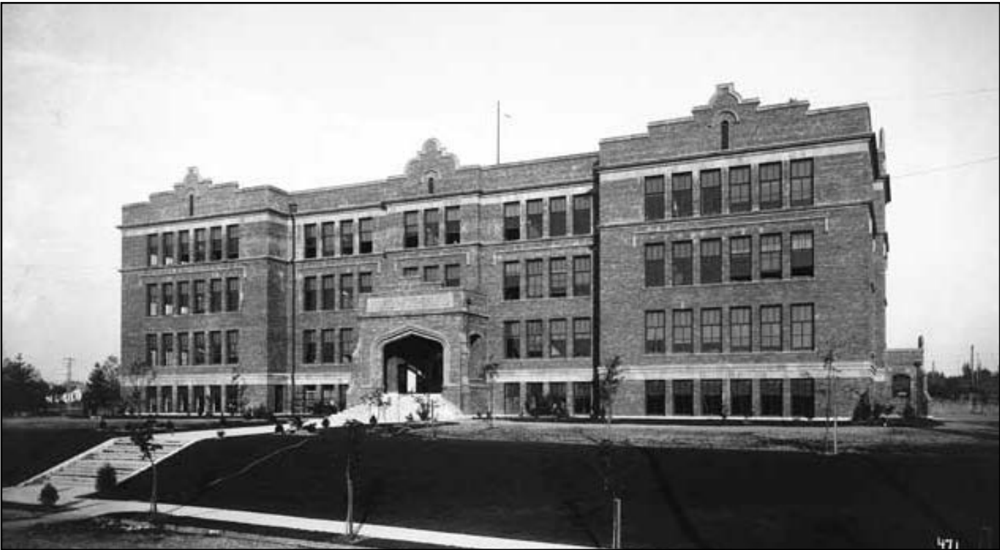
Figure 8. Lincoln High School (James Stephen, 1907)