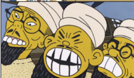
Not Pearl Harbor , Roger Shimomura a painting created by the artist after September 11, 2001.