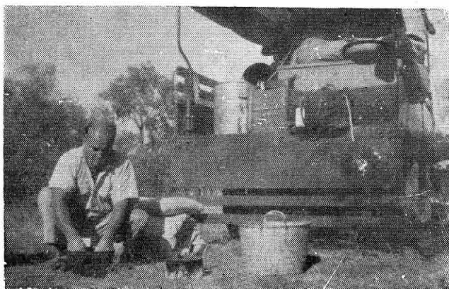
Left: Mr. Stretton making bread "out on the track" on a dry season itinerary.

Just here there is over a square mile of grass as green and as extensive as anything we have seen so far in this unusual country of chain-lagoon, giant trees and dense bush. Away where the green ends, there is the blue of the lagoon's water, and beyond that the fringe of the tropical bush. There is a cloudless sky, the warmth of the sun and the wind's steady breeze on a mid-winter's day. The washing is on the line (bachelor style) and there are four loaves of bread in the camp oven. What more could you want? We haven't any 'modern cons.' but the life of an itinerant missionary is wonderful. Now we must prepare for the meeting tonight when we tell of Christ.