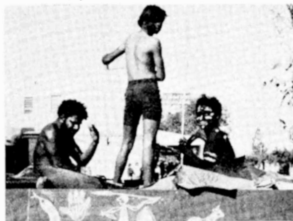
Below: A scene of the early days