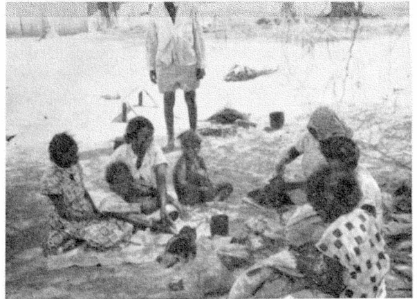
Tea-time on the C.S.I.R.O. farm at Katherine in the Northern Territory—a very important time for all