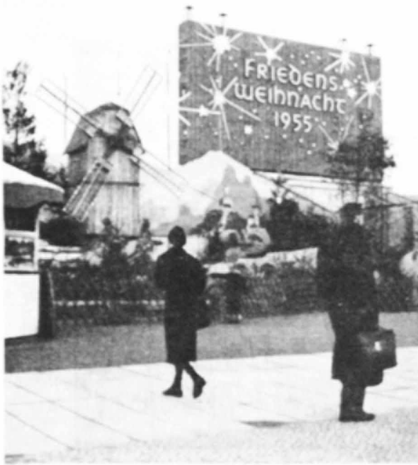
Christmas in Europe

They both feel deeply grateful for the education and spiritual training they received at the Singleton College.