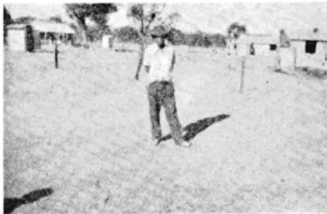
Does anyone recognise this young man ?