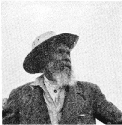
One of our real oldtimers.