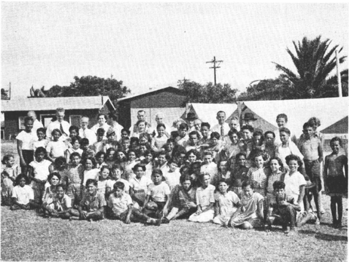
A group picture showing all the Summer Camp youngsters, the members of the Board and the staff (in the background). These children who come to Sydney once a year and are entertained have the opportunity of learning all manner of things and invariably they return to their country homes much wiser.