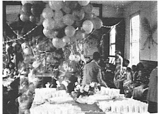
Wallaga Lake is gaining quite a reputation for the splendid parties it puts on for its residents at Xmas and other important occasions. This is how they decorate the Recreation Hall.