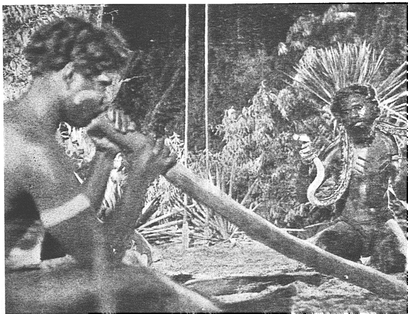
Jedda is fascinated, yet she tries to resist Marbuck. Soon all the station lubras are talking about how Marbuck puts himself in Jedda's way all the time. Marbuck one night sings Jedda to him and she is unable to resist his sorcery. She comes to his campfire.

~~~~~ ← Her mental confusion receives a severe jolt when a wild black joins the station natives returning home from walkabout. Called Marbuck (Robert Tudawali), he is a good hunter. McMann hires him and as soon as Marbuck sees Jedda he wants her. ~~~~~