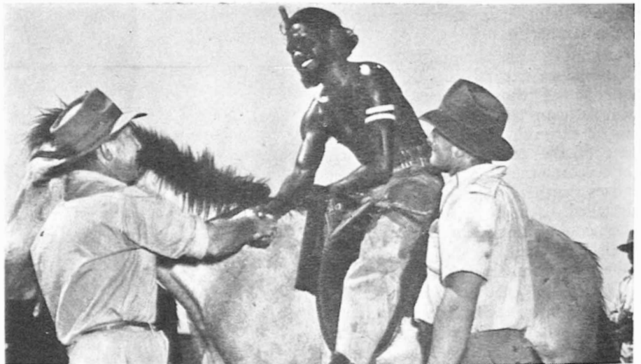
Director Charles Chauvel congratulates Bob Tudawali (they know him in Darwin as Bob Wilson) for a fine piece of horsemanship in one of the scenes for "Jedda." Bob is a Melville Islander.