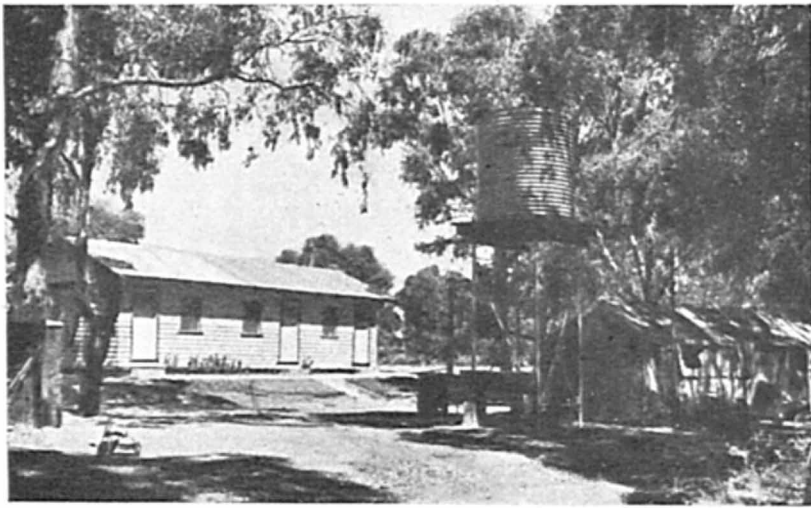
A good view of the "Centre" Project showing main building, bathroom (at left), water tower, tank, copper, wash troughs, all put in by the "Centre" committee. Note the contrast of old and new, and the electric light on building.