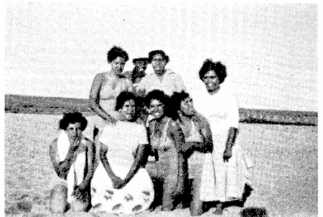
A happy group of Cootamundra girls on the beach at Collaroy. Yes, it WAS last summer.