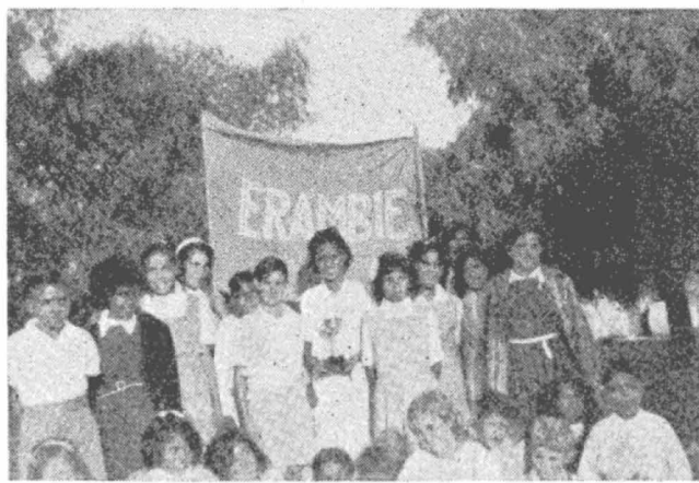
The Erambie School youngsters are seen here with the Cup they won at last year's sports.