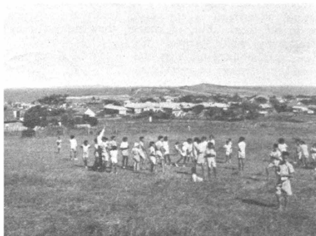
100 children from the far distant parts of N.S.W. have had the time of their lives at the Summer Camp at Collaroy.