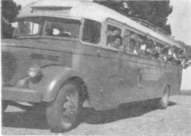
A busload of happy Cootamundra girls on their way to school.

One of the highlights of their reunion was a visit to the Board Office and a picnic in the Botanic Gardens.