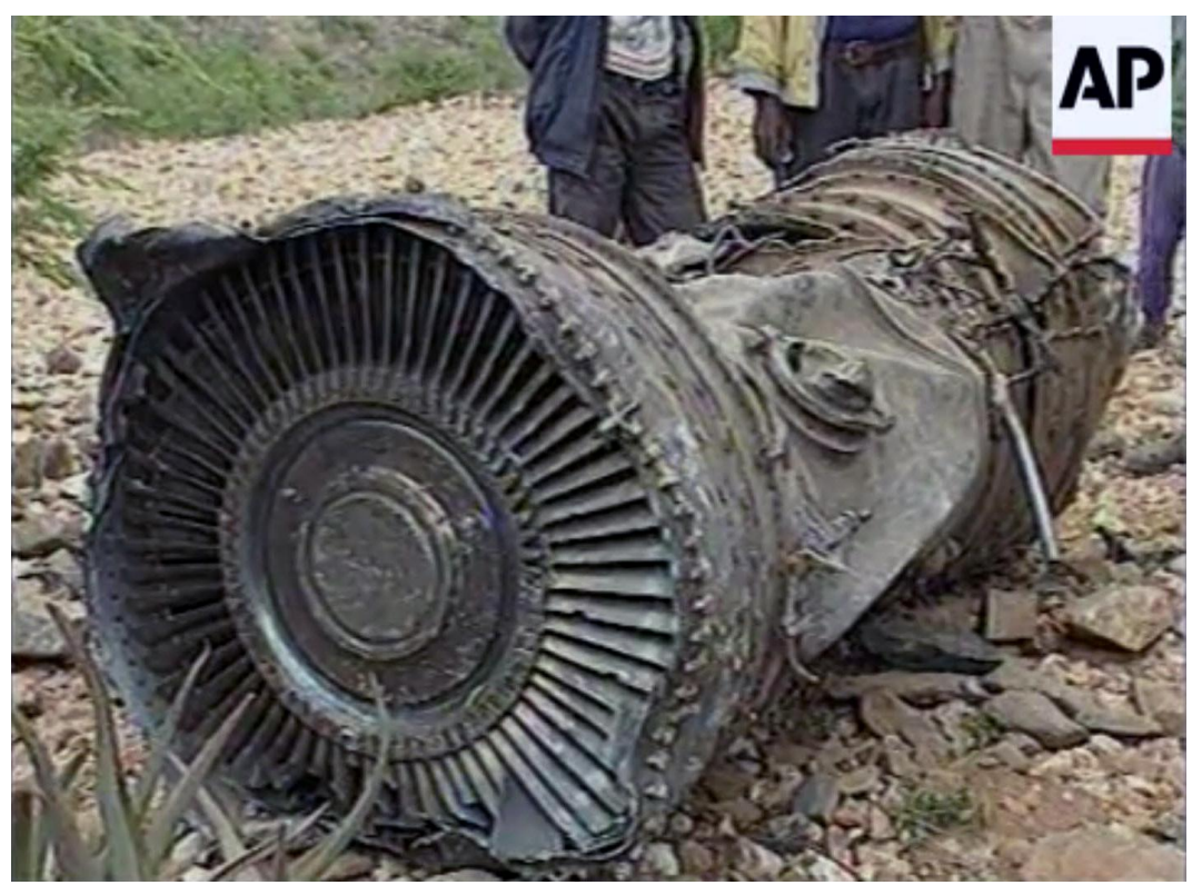
Kids Debris Fields 2 Lone and cold engine and seemingly with perfect sitting posture on the ground.