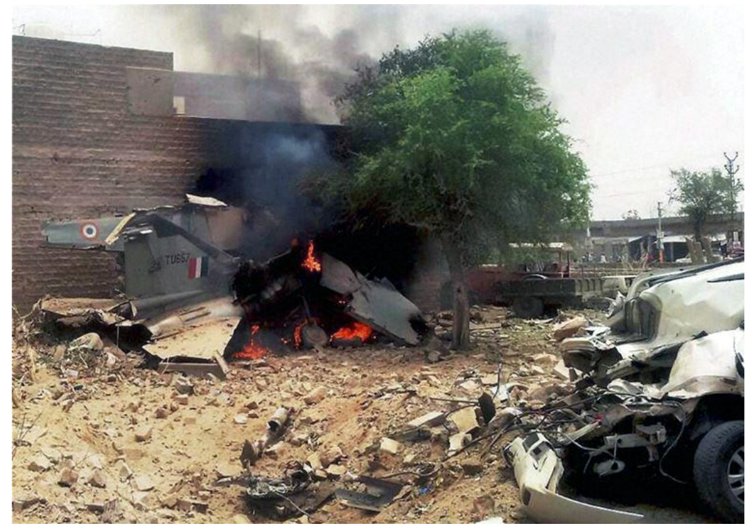
Real Time Debris Field 6