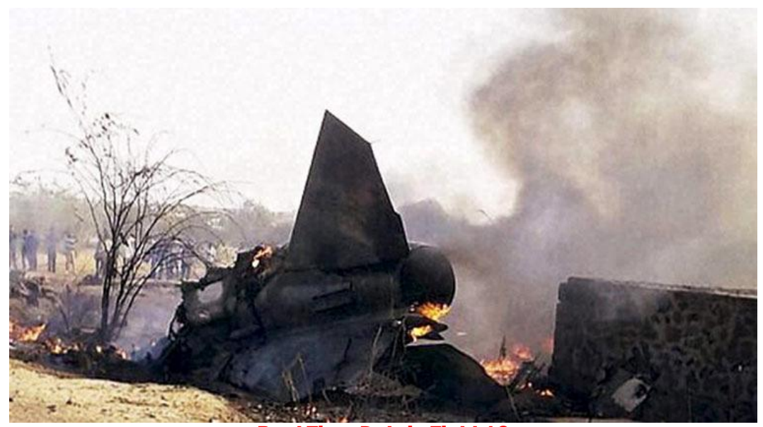
Real Time Debris Field 12