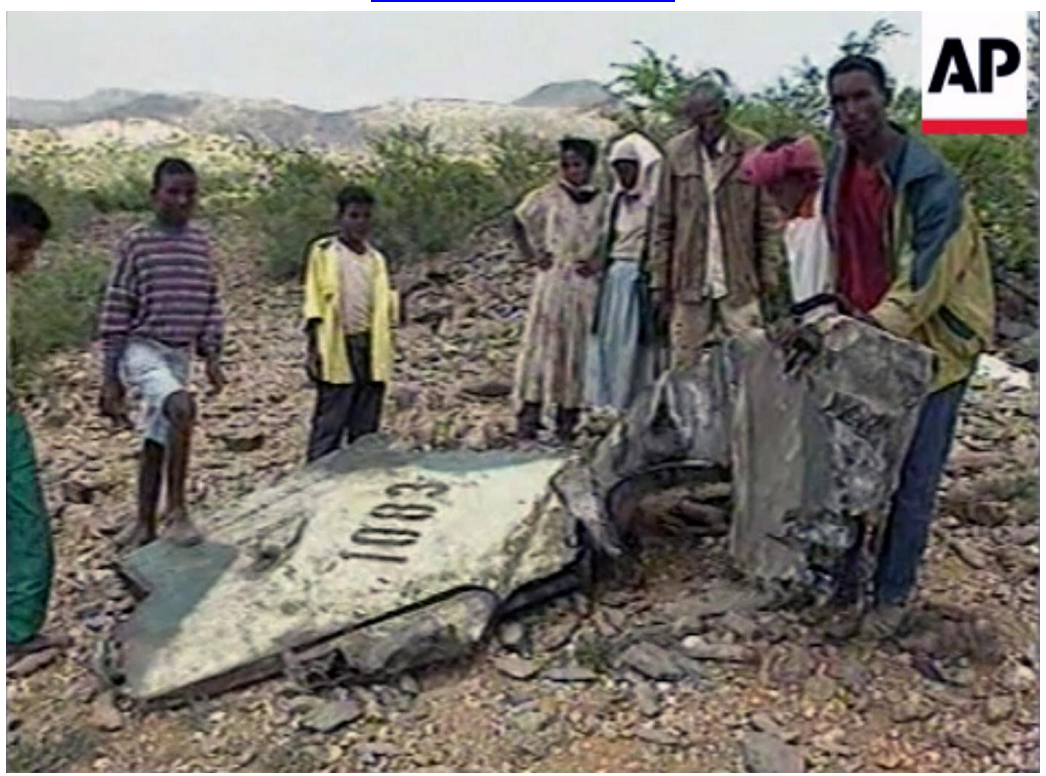
Kids Debris Fields 1 Fake ID number glued on the junk.