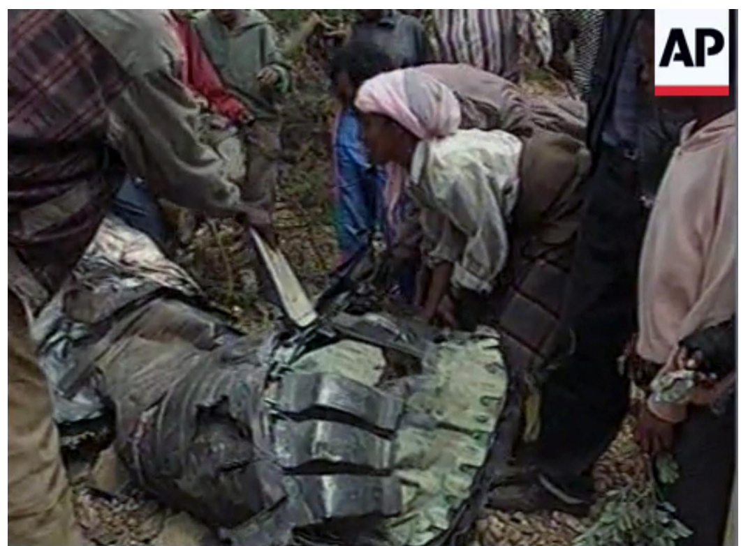
Kids Debris Fields 3 The kids and their kits are details of a novel

No photo of Real Time Debris Fields has kids playing with debris of a downed jet fighter. Why the Eritrean government gave the kids the debris of "the downed MiG" for toys? It is weird scenario. And it shows how stupid Mr. Isayas is. Any debris field, fresh or non-fresh should be secured by authority to protect the public from any safety hazard including unexploded bombs. This is a standard procedure followed by all governments in this planet.