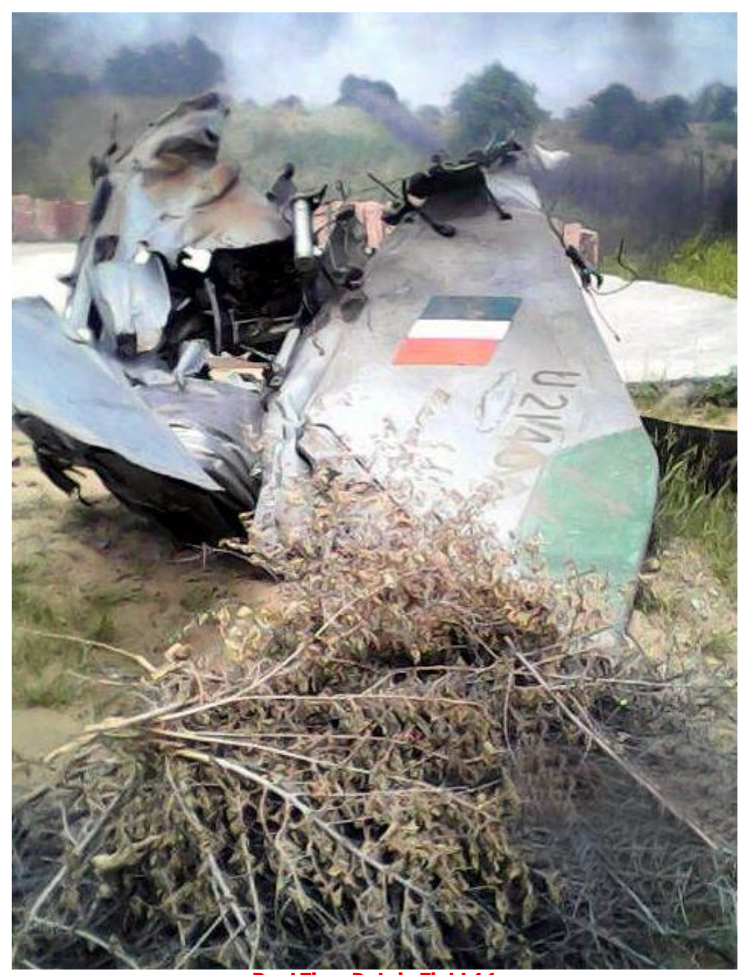
Real Time Debris Field 11