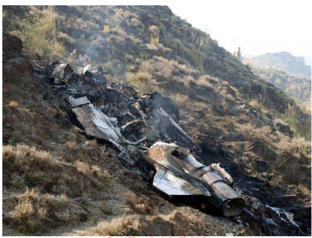
Real Time Debris Field 5