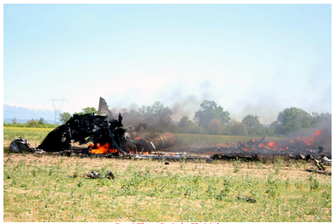
Real Time Debris Field 4