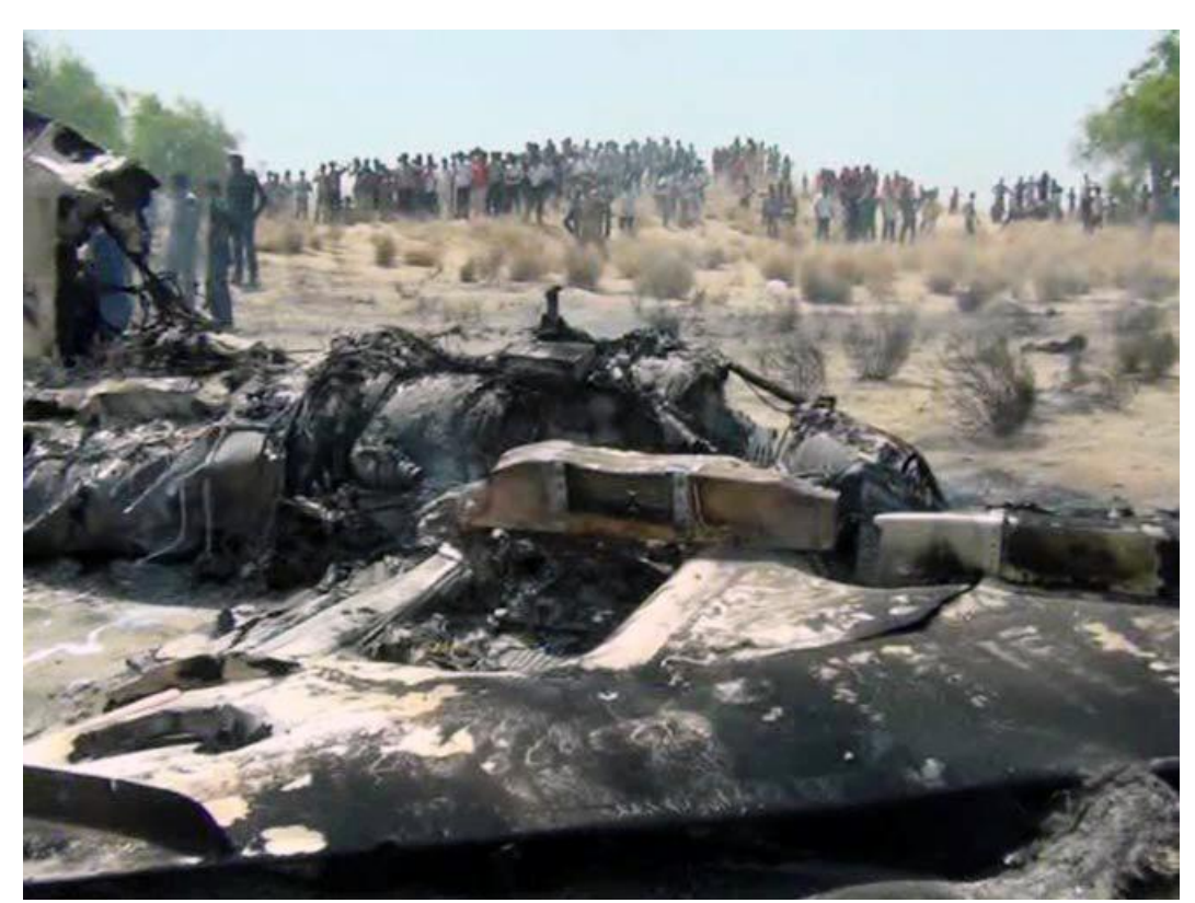
Real Time Debris Field 8