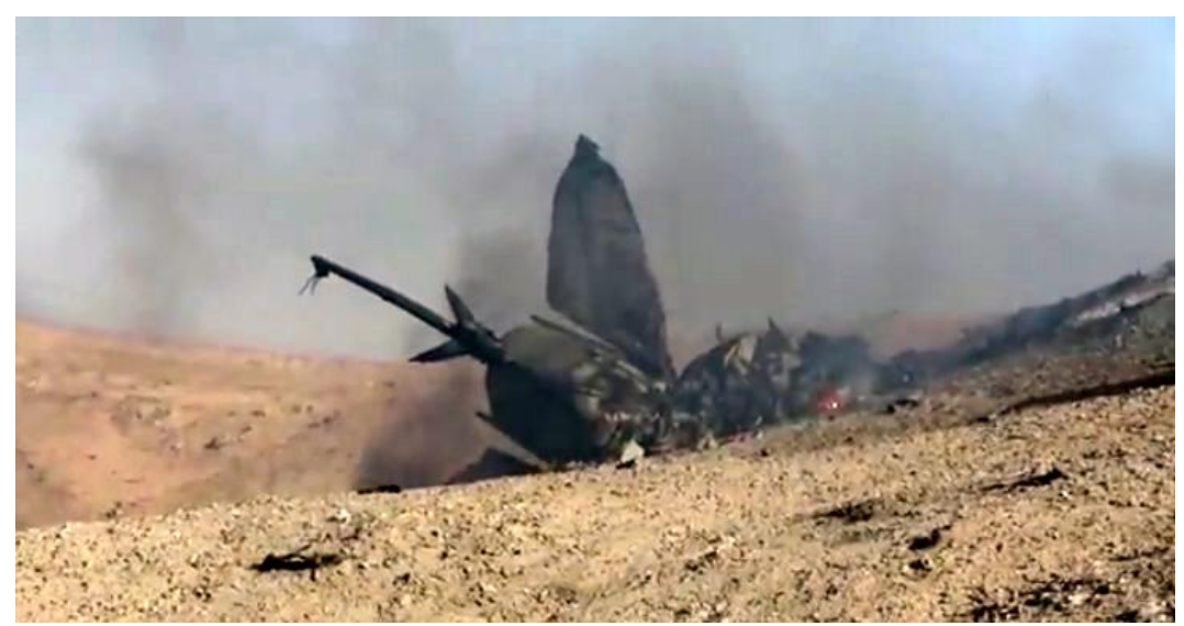
Real Time Debris Field 14