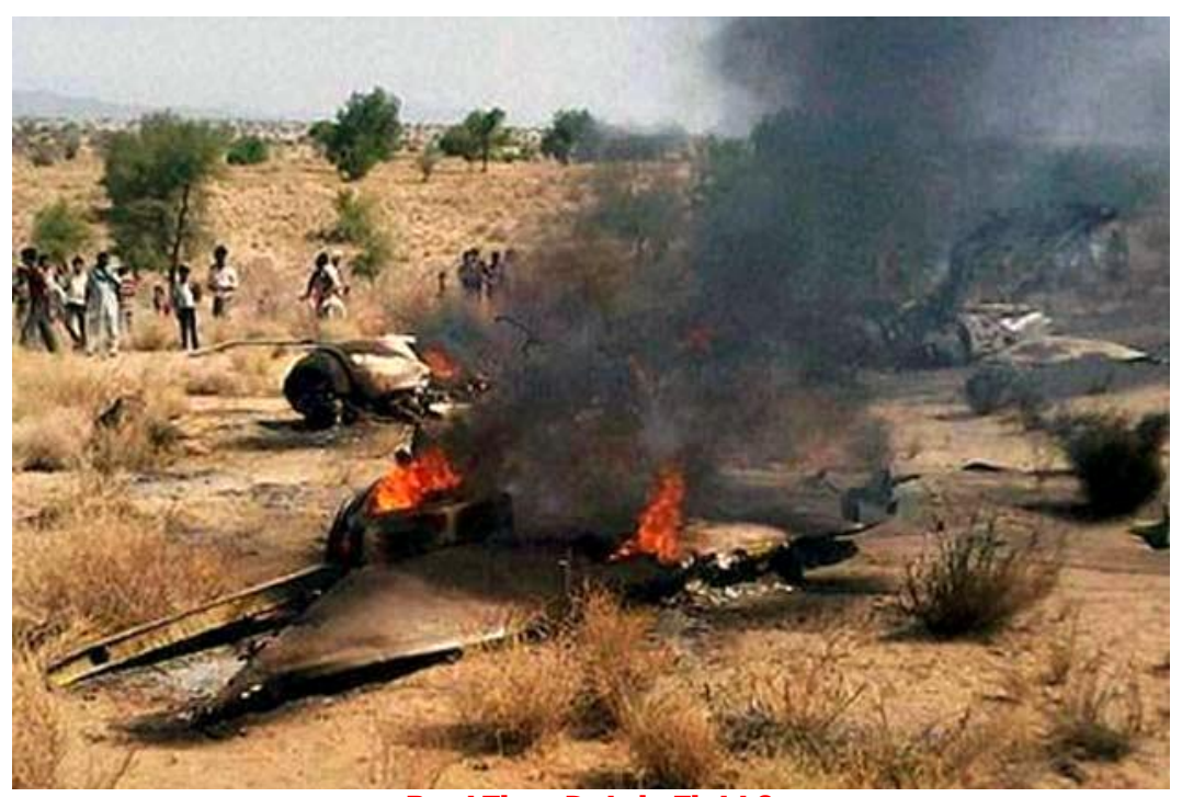
Real Time Debris Field 9