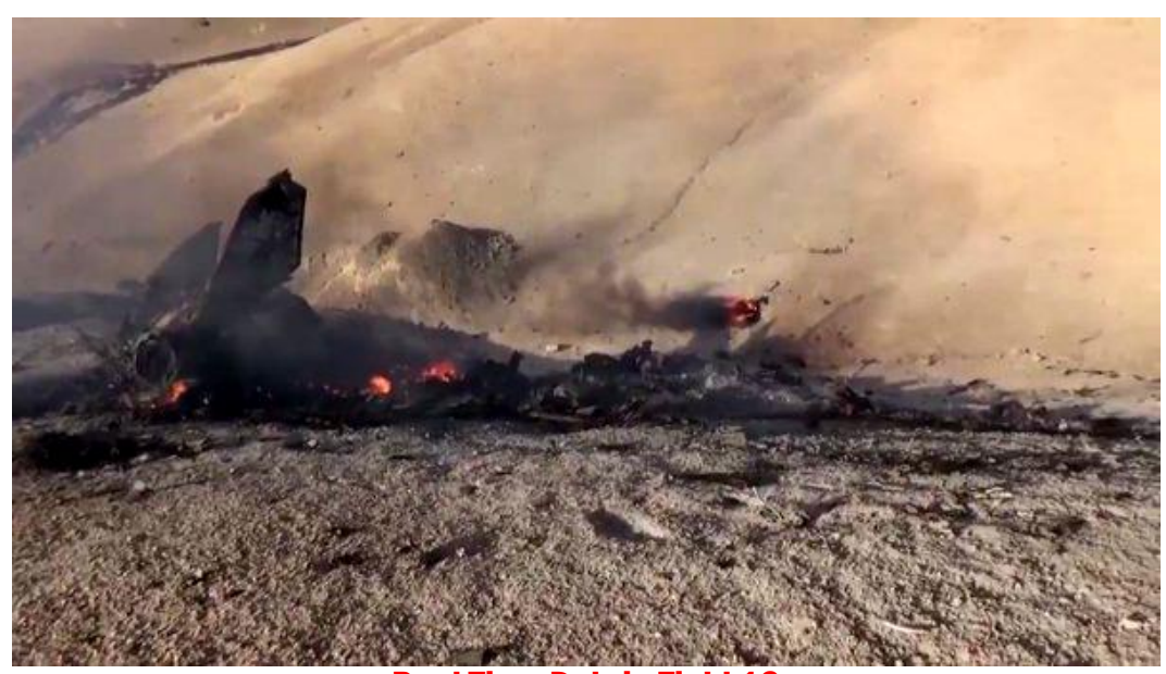
Real Time Debris Field 13