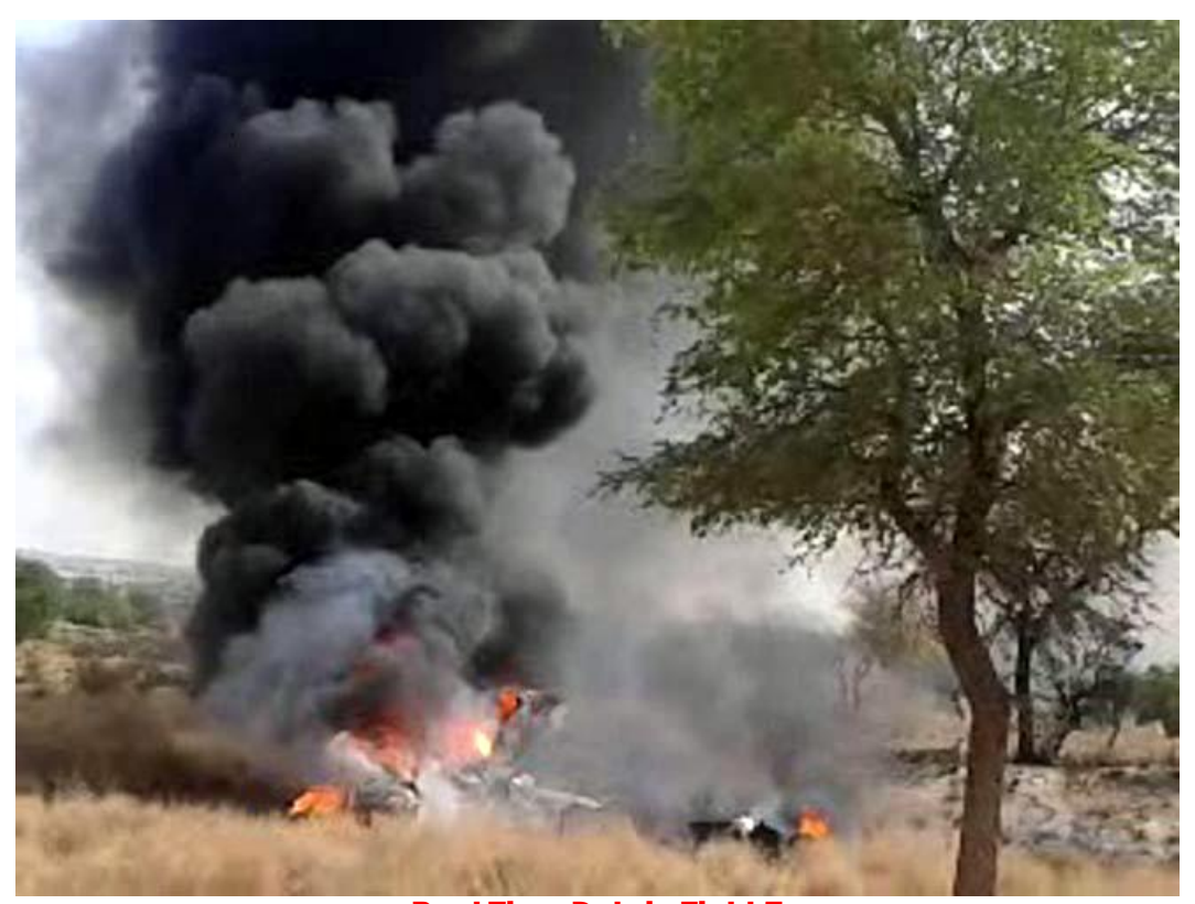
Real Time Debris Field 7