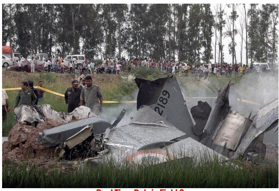
Real Time Debris Field 3