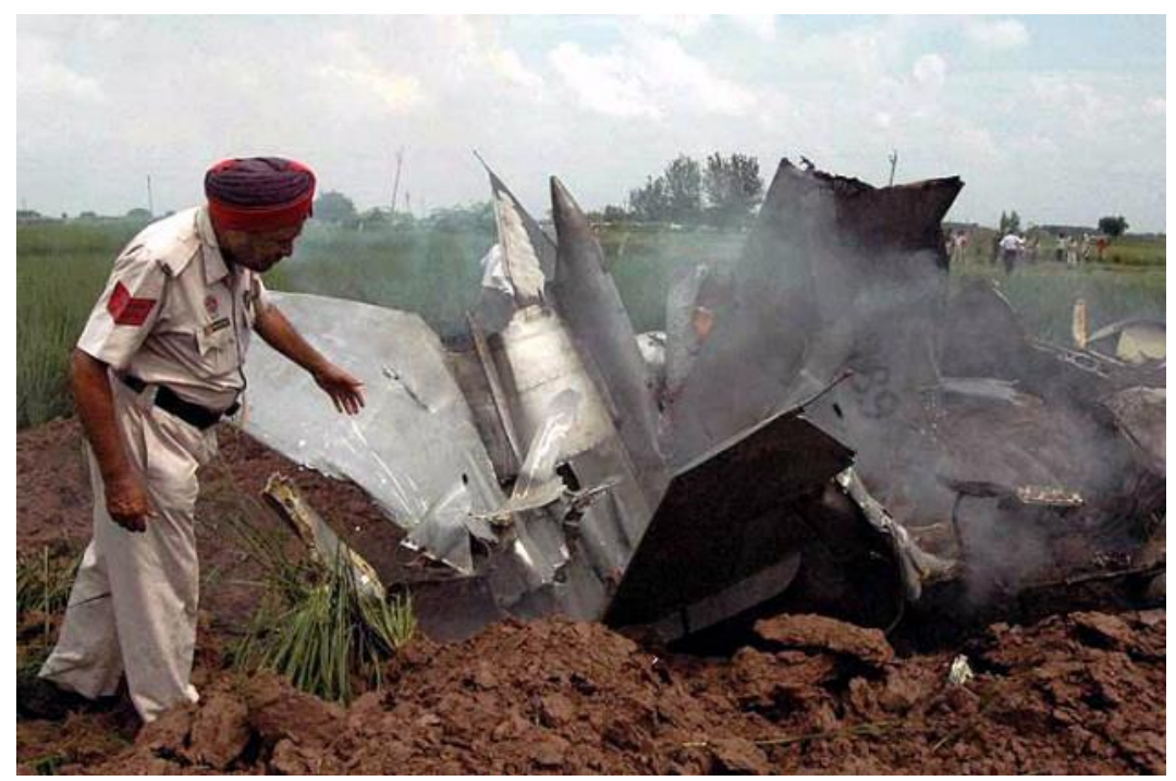
Real Time Debris Field 2