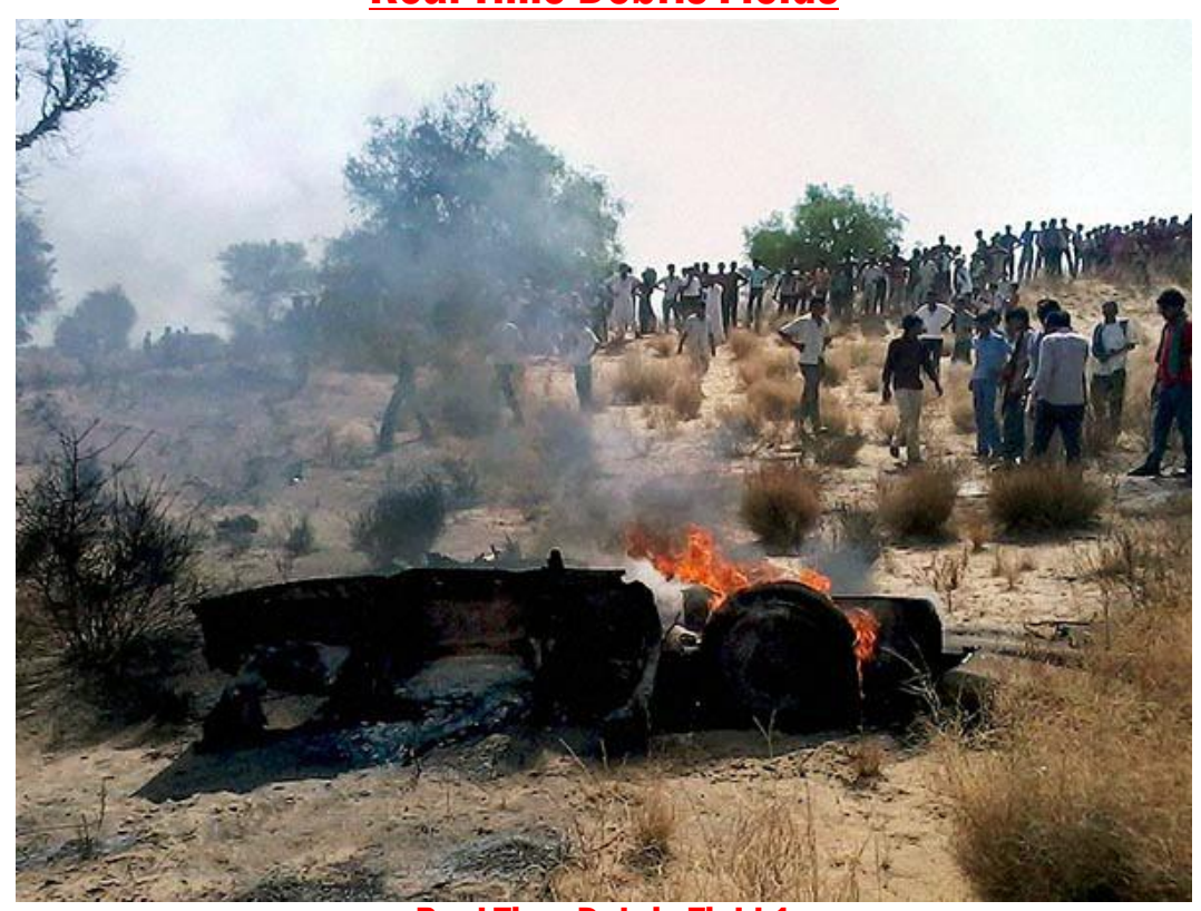
Real Time Debris Field 1