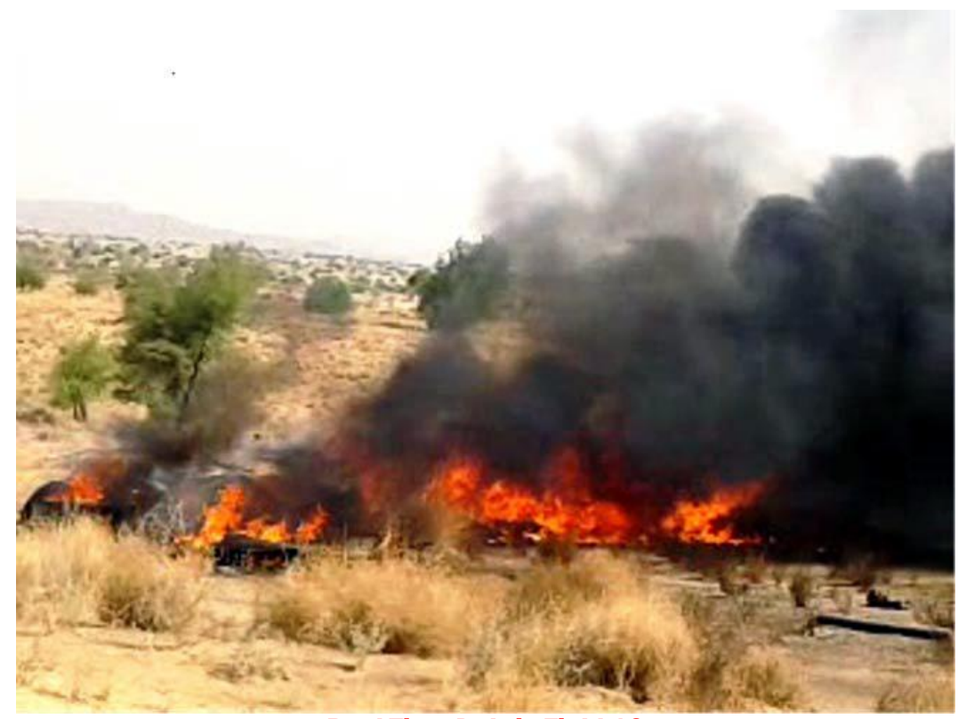
Real Time Debris Field 10