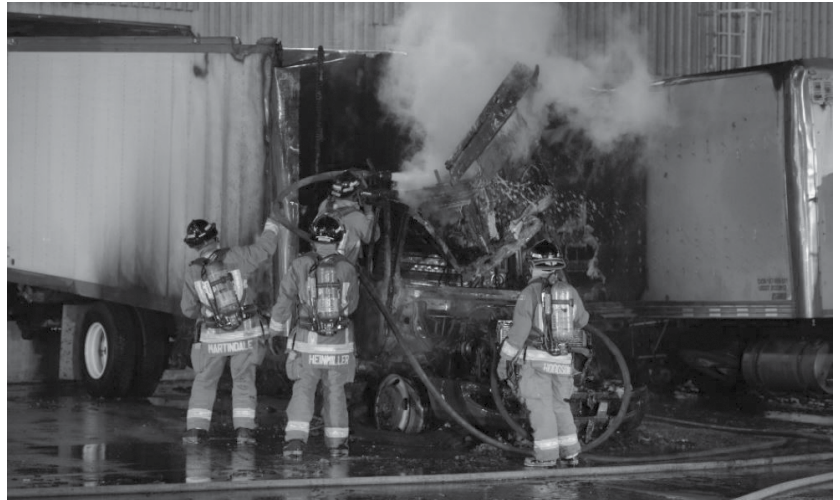
June 7, 2015, the ALF planted incendiary devices under trucks belonging to Harlan Laboratories

This recent string of actions began on May 30 with a late-night raid of Glenwood Fur Farm in St. Marys. According to media, animals in two sheds were liberated,