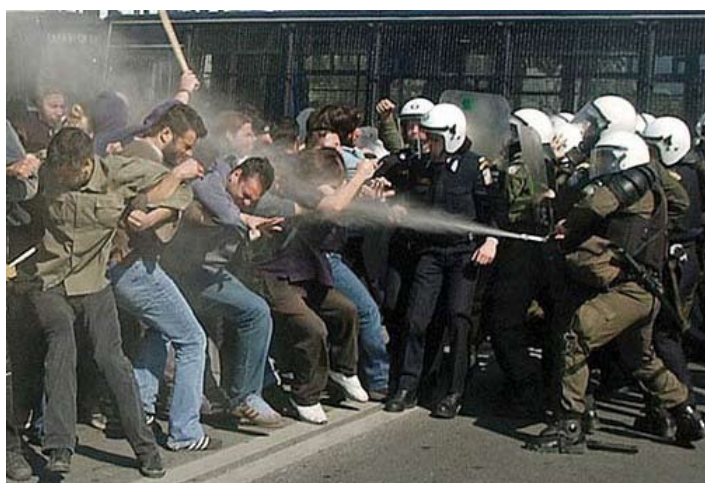
Photo: Police attack protesters with watercannons, Tehran

This ideological radicalisation was also reflected in how people protested; what started as silent protests in June, had by Ashura (In November) turned into pitched street battles between ordinary unarmed people and the state’s security forces and footage started pouring out of Iran of ordinary people capturing police outposts.