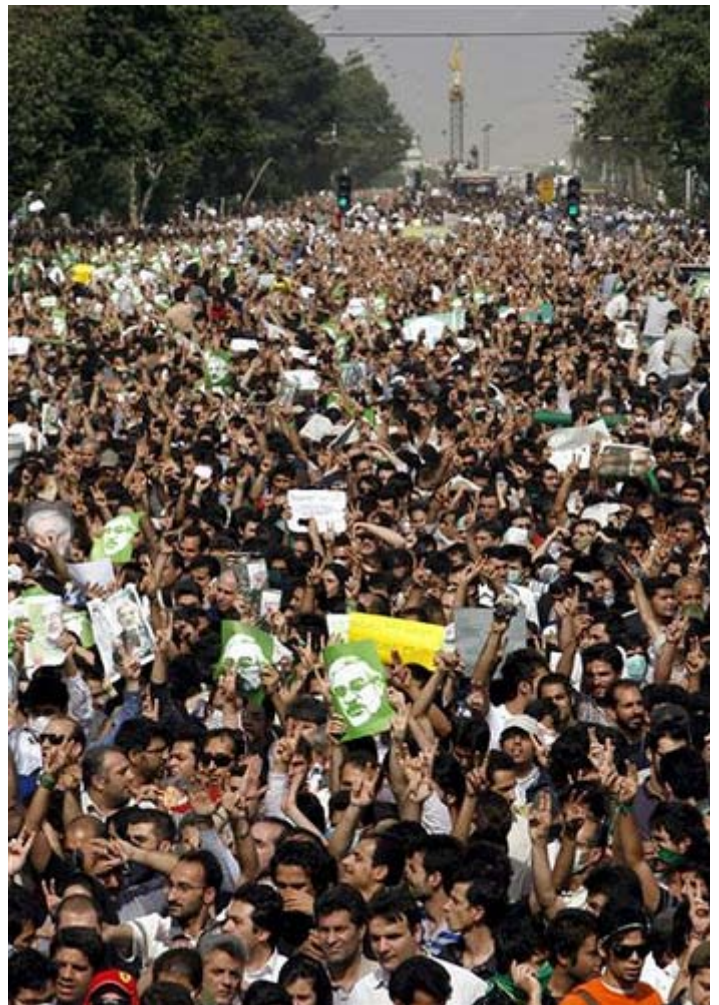
Photo: Protest rally in Tehran, 15 July 2009

This state of affairs has lead many people to conclude that people like Mousavi remain the undisputed leader of this recent protest movement and that his ideas are taken up uncritically by people who participate in the actions. This is only true in the sense that there are no other organised alternatives. Iran Solidarity has