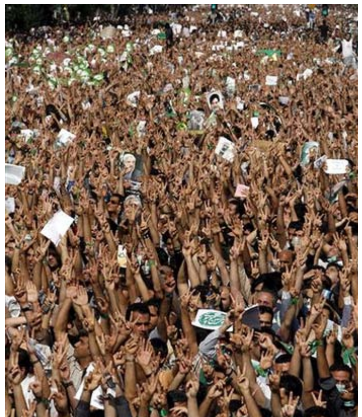
Photo: Rally in Tehran, 15 July 2009

This movement which is the most significant and persistent show of opposition and protest movement in Iran since 1979. It seemingly sprung out of nowhere on the morning after the elections and built its momentum on the back of a series of spontaneous street protests in which an unknown number of people were gunned down and killed and hundreds were beaten up or arrested. Armed with cheap camera phones and with the help of the global and foreign based Iranian media outlets and the internet, activists turned citizen journalists, succeeded in turning the Iranian uprising into the hottest news item in the world and for a short period, their stories along with all their gory details took over the front pages of the world's most prominent newspapers. However, the movement has actually been the climax of years of discontent and smaller scale struggles by workers, women, students, journalists and minority groups and that it does not begin and end with the issue of the elections.