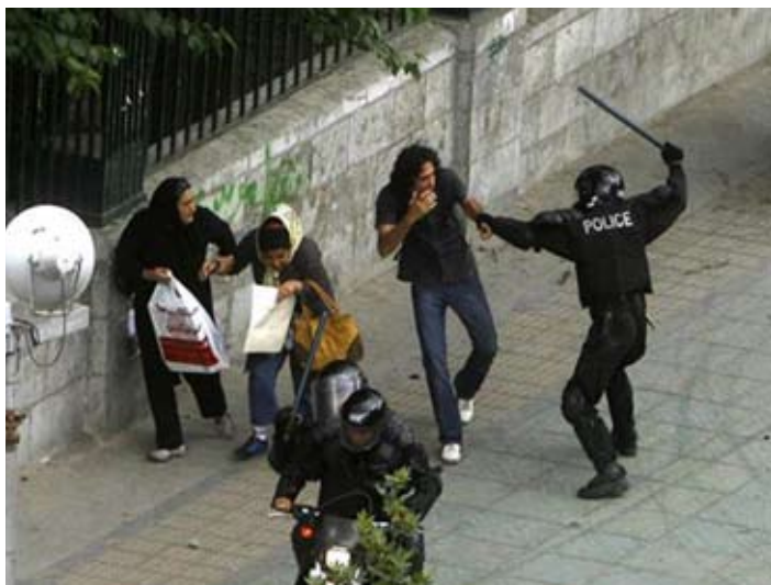
Photo: Police attack unarmed civilians in Tehran, 14 June 2009

observed that certain groups supportive of Mousavi and certain reformist politicians have attempted to silence or sideline other activists. This played out in Melbourne at a recent rally where the United for Iran campaign group attempted to stop Iran Solidarity from marching. Iran Solidarity has heard of similar tactics being used within Iran. For example, Students for Equality and Freedom (rough translation) who are an independent activist group that formed in Tehran University during Ahmadinejad's first term, are harassed by certain organisers of the green movement and told to not bring their own materials to the central protests, such as placards. But the reality is that increasing layers of people are no longer ideologically committed to the politics of Mousavi or even believe the Islamic Republic is reformable.