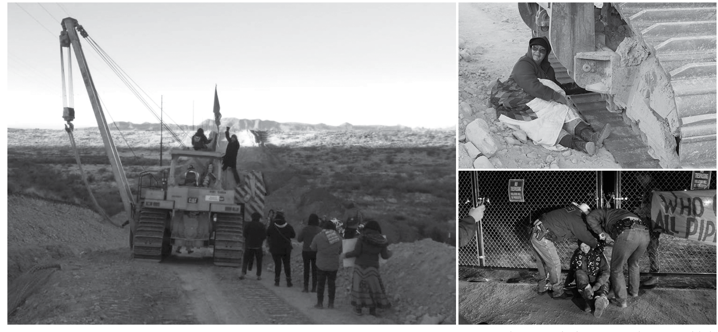
IN THIS NEWSLETTER:

ON THE FRONTLINES OF ECOLOGICAL RESISTANCE