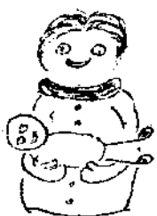
Baby with no clothes "Mother has warm"