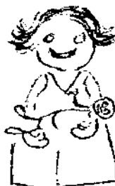
Baby with only pants on.