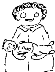
Mother and Baby both with warm clothes.