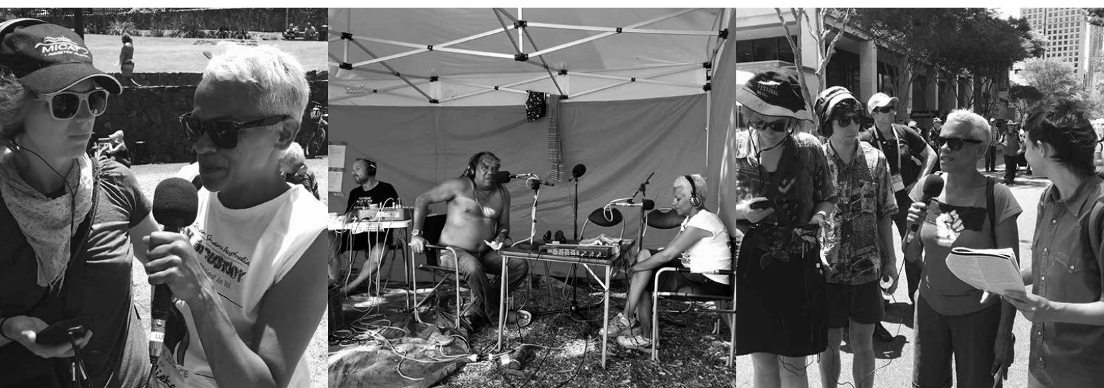
3CR programmers at the G20 protests

www.3cr.org.au/episode/3cr-out-force-g20