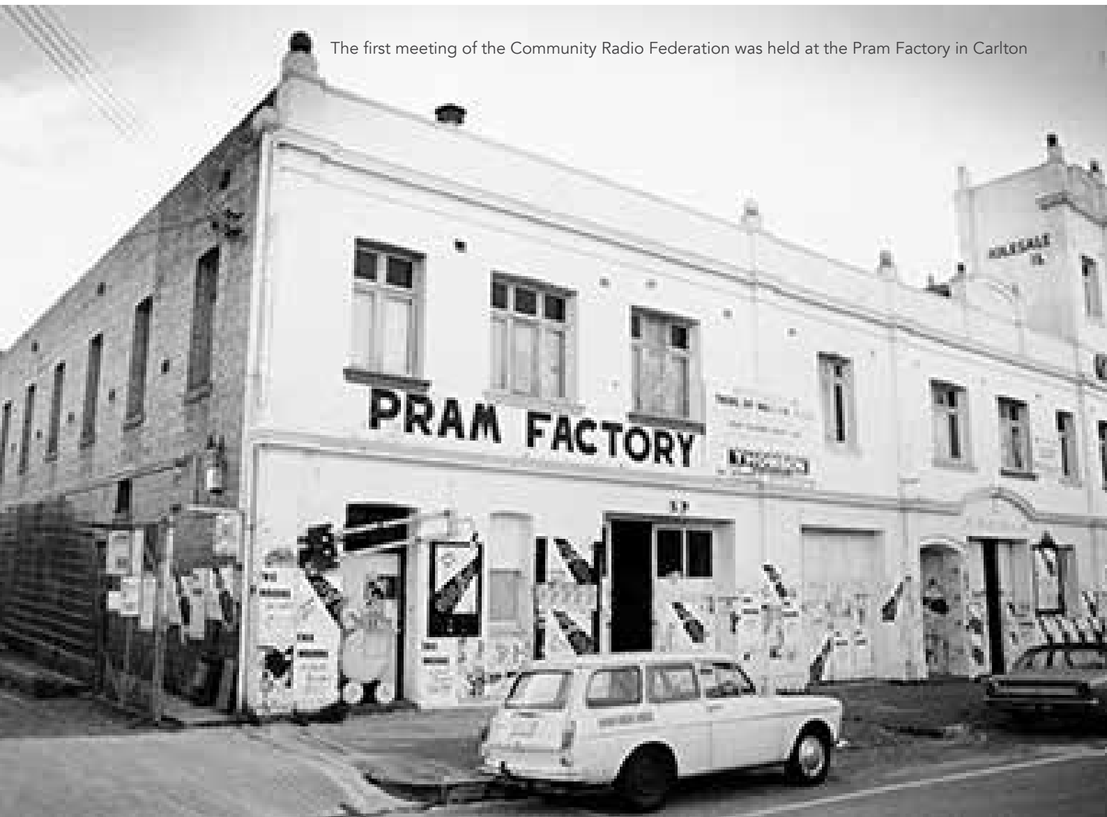
The first meeting of the Community Radio Federation was held at the Pram Factory in Carlton