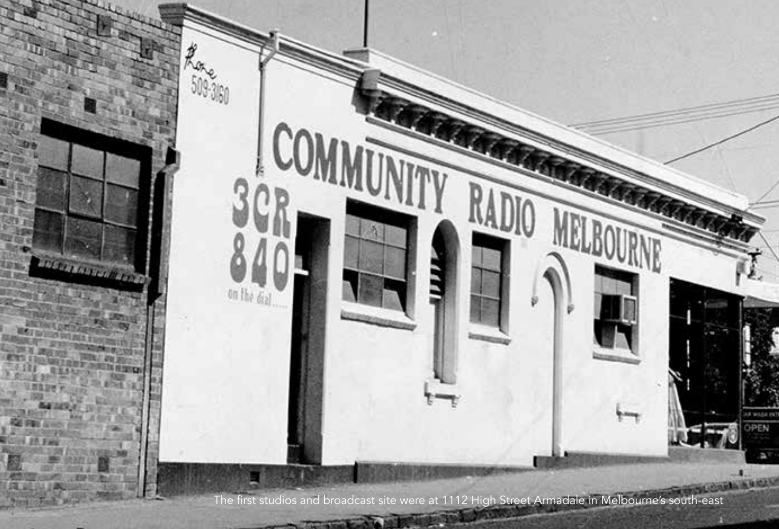
The first studios and broadcast site were at 1112 High Street Armadale in Melbourne's south-east