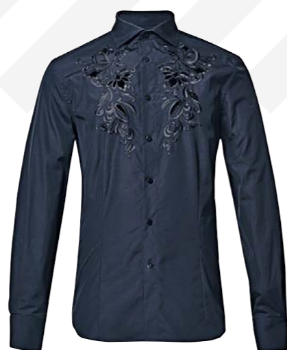
■ Ermanno Scervino