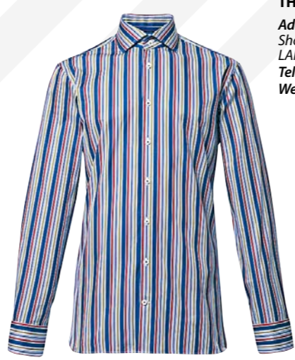
■ Van Laack