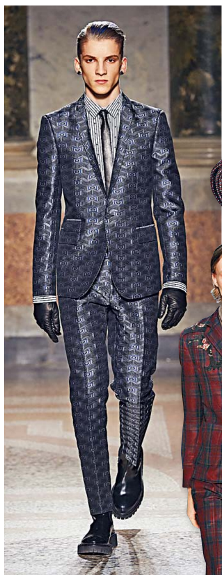
■ Les Hommes