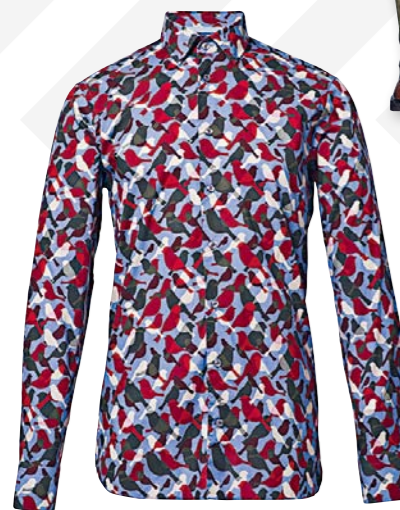
■ Van Laack