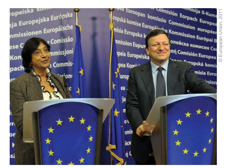
Navi Pillay, United Nations High Commissioner for Human Rights and José Manuel Barroso, President of the European Commission

For the past ten years, the contributions from the EC have enabled OHCHR to support and strengthen international and regional mechanisms for the protection and promotion of human rights, justice and the rule of law.