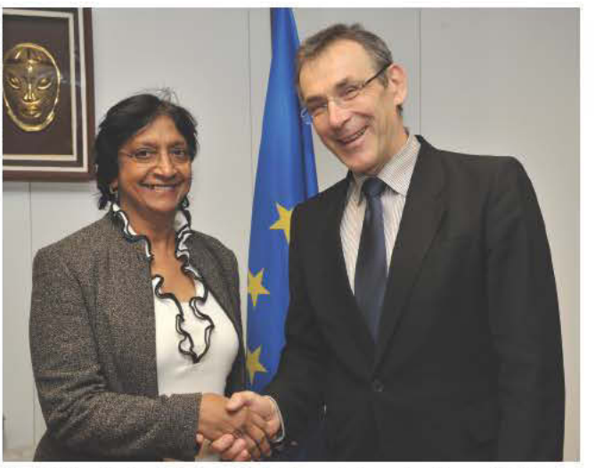
Navi Pillay, United Nations High Commissioner for Human Rights and Andris Piebalgs, European Commissioner for Development