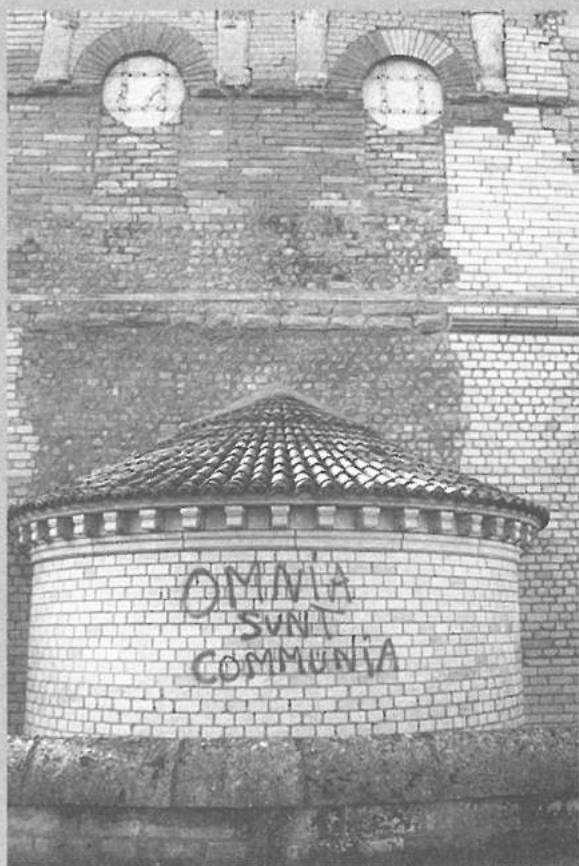
Poitiers, Baptistery of St. John, October 10, 2009.