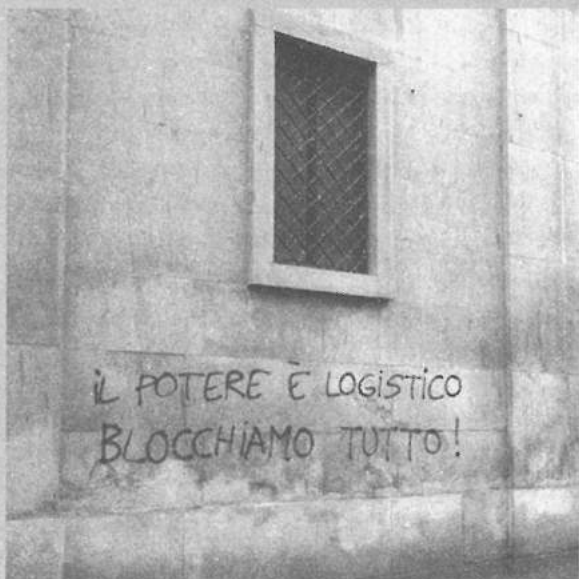
Turin, January 28, 2012.