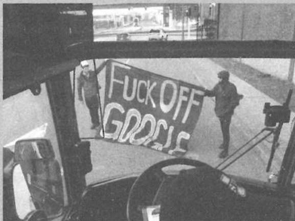
Oakland, December 20, 2013.