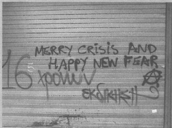
Athens, December 2008.