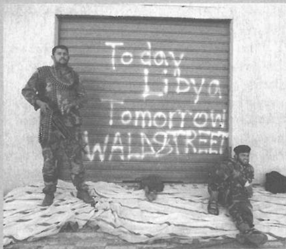
Sirte, October 2011.