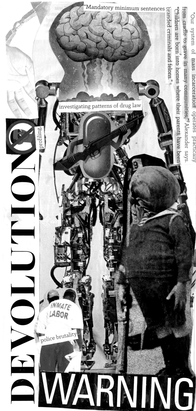
Artwork: Mass Incarceration War by Anastazia - 2015

Unstoppable is asking for contributions in the form of artwork, poetry, writings, social commentaries, fieldnotes from the prison yard or the streets, critical views of power structures and more. Unstoppable is particularly interested in focusing on gendered issues and systems of social control in the U.S. context, but we