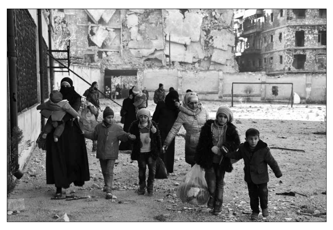
Above: Evacuating from Eastern Aleppo as the rebels prepared to surrender

Turkey, a member of NATO, has sent troops into northern Syria with the aim of preventing an independent