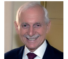
William Lacy Swing International Organization for Migration