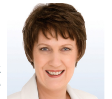
Helen Clark United Nations Development Programme