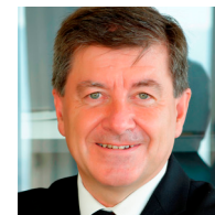
Guy Ryder International Labour Organization