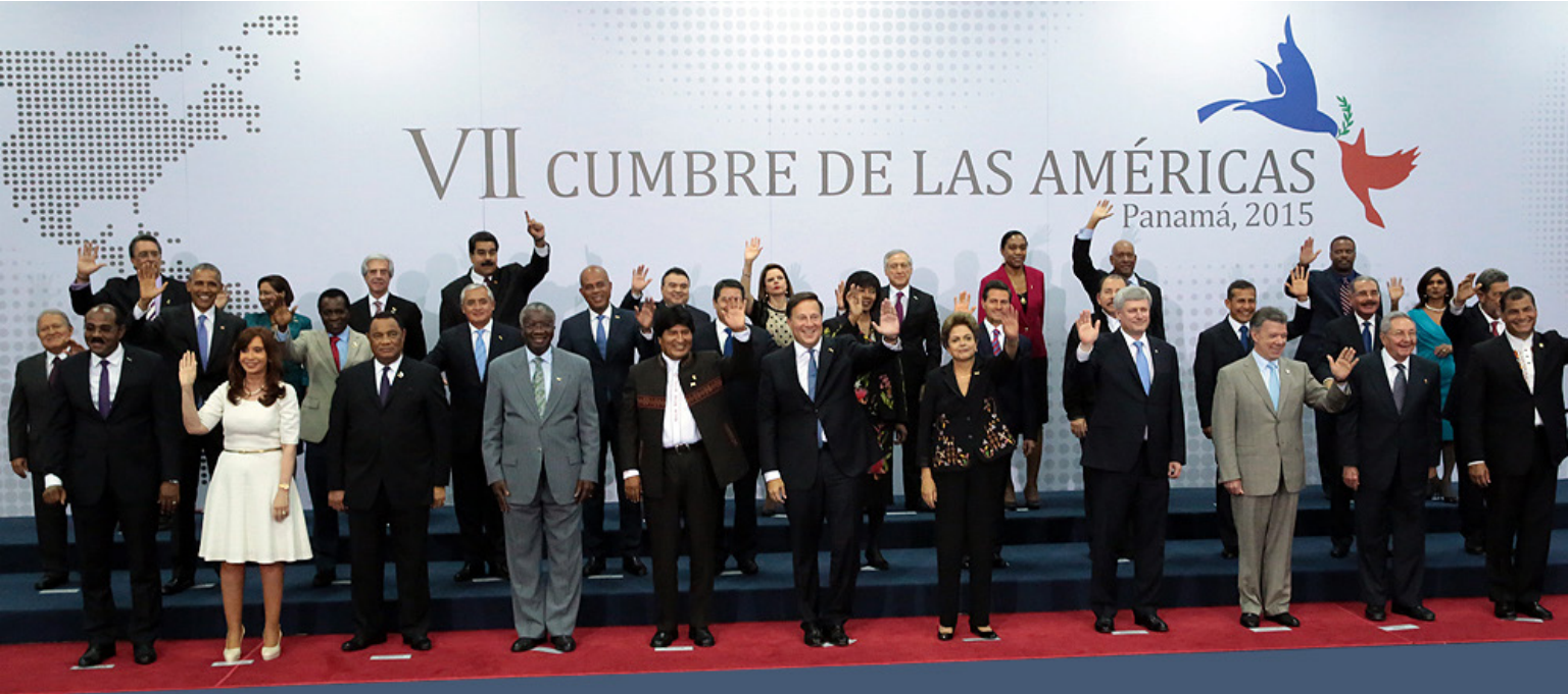
Seventh Summit of the Americas Panama City, Panama, April 10-11, 2015

President Juan Carlos Varela, Republic of Panama VII Summit of the Americas - April 11, 2015