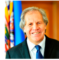
Luis Almagro Lemes Organization of American States