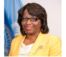
Carissa F. Etienne Pan American Health Organization