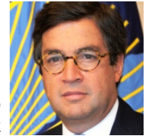
Luis Alberto Moreno Inter-American Development Bank