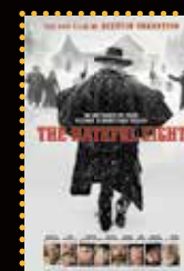
The Hateful Eight Now Showing

Palace Sydney | PalaceSydney | Palace Cinemas