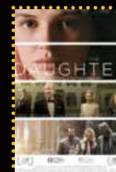
The Daughter March 3