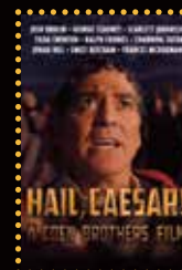
HAIL, CAESAR! February 18