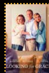
Looking for Grace Now Showing