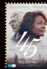
45 Years February 11