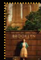
Brooklyn February 4