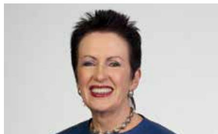
CLOVER MOORE LORD MAYOR OF SYDNEY

The Spectrum Now Festival is created by Sydney, for Sydney, and is connected by ANZ – we welcome you to the event for 2016.