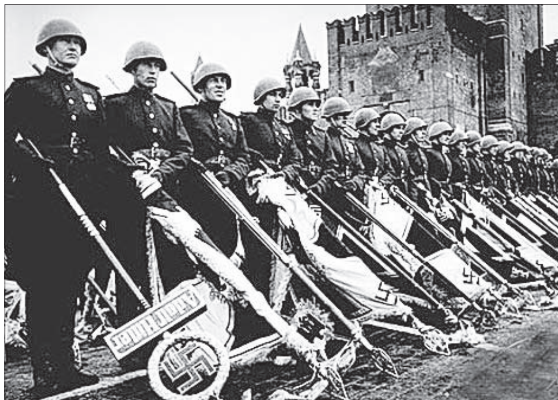
Victory Parade, Red Square, Moscow, May 1945.

Burying all memory of the Soviet contribution is a main theme of Western propaganda and the basis of much of its rewriting of history. The sacrifice of 27 million people requires that we never forget. ☼