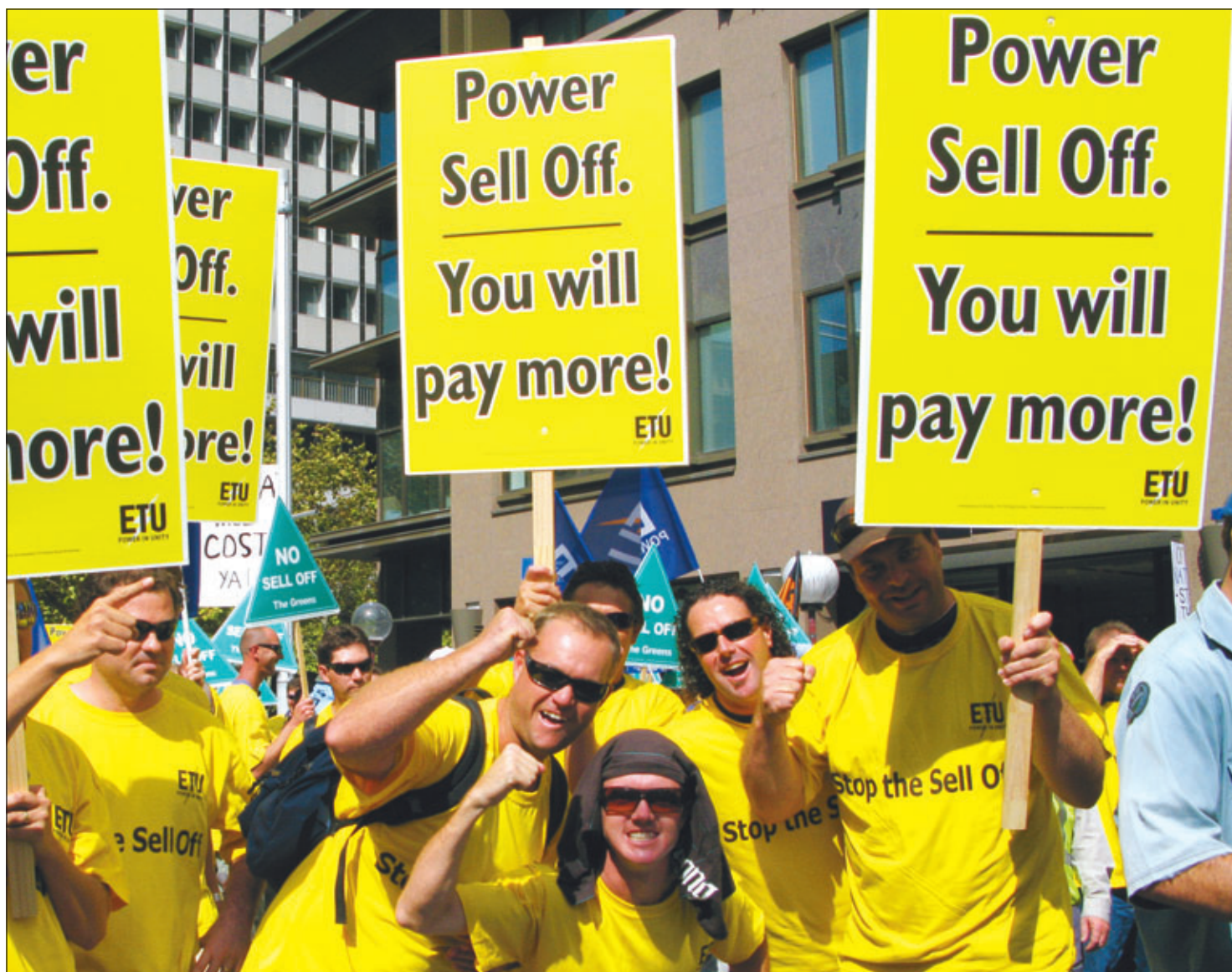
"Stop the sell off" protest in Sydney, 2008.

on lower incomes unable to afford heating and hot water