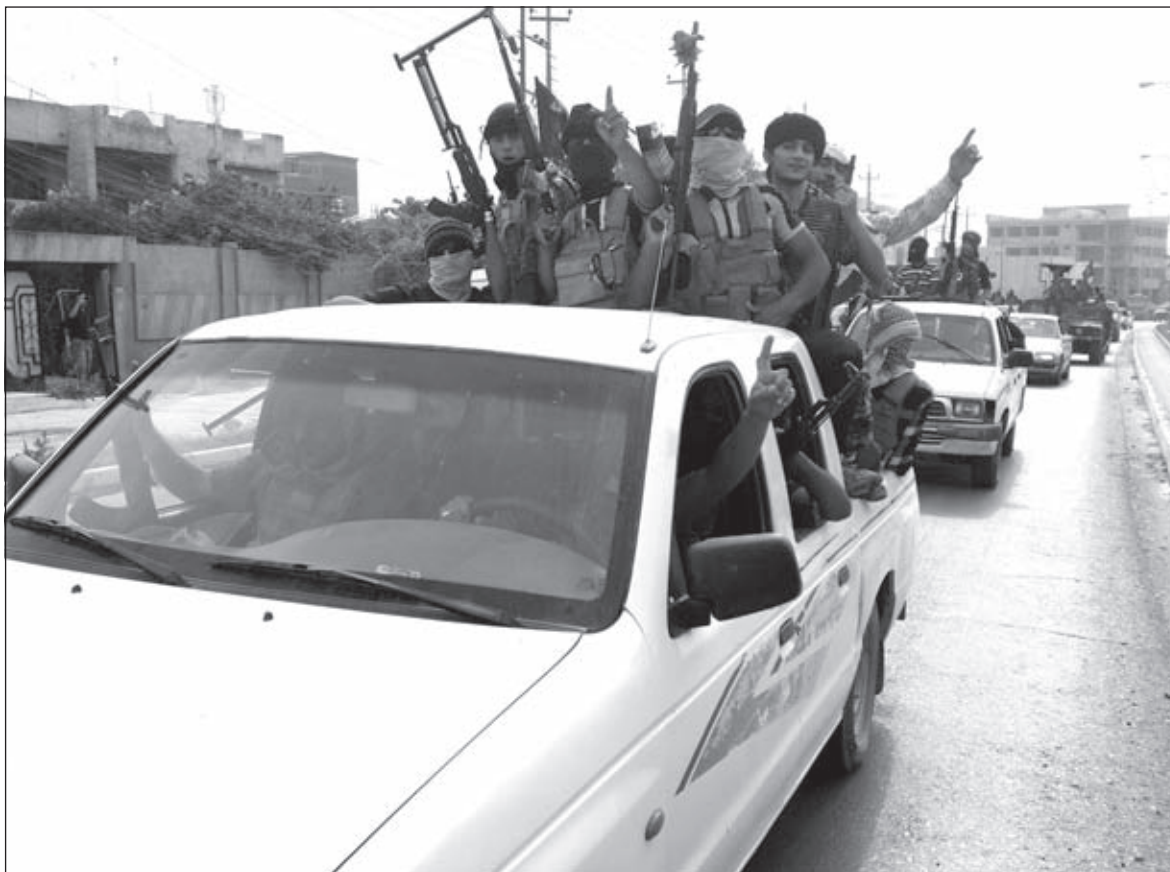
Fighters of the ISIS celebrate on vehicles taken from Iraqi security forces in Mosul, Iraq.

It is a de-facto re-invasion of Iraq by Western interests – but this time without Western forces directly