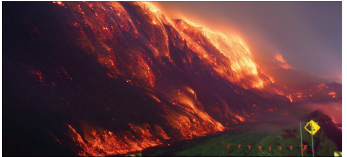
Scientific information clearly shows that all residents should have been evacuated soon after the fire started.

Trace and other elements formed in coal combustion including a large group of diverse pollutants with a number of health and environmental effects. They are a public health concern because, at sufficient levels, they adversely affect human health. Some are known carcinogens, others impair reproduction and the normal development of children and still others damage the nervous and immune systems. Many are also respiratory irritants that can worsen respiratory conditions such as asthma. They are of environmental concern because they damage ecosystems; they blow