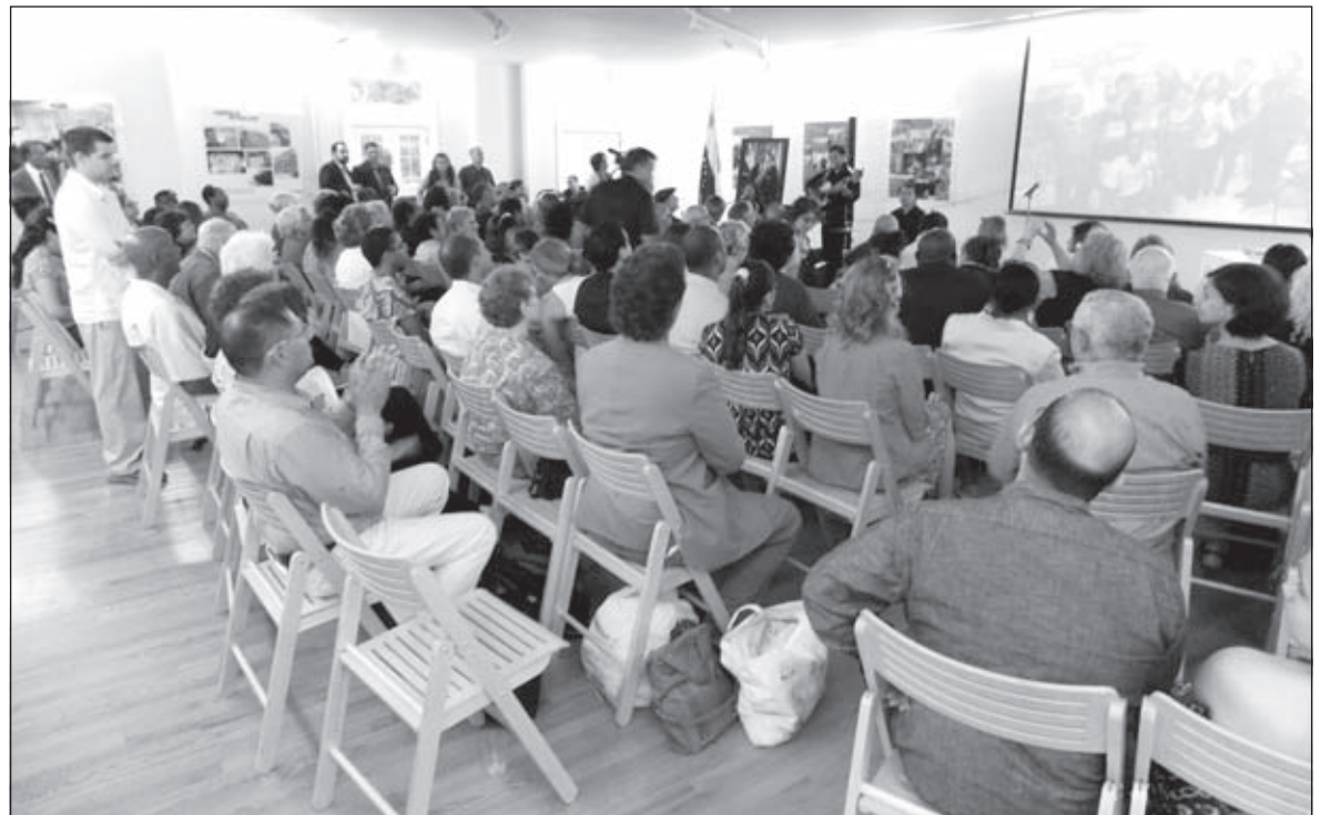
The closing ceremony of the Washington meeting.

Australian unionists joined the protestors at the White House and the Capitol in the global demand for justice and to remedy the miscarriage of justice. ✪