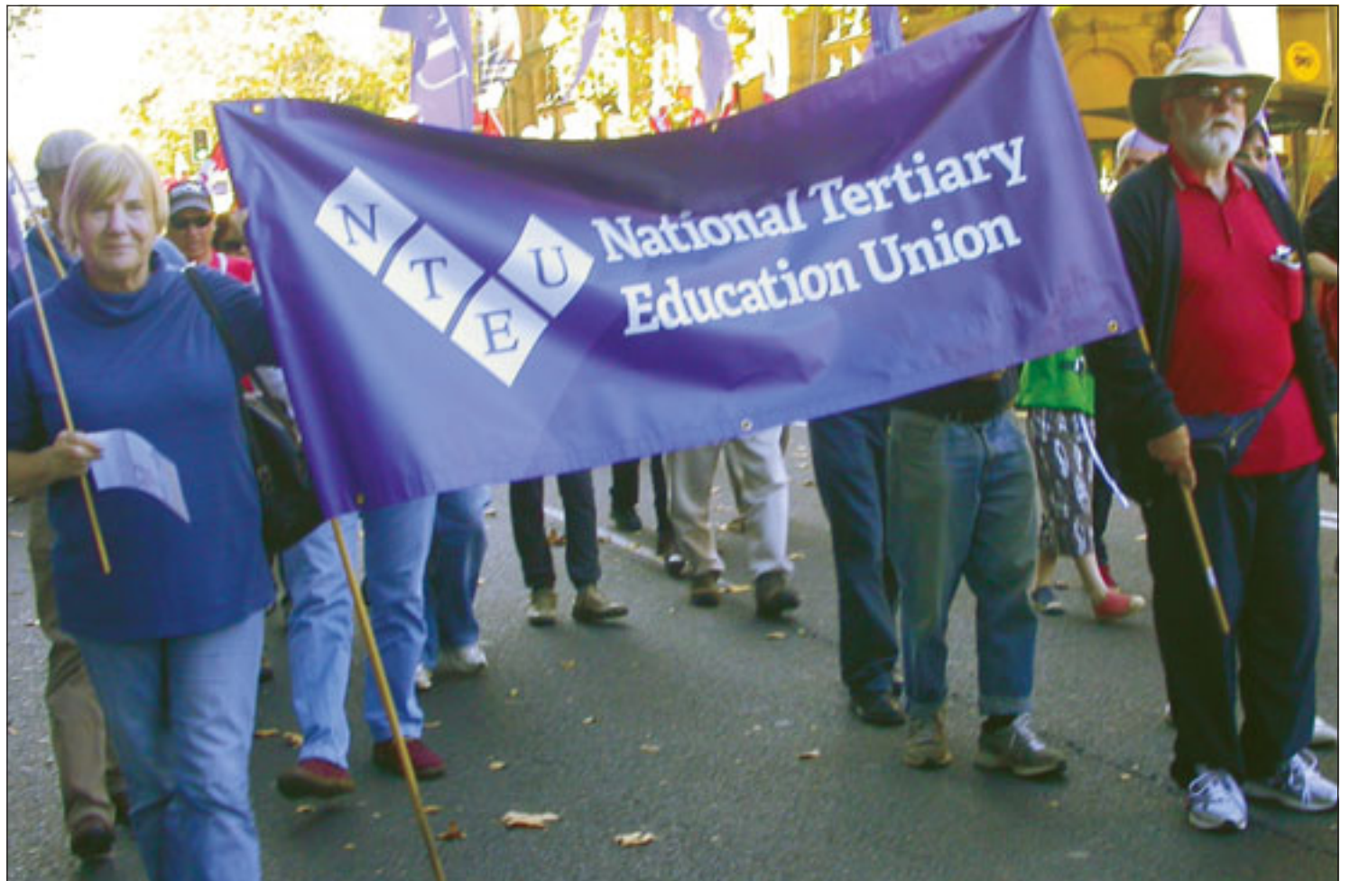
May Day 2014 - Sydney.

The government deliberately restricts the Audit's scope to government spending, to making "savings". The terms of reference exclude the review of government income.