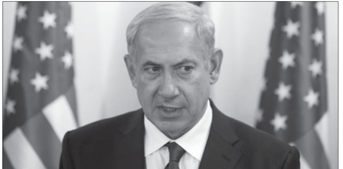
Israeli Prime Minister Benjamin Netanyahu refuses to deal with anyone who wishes the destruction of Israel, yet he is actively pursuing the complete annihilation of Palestine.

At least partly because of this unspeakable inequality by the US since 2000, 1,109 Israelis have been killed in conflicts with Palestinians, yet 6,862 Palestinians have been killed. Among the population of children, 129 Israeli children have died, and at least 1,523 Palestinian