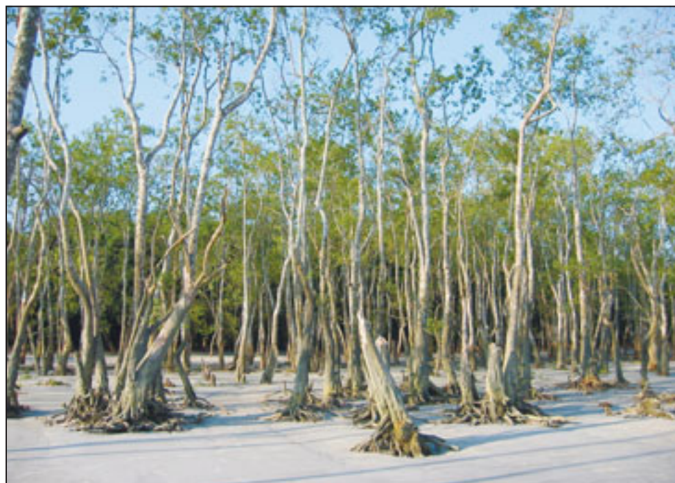
The Sundarbans is the largest single block of tidal mangrove forest in the world.

The Sundarbans is home to many different species of birds, mammals, insects, reptiles and fishes. Over 120 species of fish and over 260 species of birds have been recorded in the Sundarbans. About 50 species of reptiles and eight species of amphibians are known to occur. The Bangladeshi Sundarbans now support the