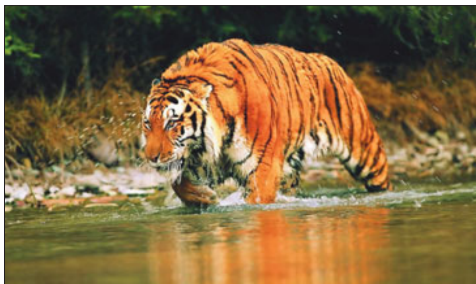
The wild forested areas of the Sundarbans are critically important habitat for endangered Tigers and support one of the largest populations of Royal Bengal Tiger.

only population of the Estuarine, or Salt-Water Crocodile in Bangladesh; the population is estimated at less than 200 individuals. While the Estuarine Crocodile still survives, its numbers have been greatly depleted through hunting and trapping for skins. The Mugger Crocodile is now extinct in the area, probably as a result of past over-exploitation, but it still occurs in one location nearby.