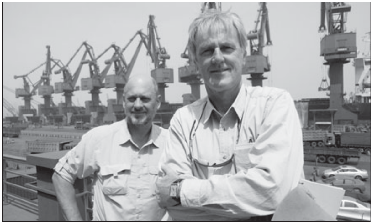
Tim Flannery and John Doyle at Port of Tianjin, Beijing – Two Men In China (ABC1 Tuesdays from May 13 at 8.30pm).