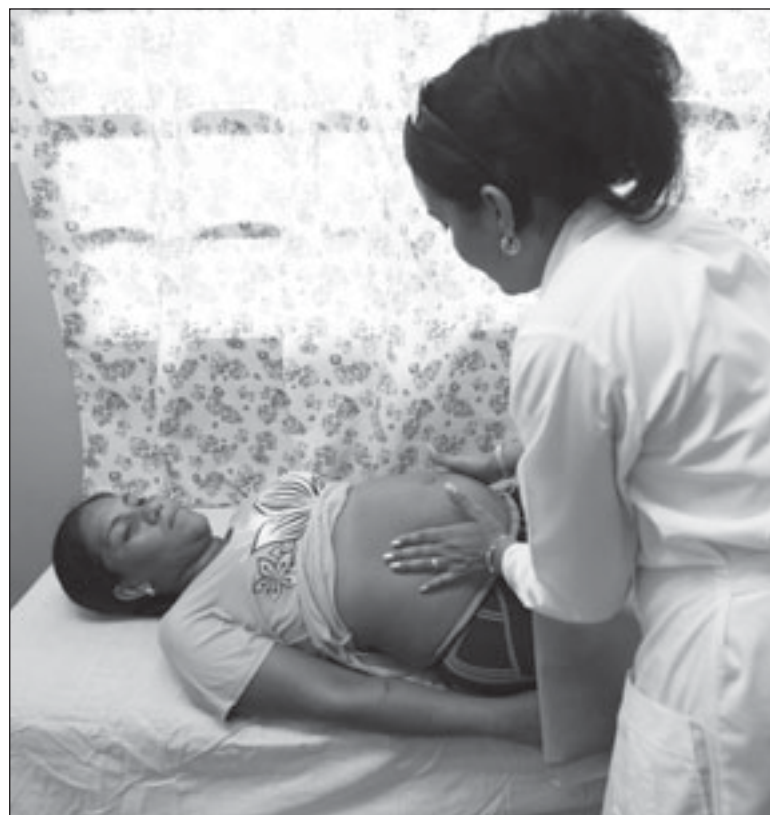
A Cuban doctor checks on a pregnant woman at a Barrio Adentro clinic in Naiguatate in the state of Vargas, Venezuela.