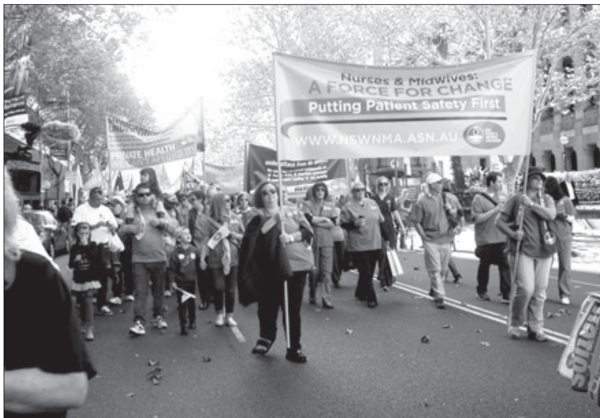
Sydney May Day 2014.

The above proposals are in a section of the report titled "Short to medium term reforms". They are the thin edge of the wedge. The means testing for Medicare eligibility could be adjusted very easily downwards at