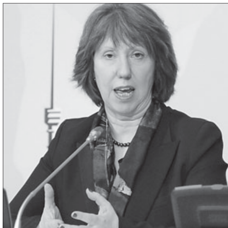
EU foreign policy chief Catherine Ashton should resign immediately and an investigation should be started. What else does she know about criminal acts committed in Ukraine?