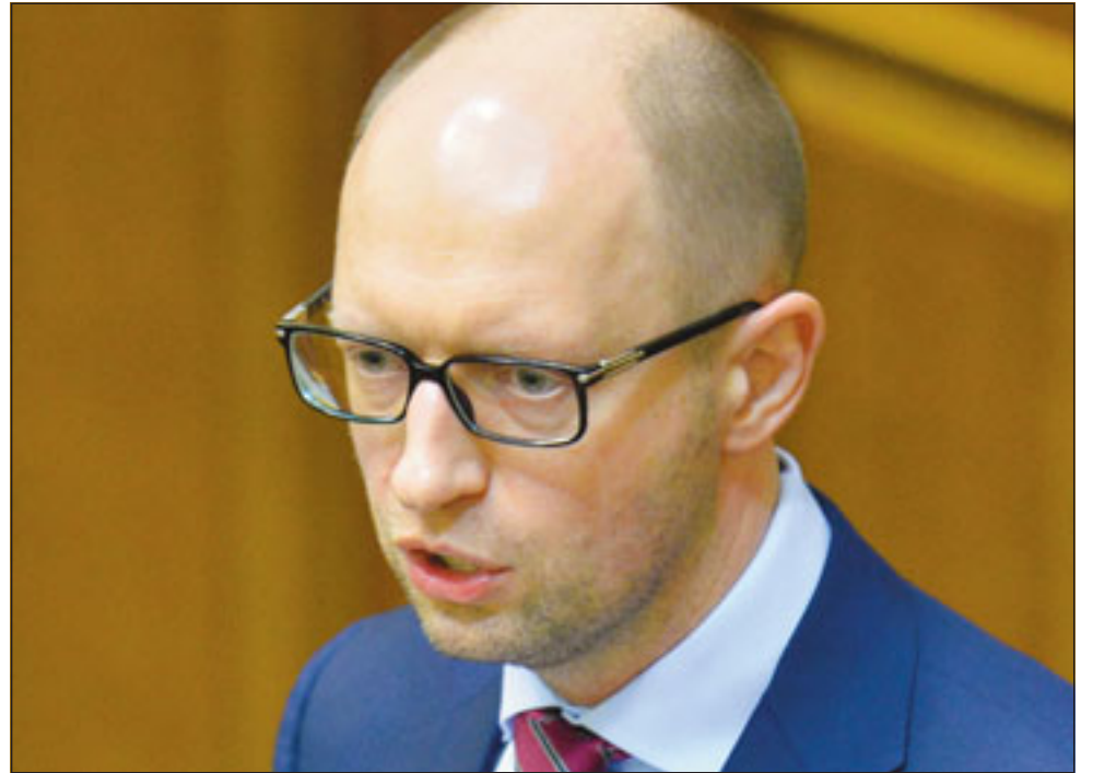
Ukraine's Arseniy Yatsenyuk was US Assistant Secretary of State Victoria Nuland's pick for PM on the infamous "F...k the EU" tape.

"Prime Minister Arseniy Yatsenyuk, together with UDAR leader Vitaliy Klichko, brought Svoboda into the opposition coalition