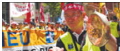
Abbott wants bosses' unions or no unions