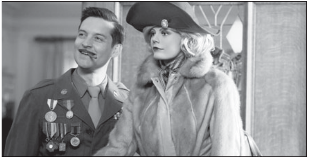
Devon Morehouse (Tobey Maguire) & Lady Anne – The Spoils Of Babylon (ABC2 Thursdays from March 20 at 9.30pm)