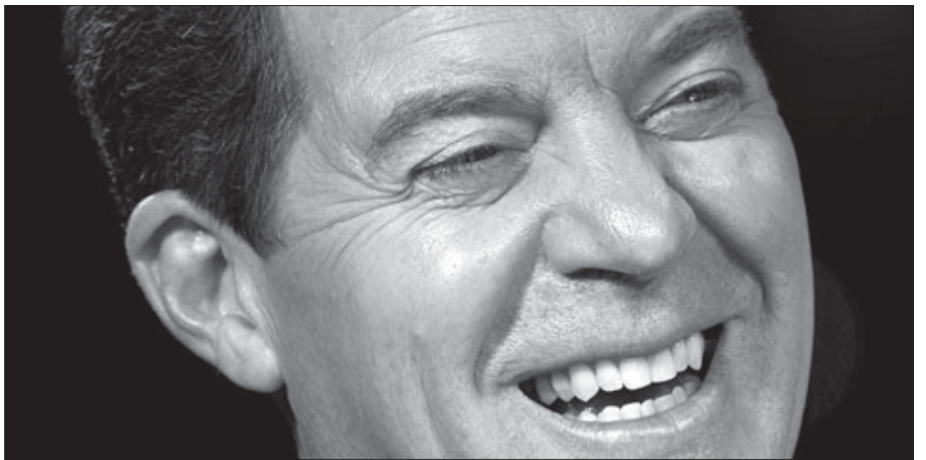
The North Korean Human Rights Act was sponsored by Senator Sam Brownback of Kansas.

Much comfort that will be to ordinary people in Britain or Australia, as Britain’s NHS and Australia’s Medicare are earmarked for destruction, environmental pollution is encouraged to continue unabated, pensions and welfare are cut and the flight of jobs to low wage countries goes on unchecked. ☹