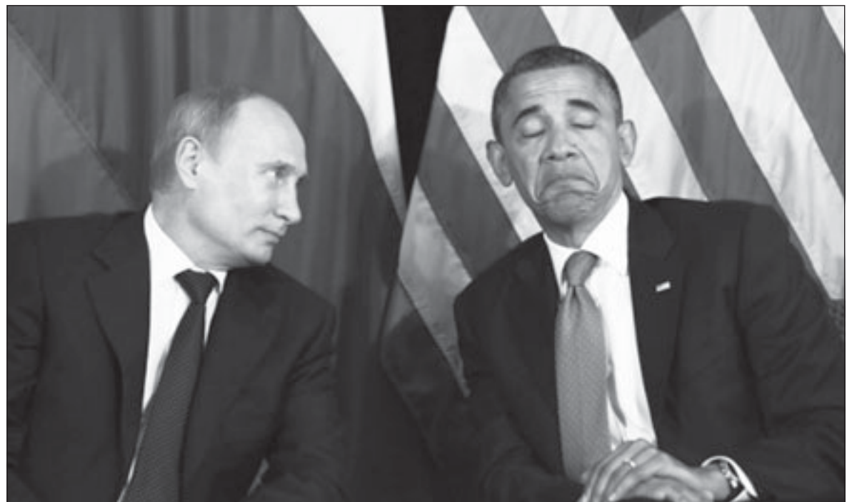
Russia will not passively sit by while the Western-backed coup, led by violent fascist forces and local billionaires, overthrows a democratically elected government and installs a puppet regime on its border.

What are the real objectives and why is Russia so alarmed? Could it be the US-NATO campaign to militarily surround Russia and bring neighbouring countries into the western military and financial orbit? Might it be that the largest supply of natural gas in the world is in Russia and the pipelines go through Ukraine, or that global warming is opening the Arctic to oil drilling and Russia borders the Arctic? It is clear that Russia will not passively sit by while the Western-backed coup, led by violent fascist forces and local billionaires, overthrows a democratically elected government and installs a puppet regime on its border. ✪