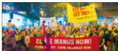
Manus Island tragedies