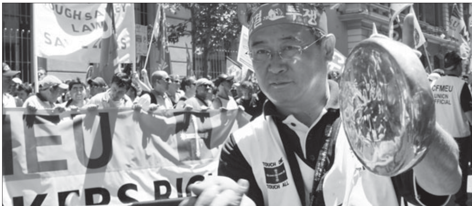
An anti-ABCC rally in Sydney, 2009.

One of the most notorious sites is the Royal Adelaide Hospital which has been riddled with safety issues. Fifty sheets of wood fell more than two metres onto decking in one incident as a crane lost its load in November last year. It is sheer luck that no one was on the deck underneath. It