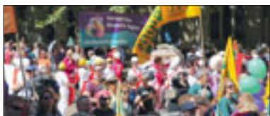
IWD March Sydney